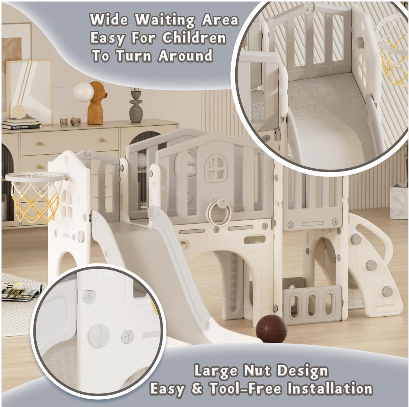
Image 4.1: Detail of the large nut design, which simplifies the assembly process, and the spacious waiting area at the top of the slide.