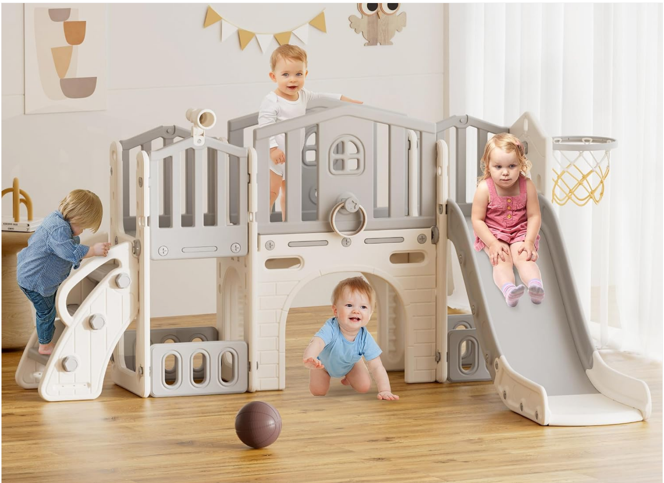
Image 1.1: The XJD 9-in-1 Toddler Slide Set in use, showing its various play areas including the slide, climbing steps, and central play structure.