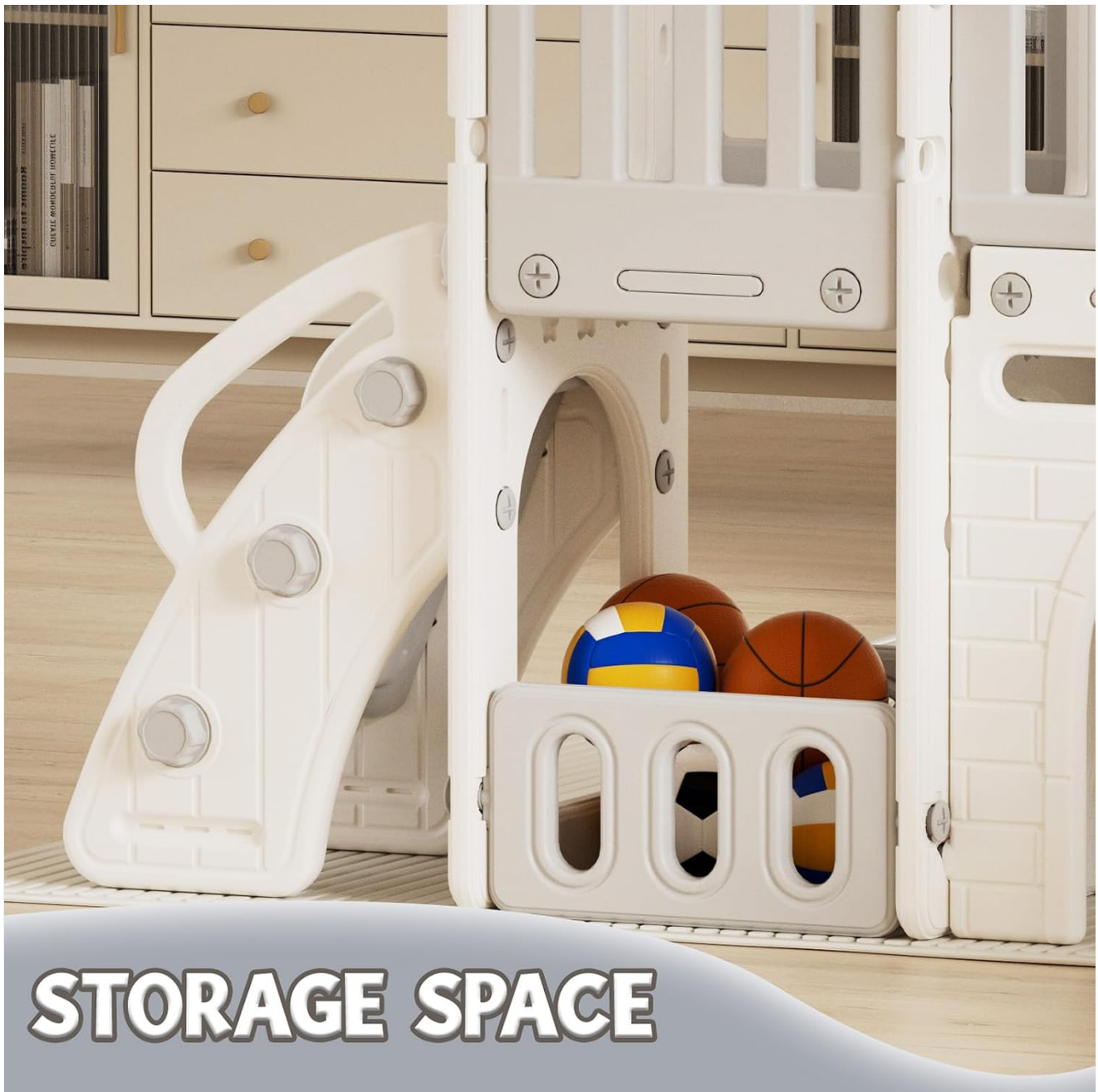
Image 5.3: The integrated storage space, useful for keeping play areas tidy.