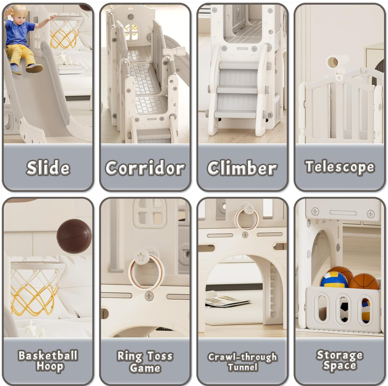
Image 3.1: Visual representation of the 9-in-1 features, which are composed of various structural components.