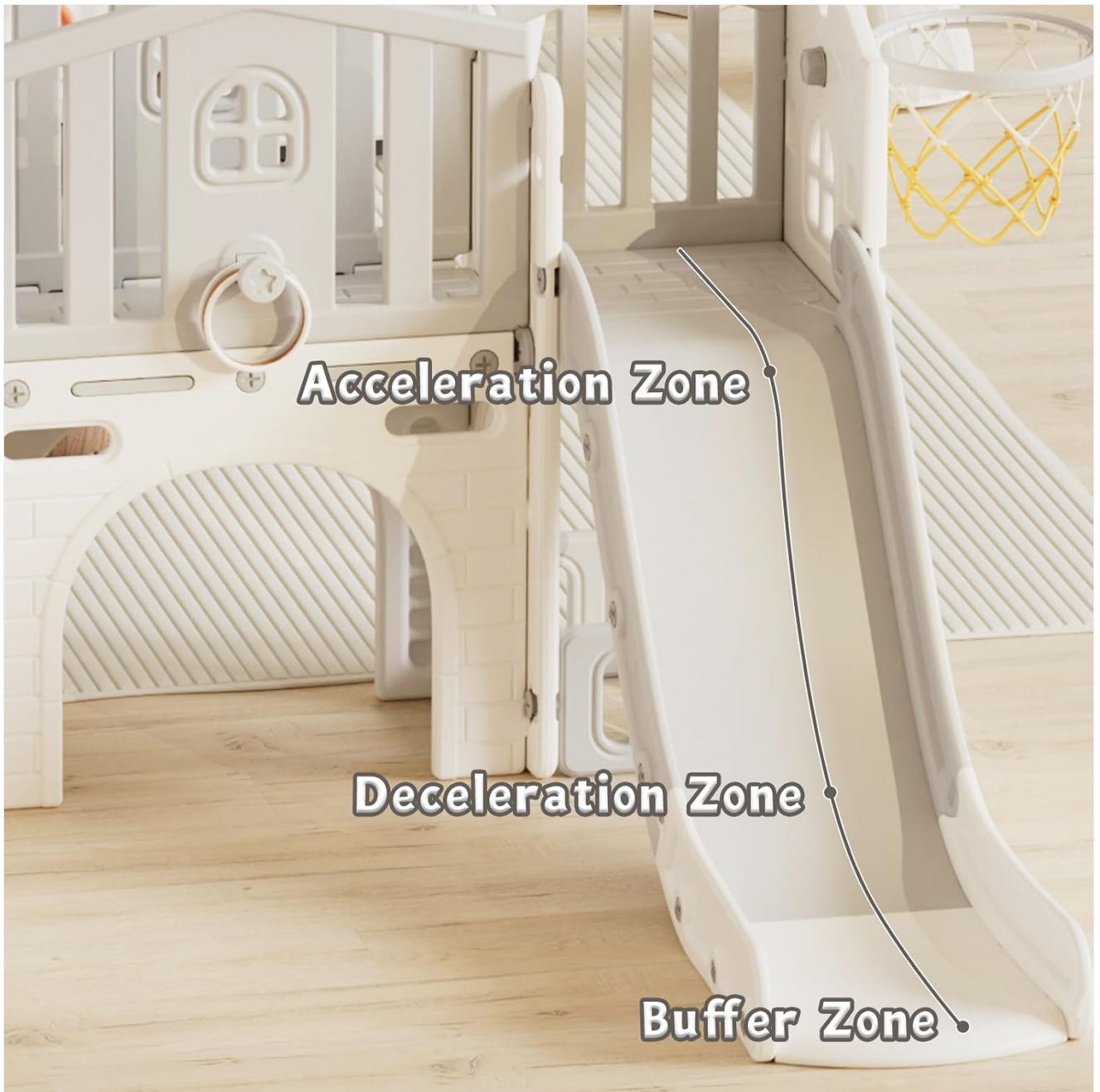
Image 5.1: Illustration of the slide's design, engineered with distinct zones for a safe and controlled sliding experience.