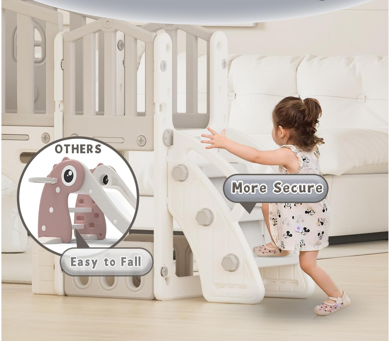
Image 2.1: The enclosed staircase design, highlighting its secure nature for toddlers climbing up to the slide platform.