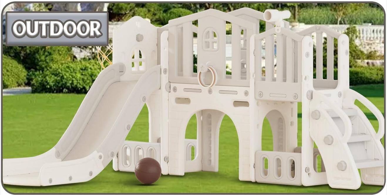
Image 5.2: The playset is suitable for both indoor and outdoor use, demonstrating its versatility.