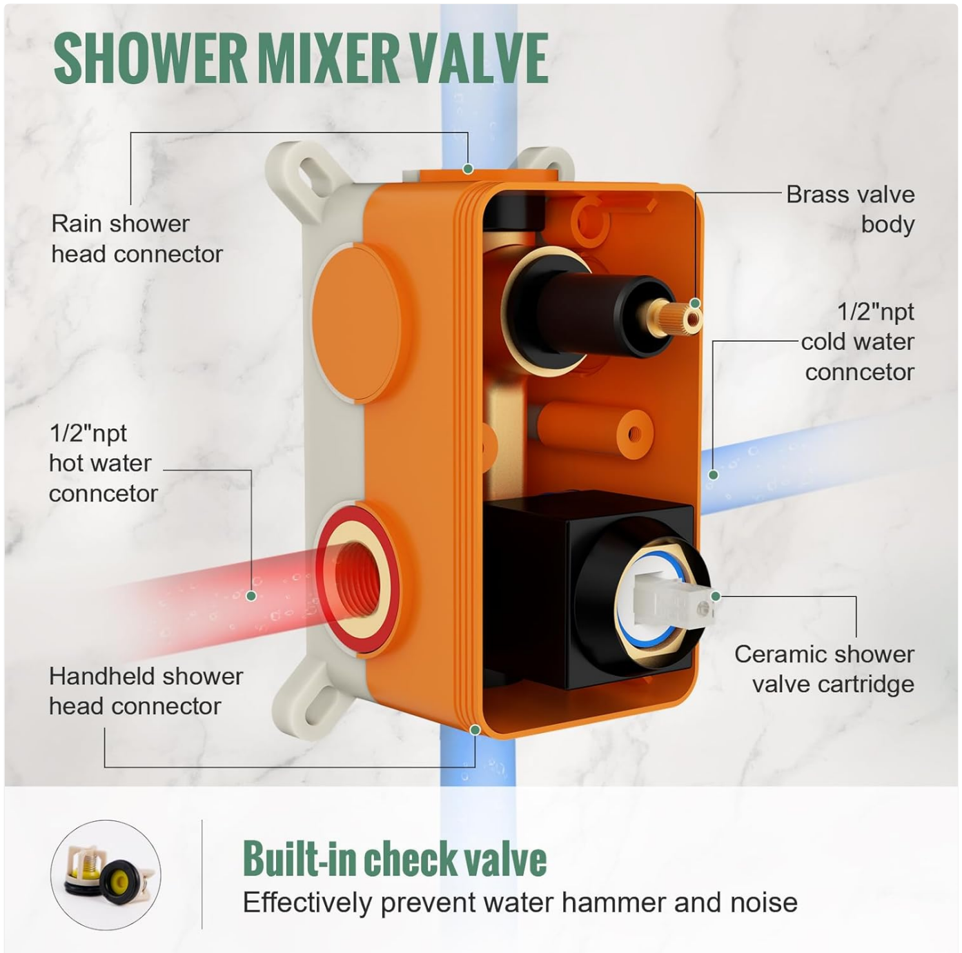
Figure 2.1: Detailed view of the shower mixer valve and its connections.