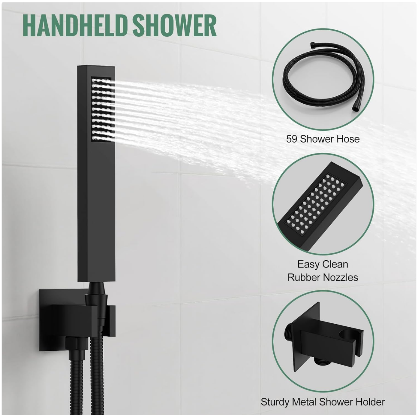
Figure 2.2: Handheld shower head, hose, and holder.