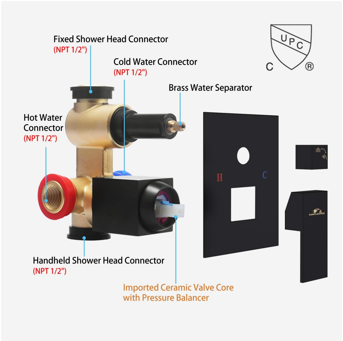
Figure 3.1: Diagram showing the rough-in valve connections for hot, cold, fixed shower head, and handheld shower.