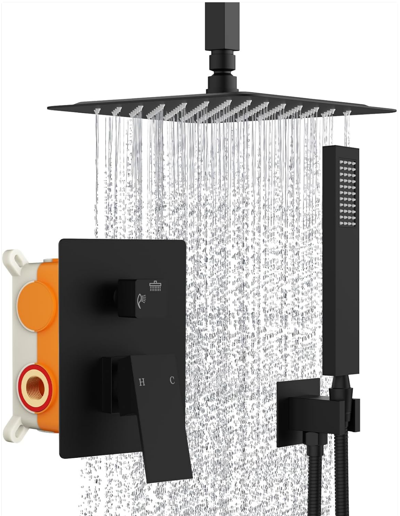
Figure 1.1: Complete SunCleanse Rainfall Shower Faucet Set.