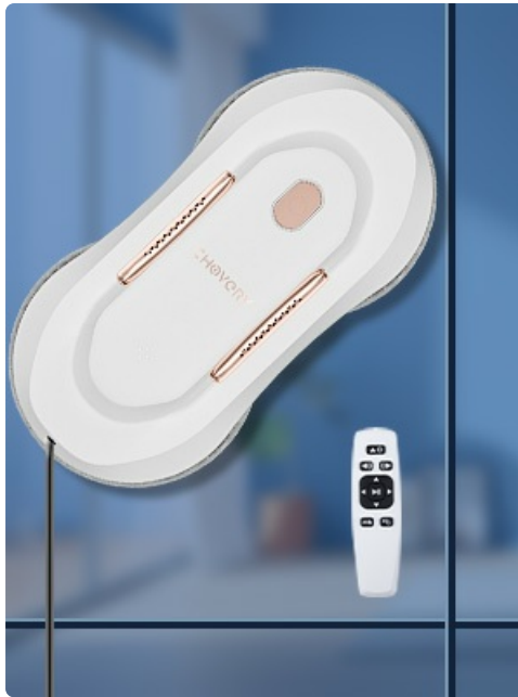
Figure 7: The robot can be controlled manually or automatically using the remote control.