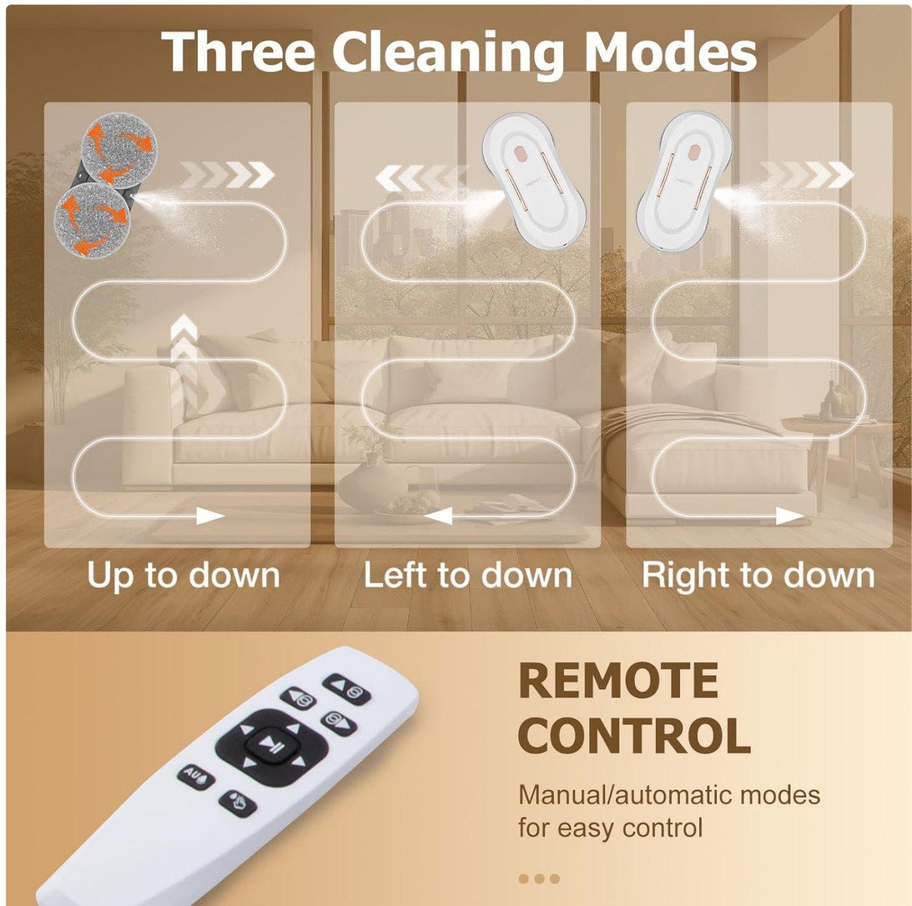
Figure 5: The three automatic cleaning modes available for comprehensive window cleaning.

Select your desired cleaning mode using the remote control. The robot will automatically detect window frames and obstacles.