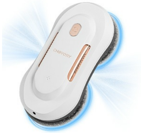
Figure 3: Suction power levels are adjustable to tackle various types of dirt, from rain prints to oil stains.