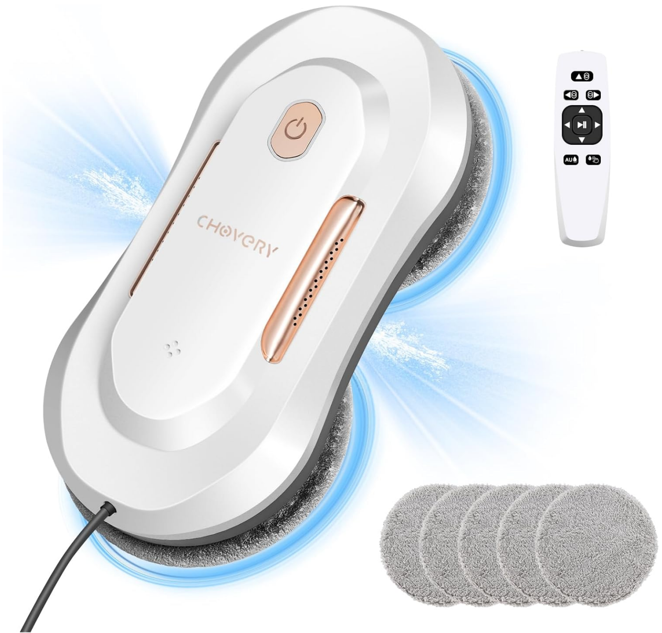
Figure 2: Overview of the CHOVERY CL3 Window Cleaner Robot and its included accessories.