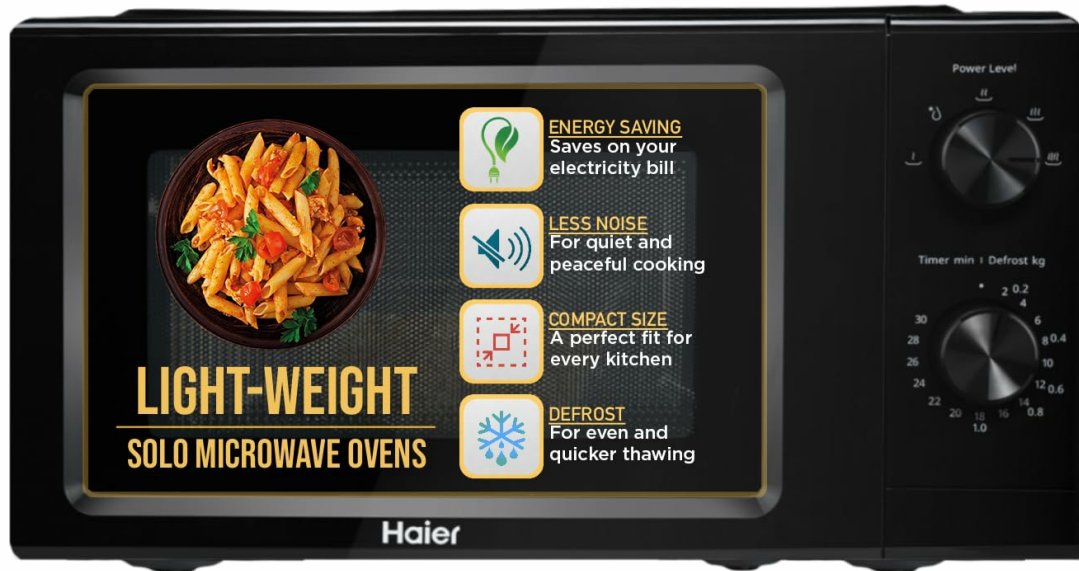
Figure 3.1: Front view of the Haier HIL1901MBPB Solo Microwave Oven.

The Haier HIL1901MBPB is a 19-liter solo microwave oven designed for reheating, defrosting, and basic cooking. It features Inverter Technology for consistent heating, a lightweight design for easy placement, and simple knob controls.