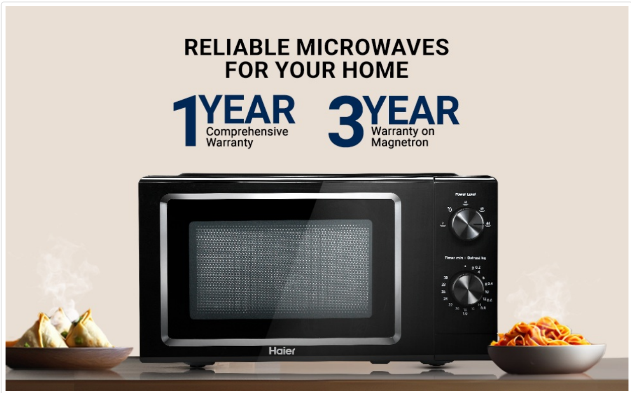
Figure 3.2: Dimensions of the microwave oven. Width: 436 mm, Height: 241 mm, Depth: 328 mm.