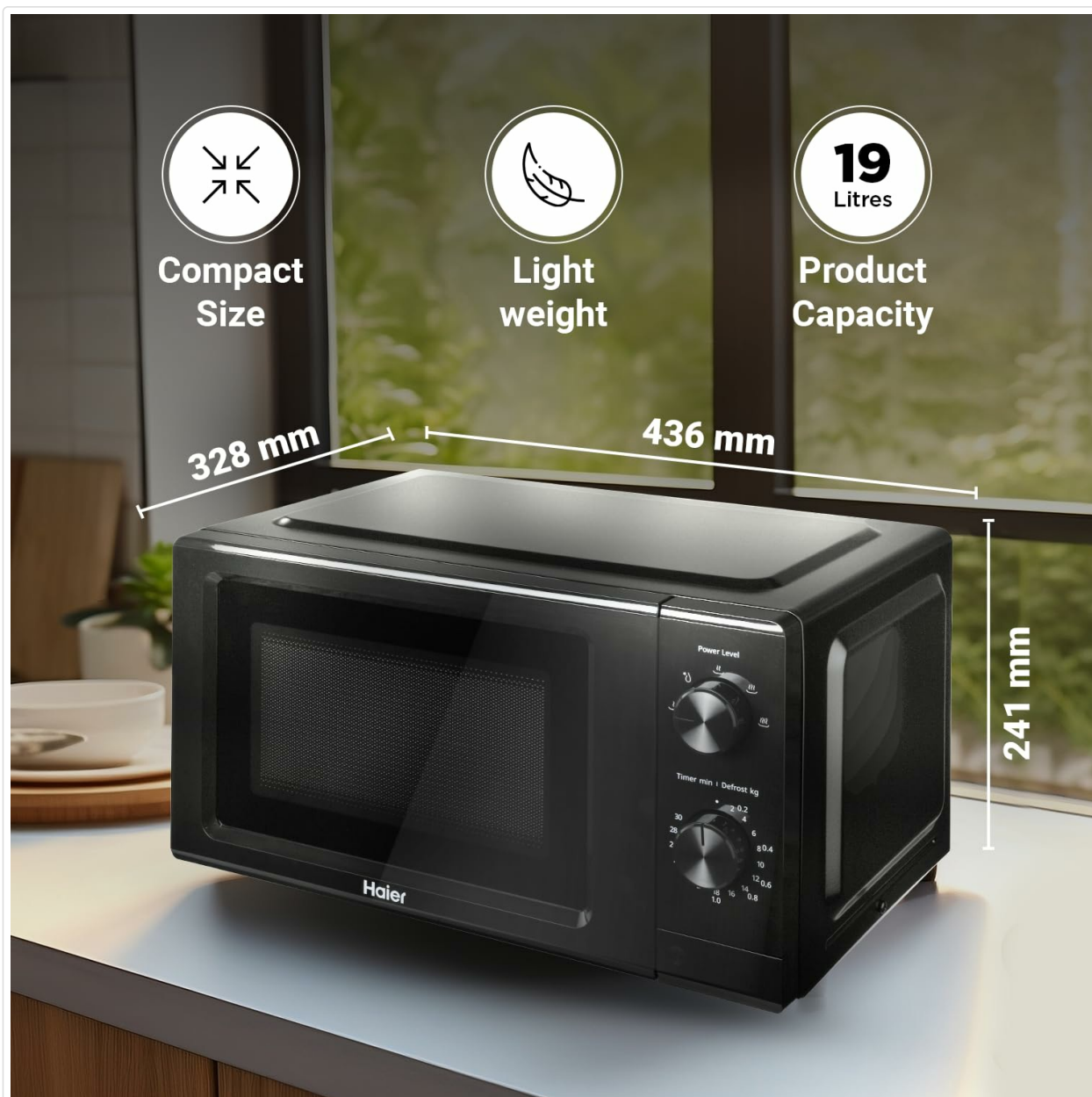
Figure 5.1: The control panel features two rotary knobs: one for Power Level and one for Timer/Defrost.