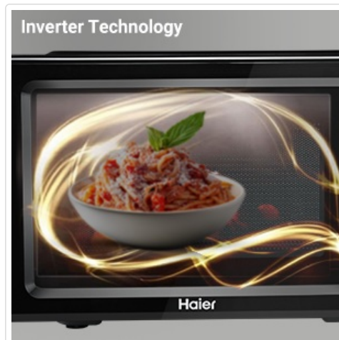
Figure 3.4: The defrost function allows for even and quicker thawing of various food items.