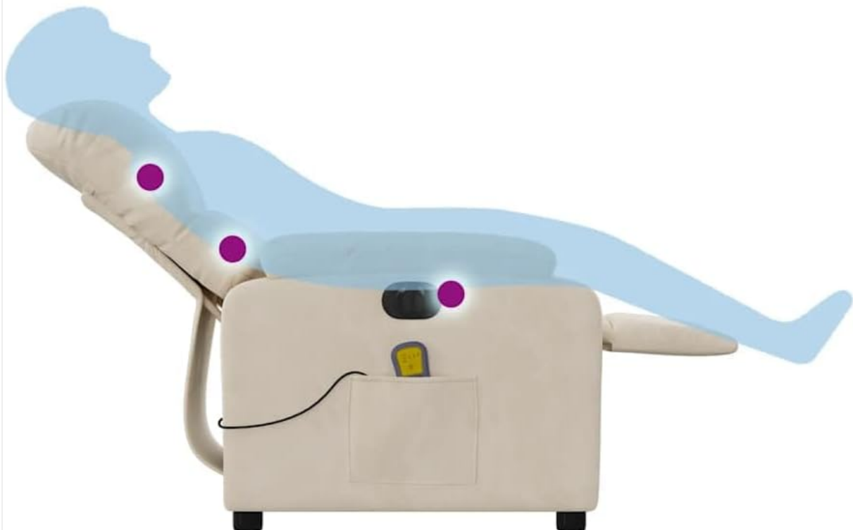
Image: Diagram illustrating the ergonomic design and various recline positions for reading, watching TV, and sleeping.