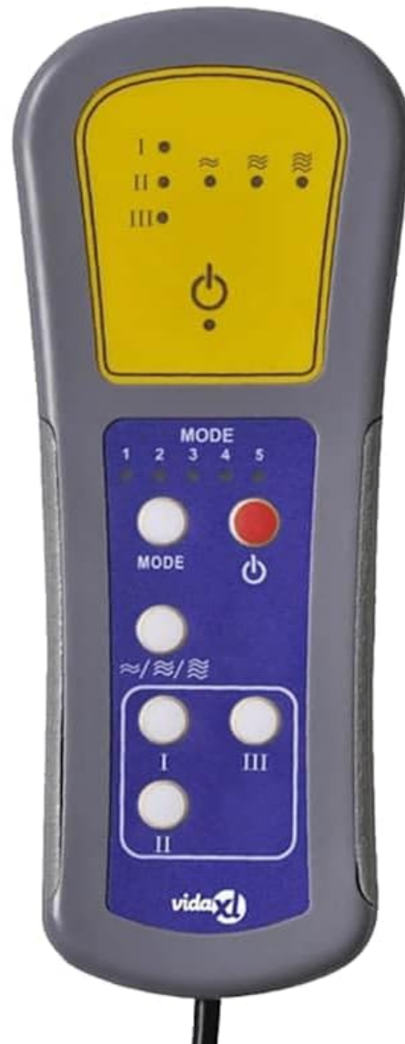
Image: Remote control for the massage function, displaying options for intensity, positions, and modes.