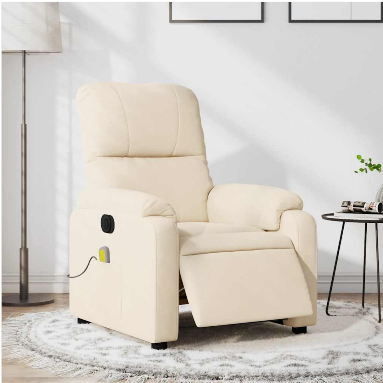
Image: The vidaXL Electric Massage Recliner Chair in beige, showcasing its design and appearance in a home environment.