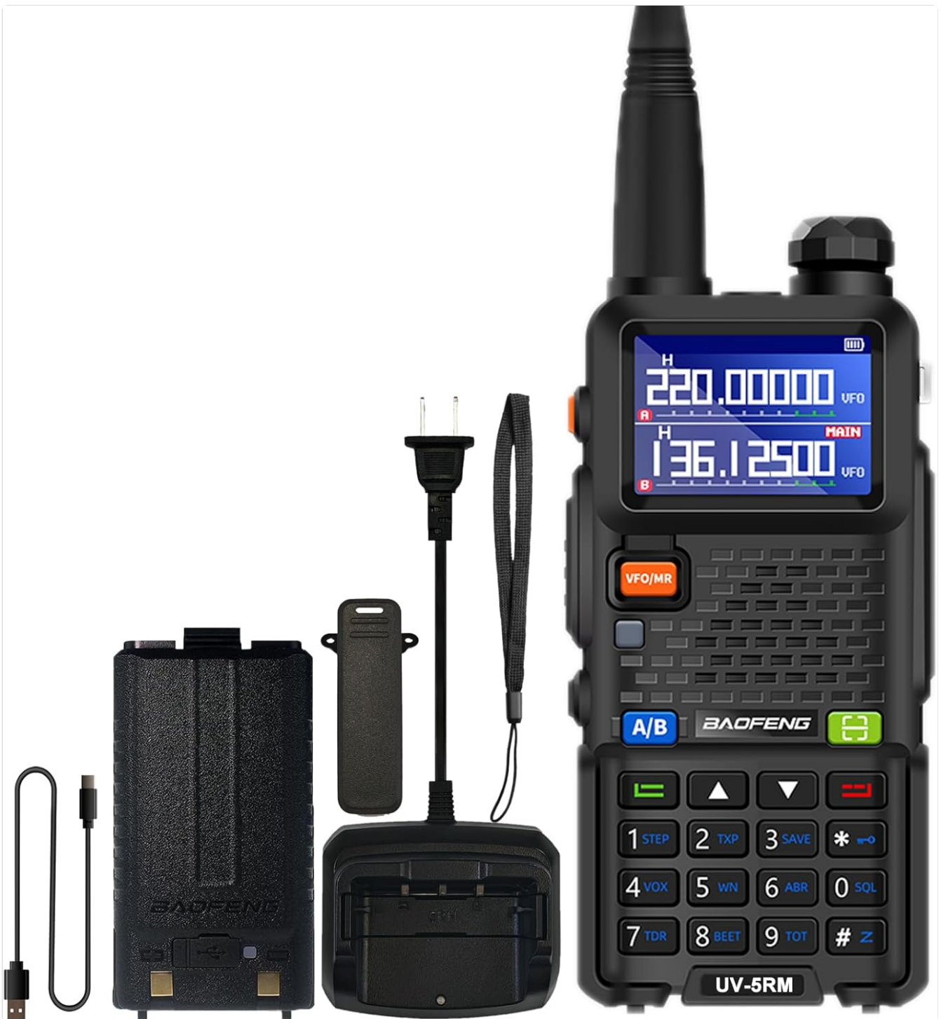
Image: The BAOFENG UV-5RM radio unit with its standard accessories, including the antenna, battery, and charging components.