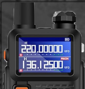
Image: Visual guide for the 'One Key Match Frequency' feature, illustrating the steps to quickly synchronize frequencies with another radio.

Switch to channel mode to select the channel, the screen will show the frequency of counterparties you can feel free to communicate now