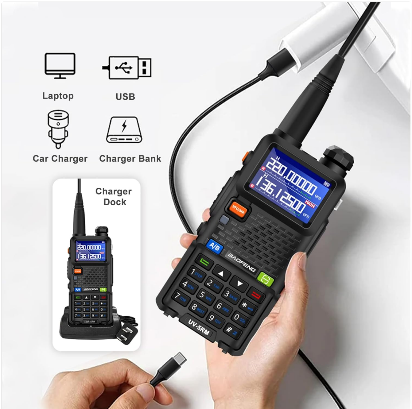
Image: The BAOFENG UV-5RM radio demonstrating both USB-C direct charging and charging via its desktop dock.

A full charge typically takes several hours. The radio can be charged in your car, with a power bank, or any USB interface device, providing flexibility for charging on the go.