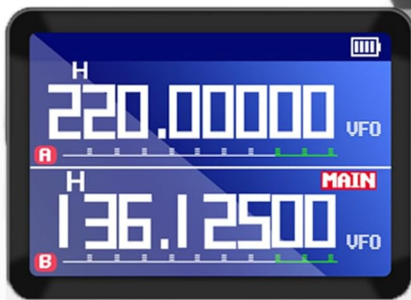
Image: Detailed view of the 1.77-inch LCD screen on the BAOFENG UV-5RM, illustrating its dual display capability and clear readability.