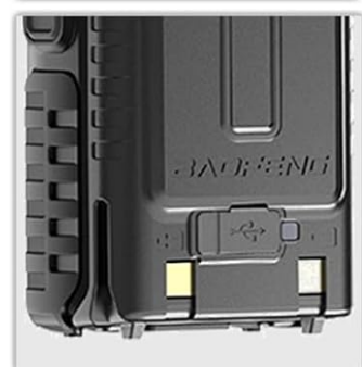
Image: An infographic summarizing the main features of the BAOFENG UV-5RM, such as multi-band capability, one-key frequency matching, USB-C charging, and a 1.77-inch LCD screen.