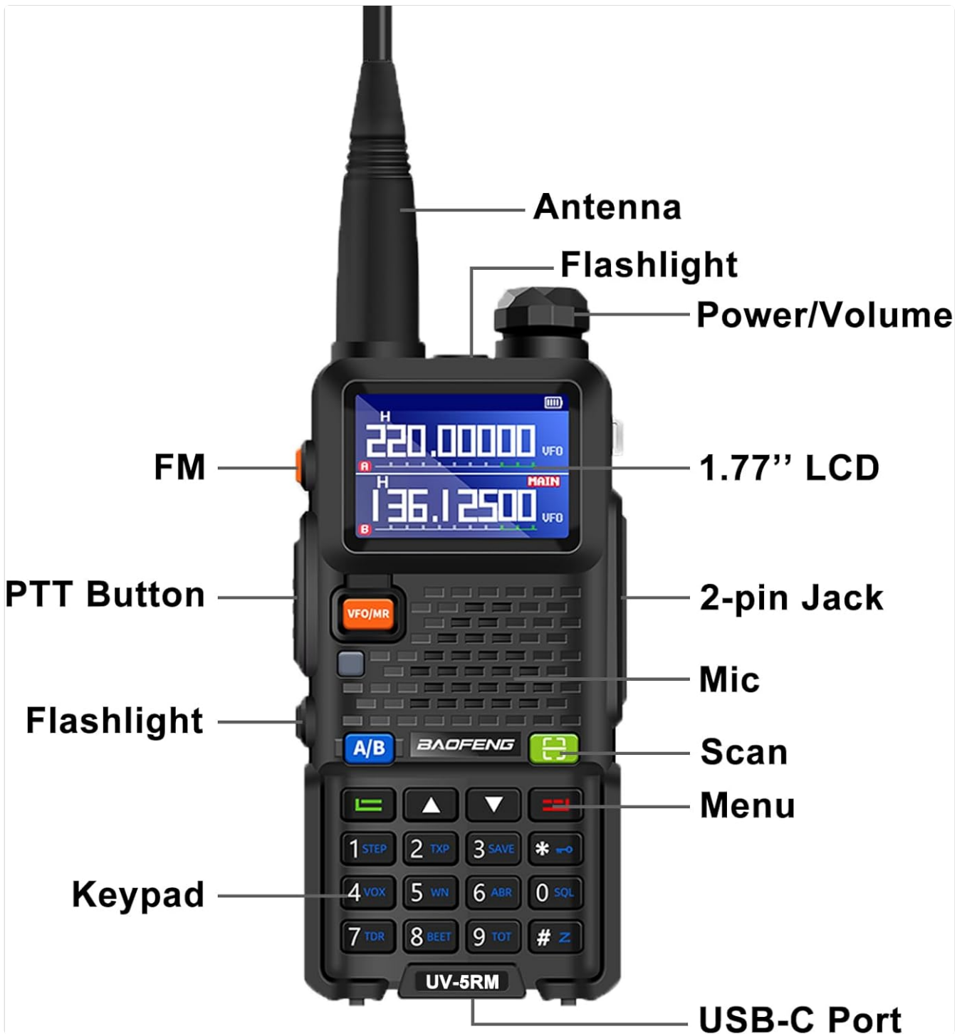
Image: Labeled diagram of the BAOFENG UV-5RM radio highlighting key components and controls.