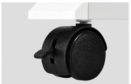
Wheels + adjustable height feet