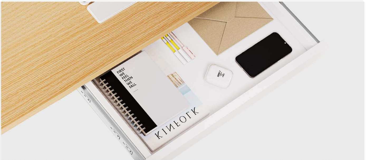
hidden keyboard tray placed