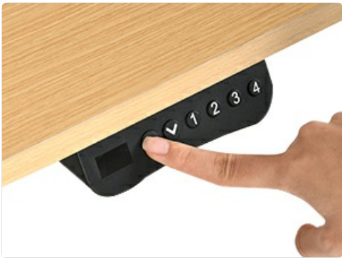
Image: Close-up of a hand interacting with the smart control panel, showing the up/down buttons and memory presets (1, 2, 3, 4).

The upgraded smart control panel features 4 Memory Modes, a Safe Lock Mode (to prevent accidental touches), USB Charging, Up and Down Keys, an LED Touch Display, and Anti-Collision Technology. These functions promote healthier work habits.