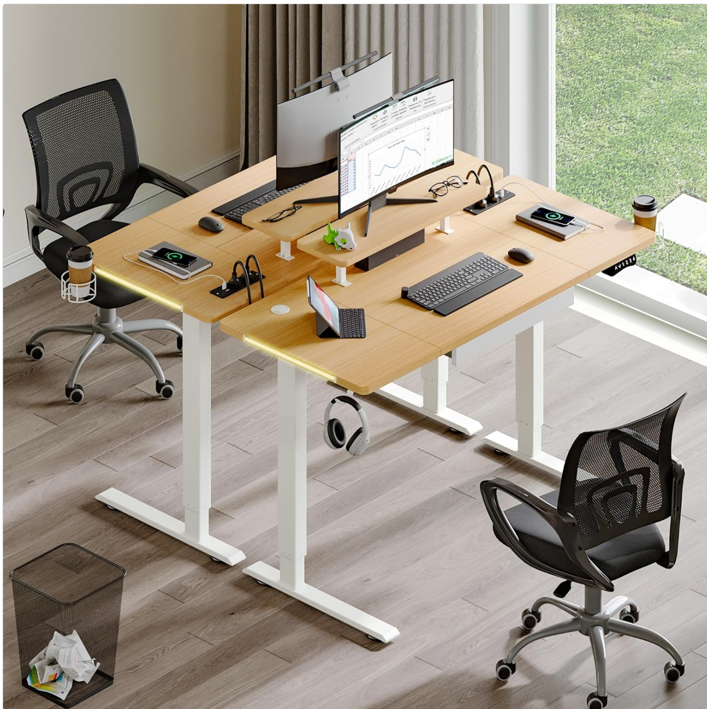
Image: Series of images demonstrating the adjustable RGB light strips on the desk, showing various color options and the desk with lights off and on, controlled by an app or remote.