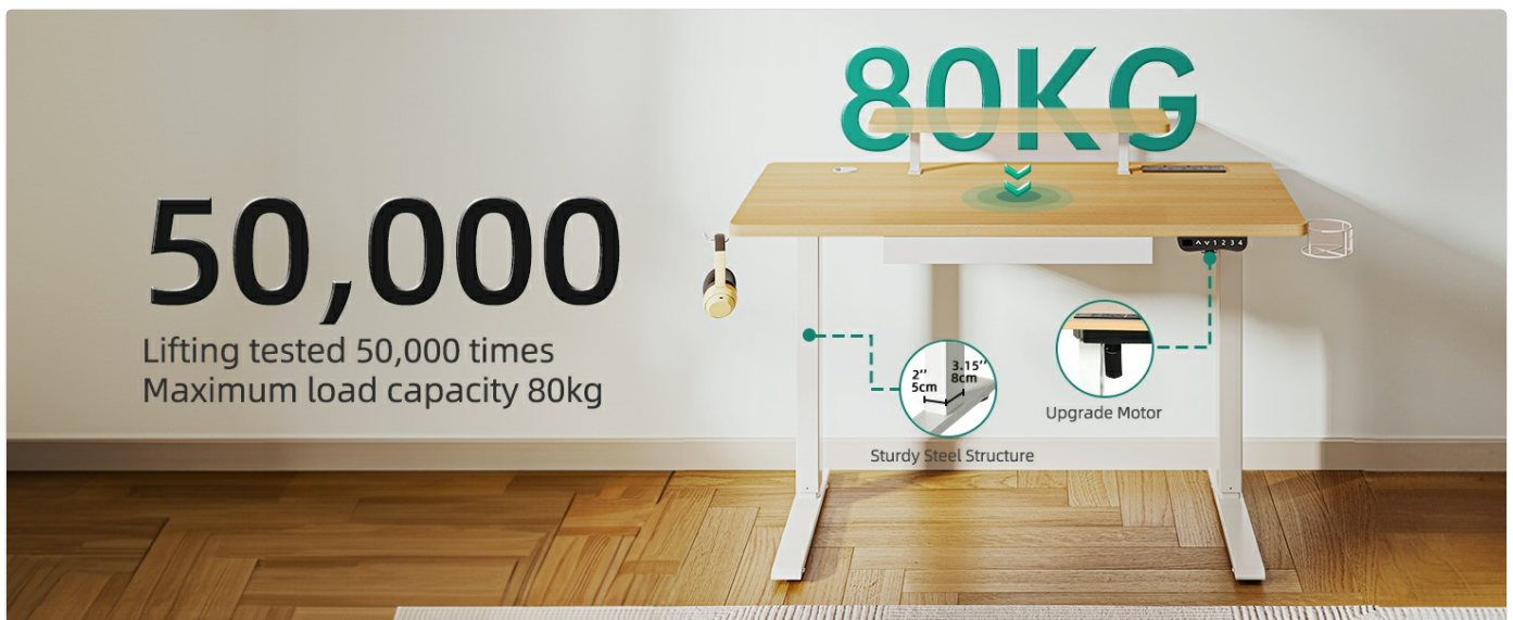
Image: Illustration showing the desk's sturdy steel structure, upgraded motor, and a maximum load capacity of 80kg, tested for 50,000 lifts.

The desk features a robust steel frame (8cm x 5cm with 1.5mm wall thickness) and an 18mm thick desktop, providing enhanced sturdiness and stability. It supports a maximum load of 80kg. The materials are non-toxic and odorless, ensuring an environmentally friendly and durable product.