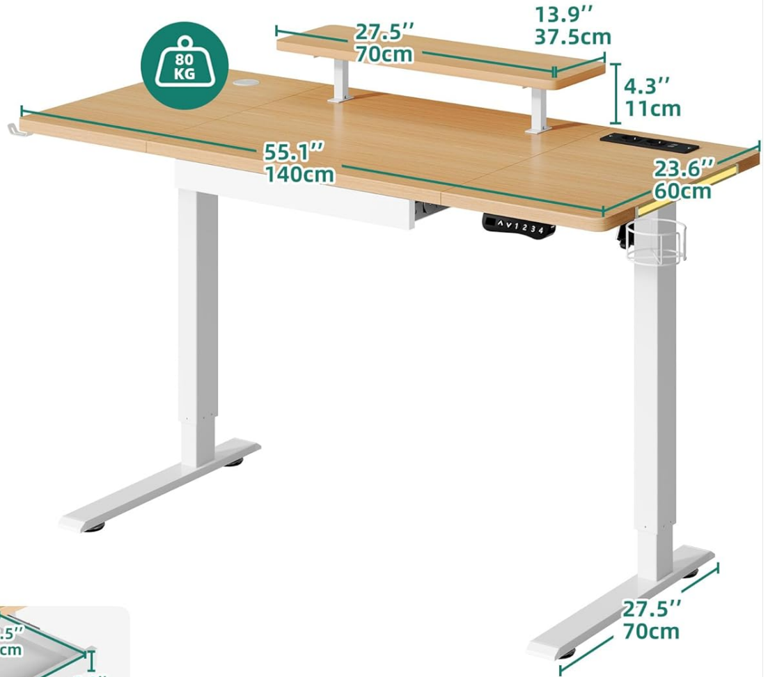
Image: Detailed diagram showing the product dimensions, height range (72-120cm), maximum load (80kg), low noise operation (<50dB), lifting speed (25mm/s), and drawer dimensions.