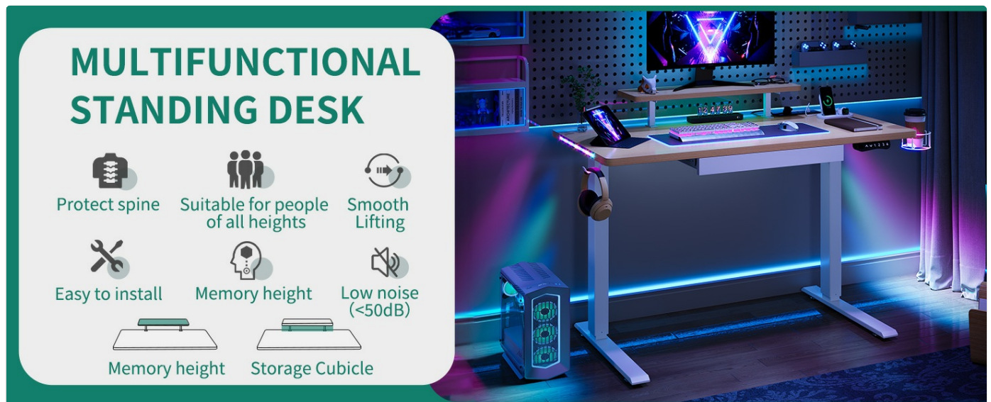
Image: Overview of the YITAHOME Electric Standing Desk highlighting its multifunctional design, including spine protection, suitability for all heights, smooth lifting, easy installation, memory height function, low noise operation, and storage cubicle.

Thank you for choosing the YITAHOME Electric Standing Desk. This desk is designed to enhance your workspace with its height-adjustable features, integrated charging station, LED lighting, and smart control panel. This manual provides essential information for assembly, operation, maintenance, and troubleshooting to ensure a safe and optimal user experience.