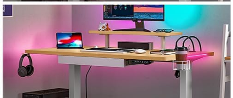
Image: Detailed view of the built-in charging station on the desk, featuring two AC outlets and two USB ports, with a power cord extending from it.