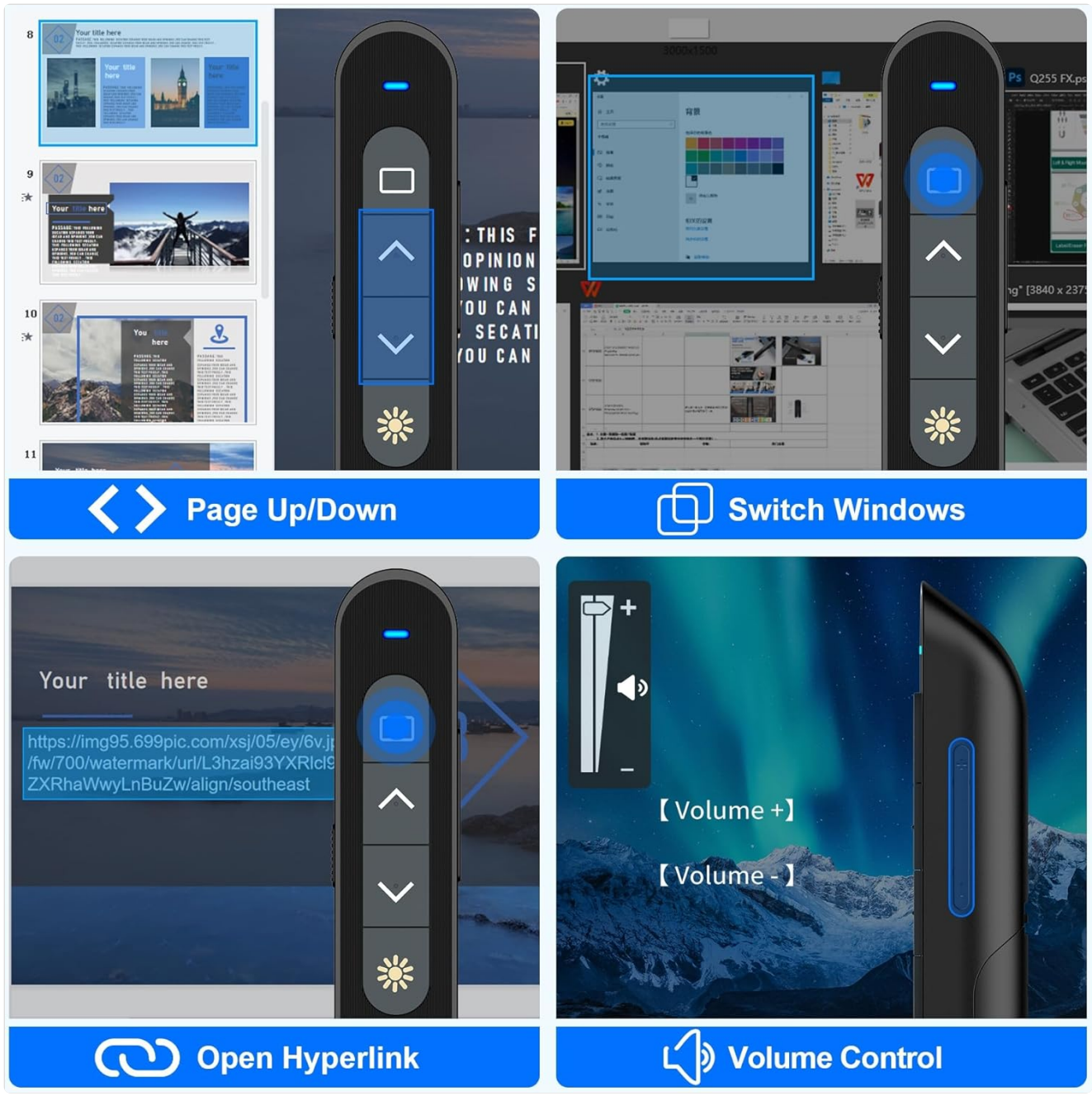
Image: Four panels demonstrating the presenter's functions: Page Up/Down for slide navigation, Switch Windows for multitasking, Open Hyperlink for interactive presentations, and Volume Control for audio management.