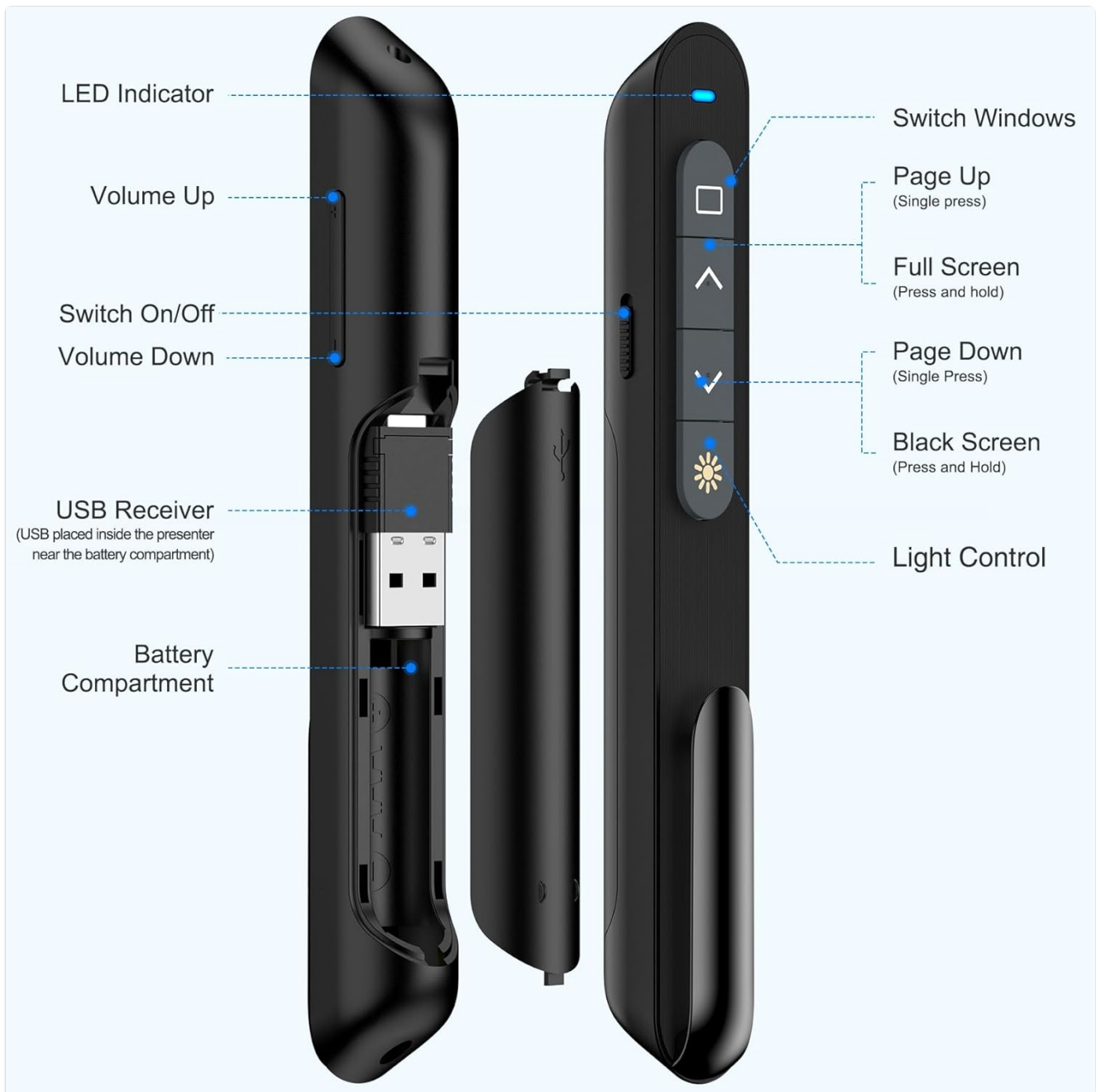
Image: A detailed diagram illustrating the various buttons on the DinoFire Wireless Presenter, including the LED indicator, volume controls, power switch, USB receiver storage, battery compartment, and presentation control buttons (Switch Windows, Page Up/Down, Full Screen, Black Screen, Light Control).