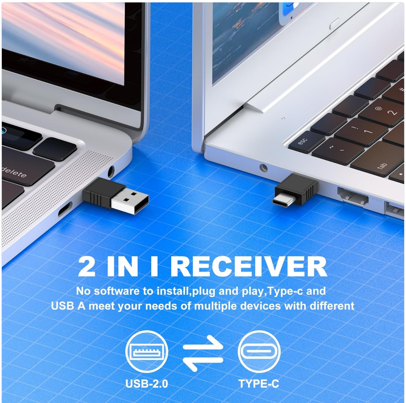
Image: A close-up view of the 2-in-1 USB receiver, demonstrating its compatibility with both USB-A and USB-C ports on different laptops.