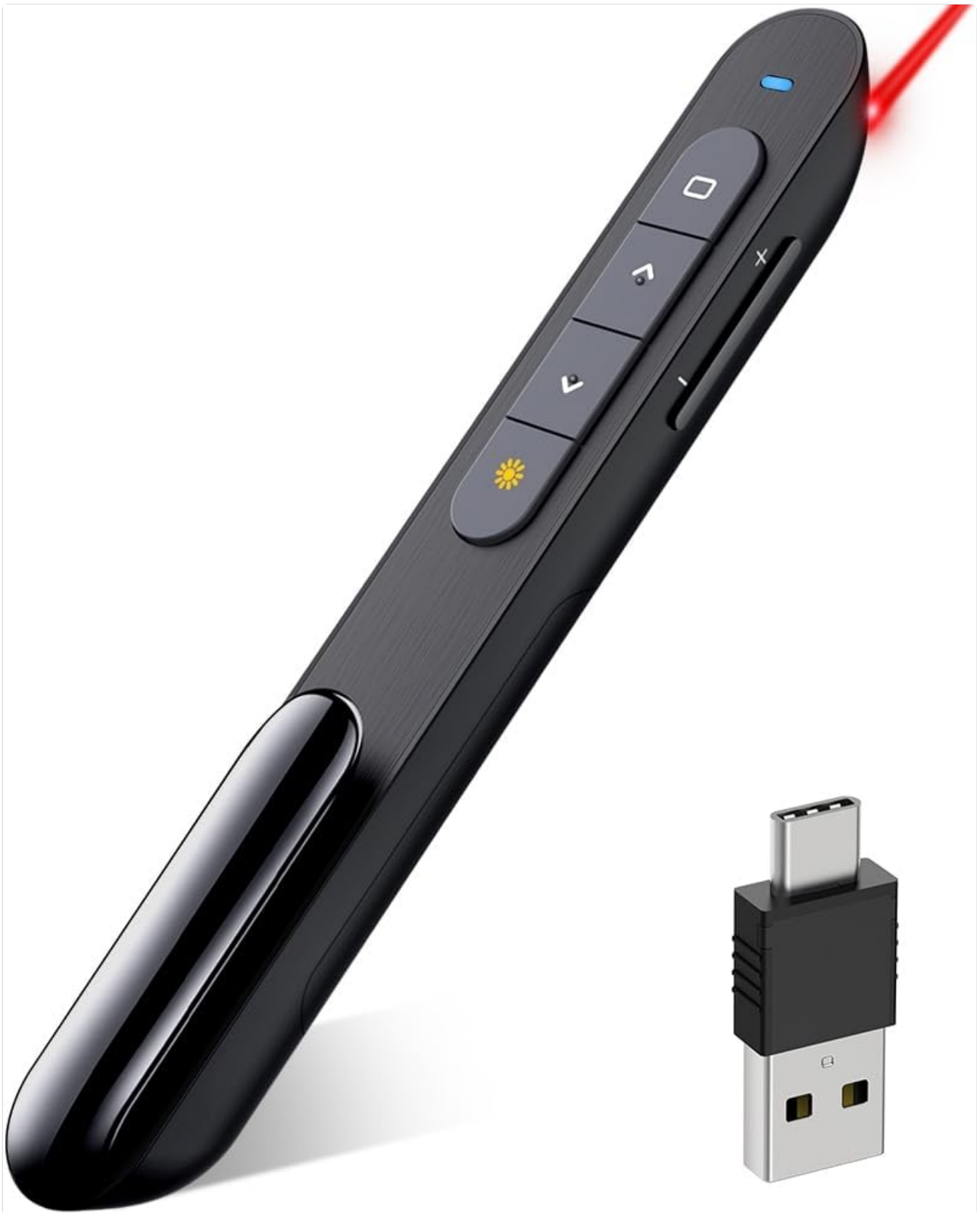
Image: The DinoFire Wireless Presenter, a sleek black device with control buttons and a red laser pointer, shown alongside its dual USB-A and USB-C receiver.