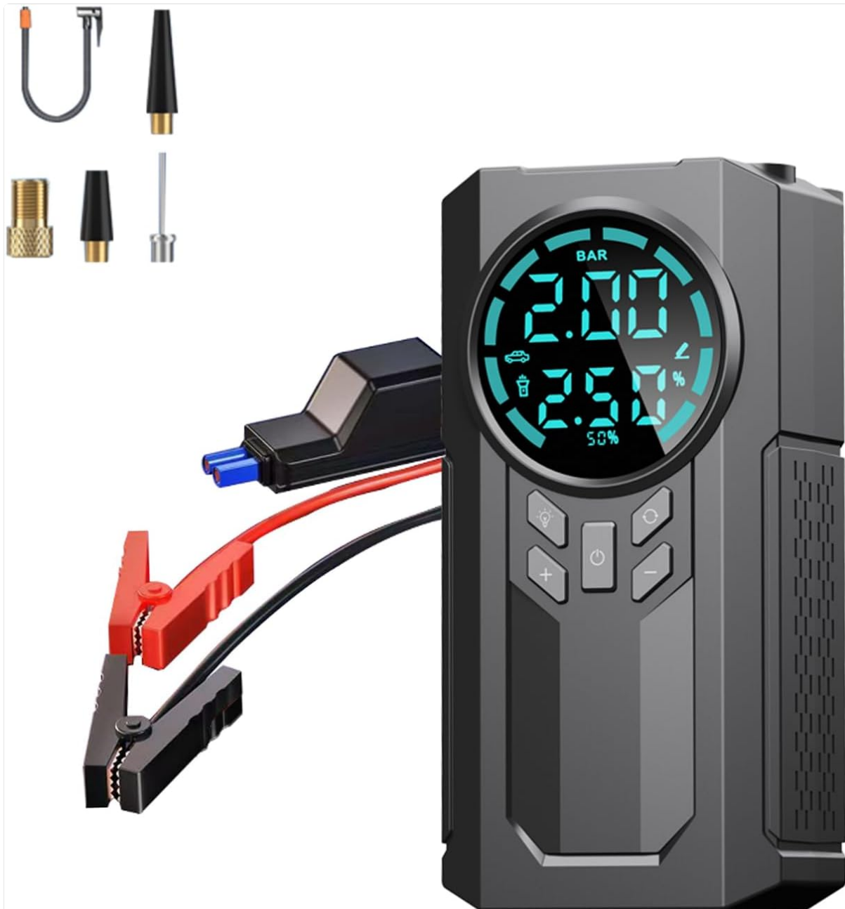
Image: The main unit displaying its LCD screen and control interface, with jumper cables and various air nozzles visible.