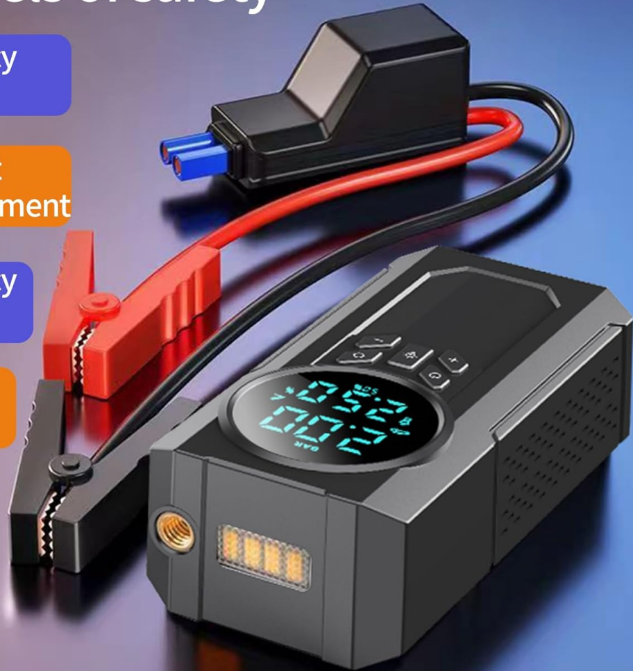
Image: Visual representation of the device's four primary functions: jump starting, intelligent inflation, emergency lighting, and mobile power bank capabilities.