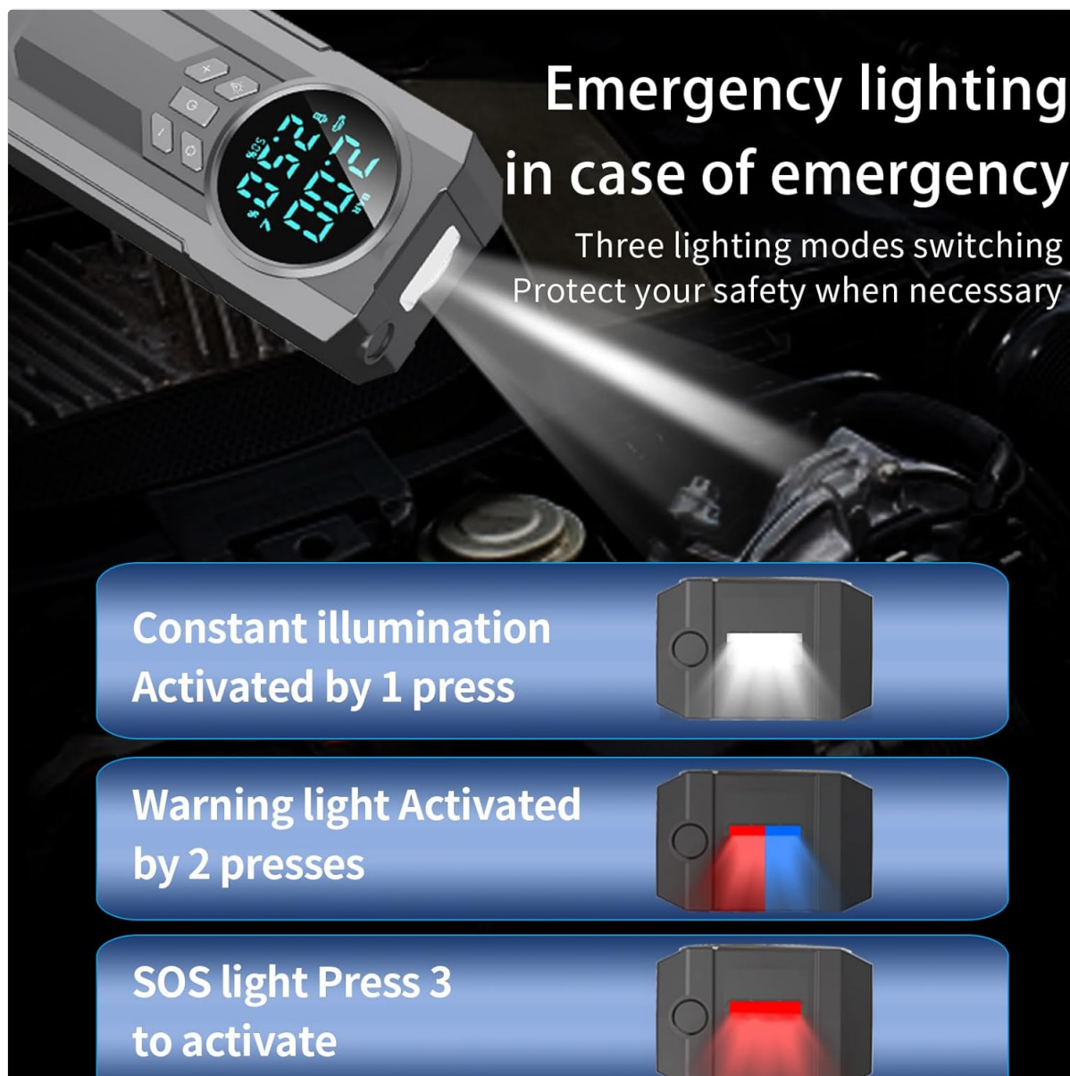
Image: Illustration of the three distinct lighting modes available for emergency situations: constant, flashing warning, and SOS.

Press the light button again to cycle through modes or turn off the light.