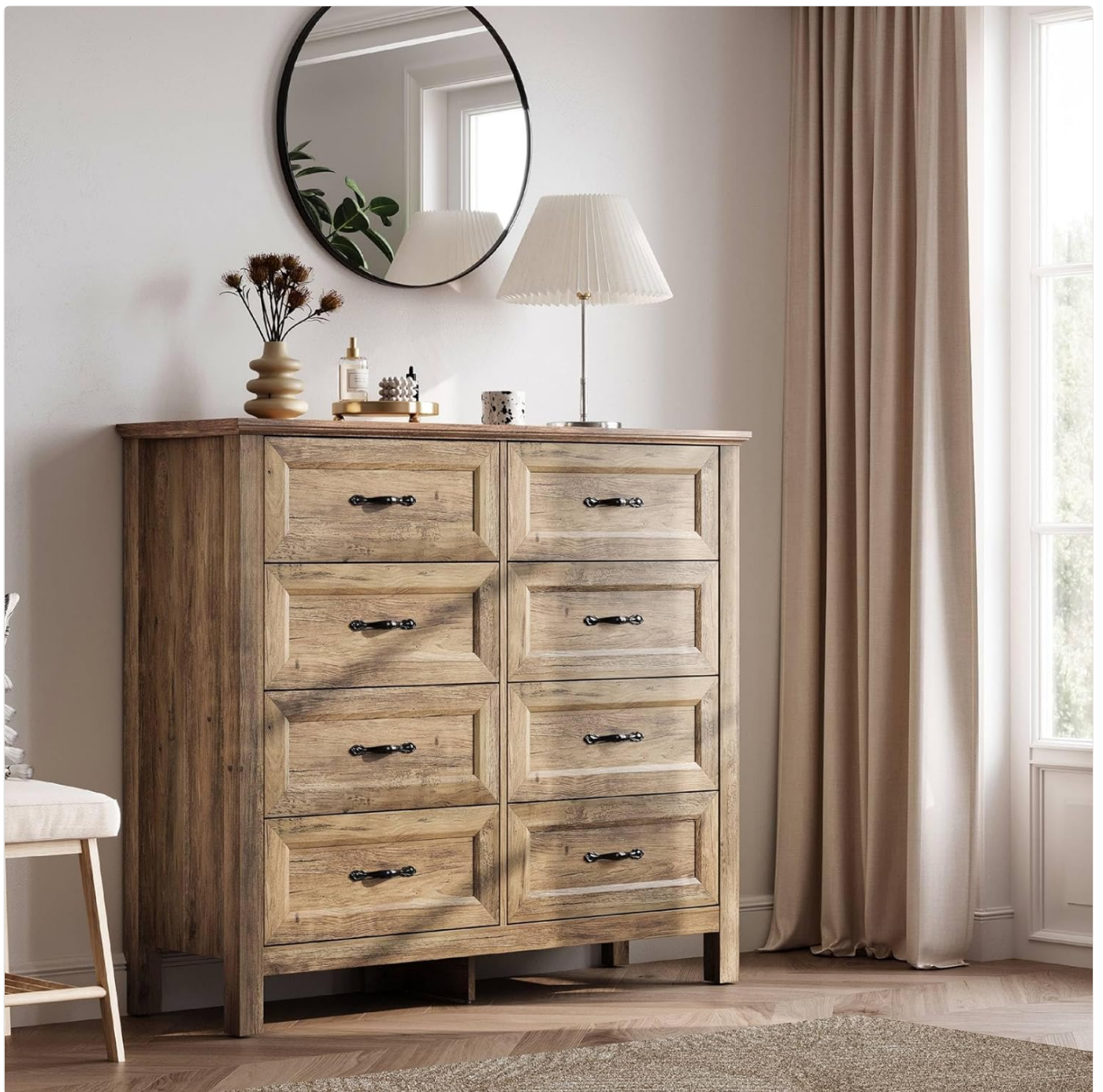
Figure 9.2: Dresser in a bedroom setting.