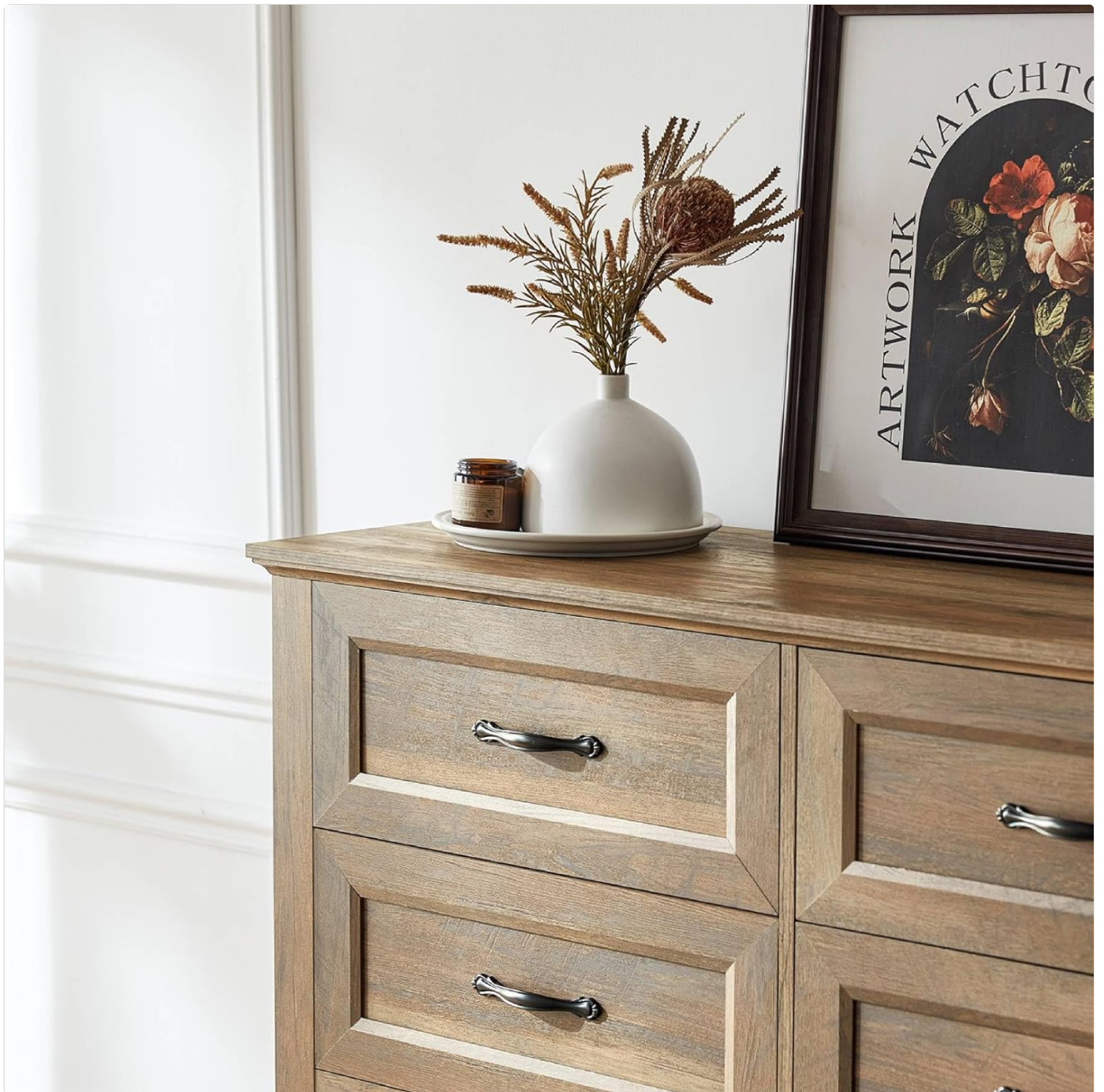
Figure 9.5: Detail of the dresser top and pulls.