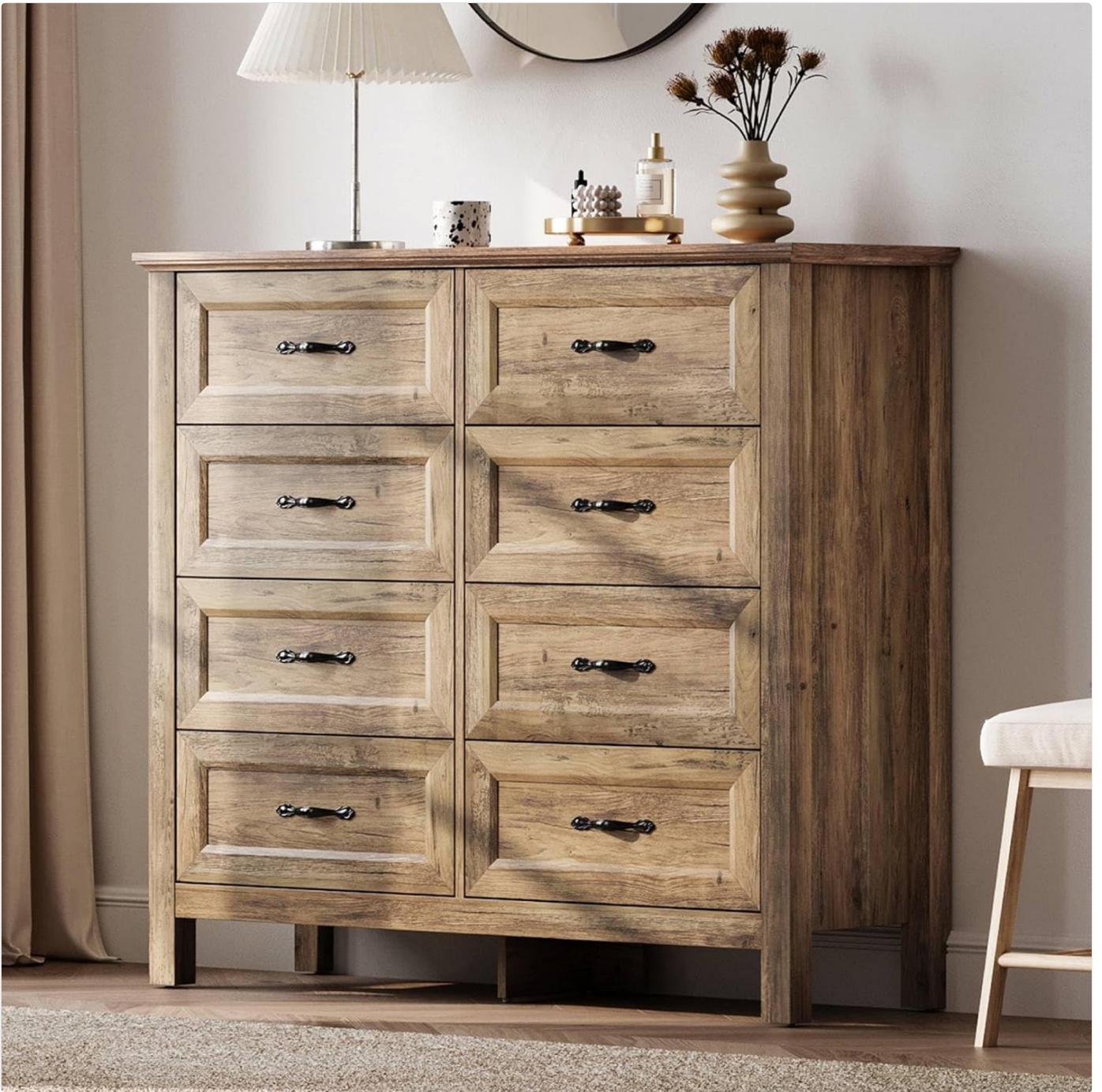
Figure 9.4: Dresser showcasing its style.