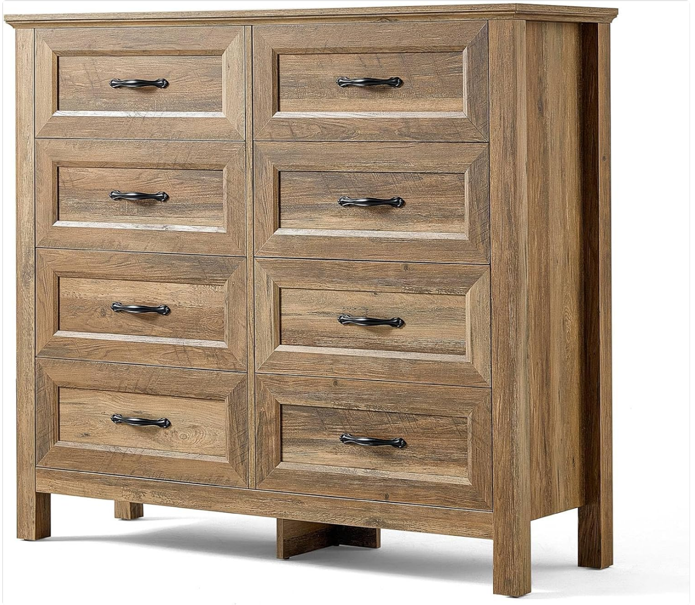
Figure 9.1: Front view of the dresser.