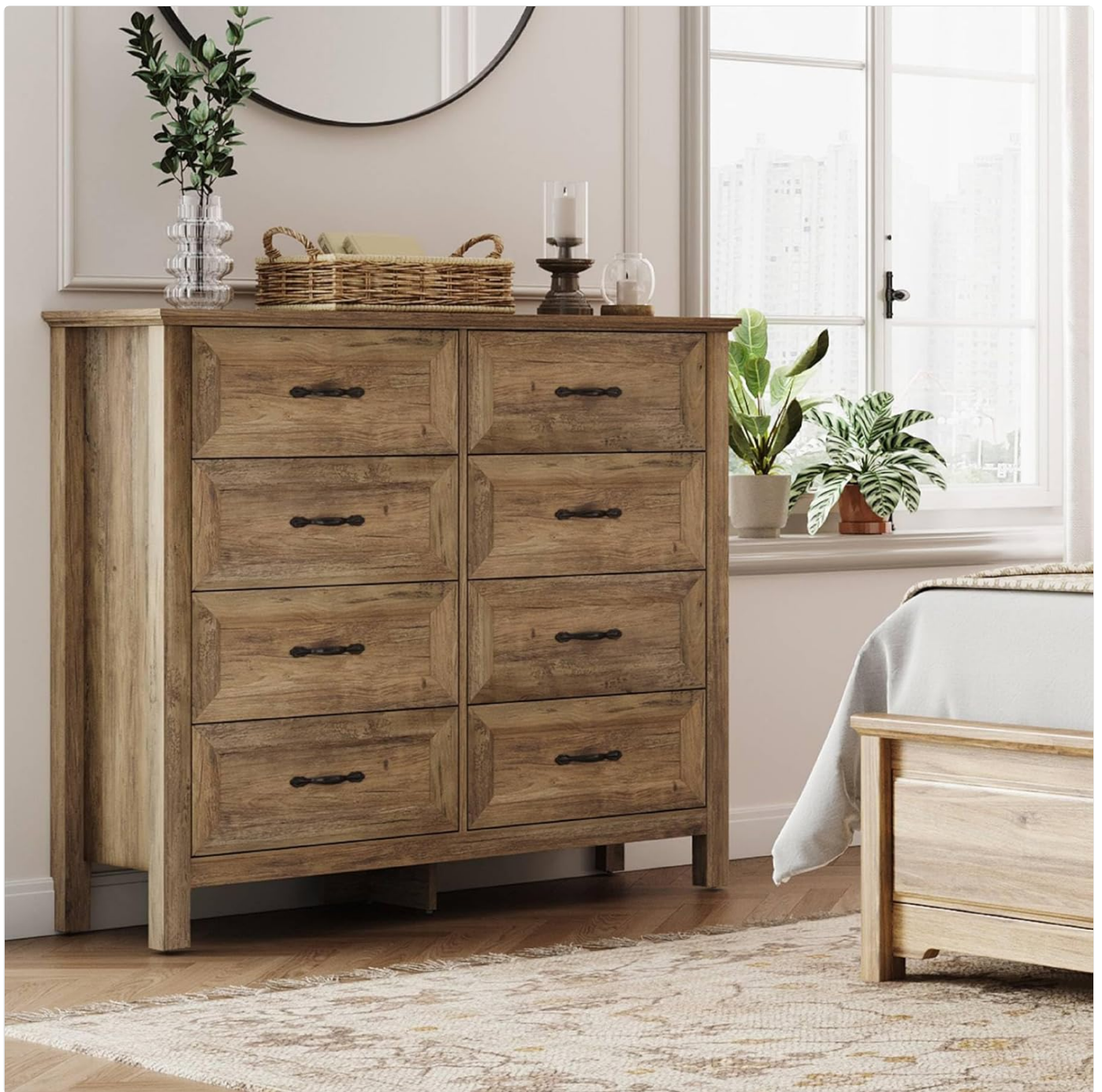
Figure 9.3: Dresser in a living room setting.