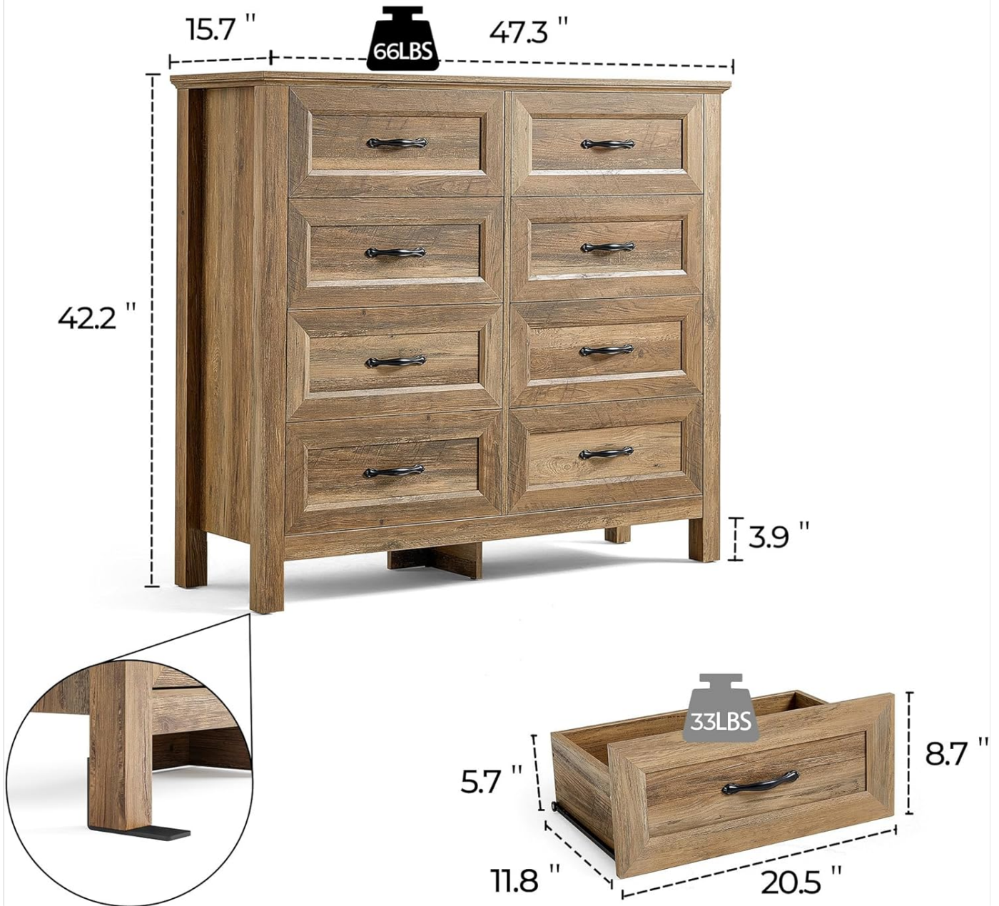
Figure 2.1: Product dimensions and individual drawer measurements.