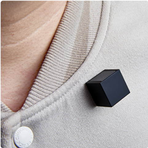
Image: Magnetic clip feature for secure attachment to clothing.