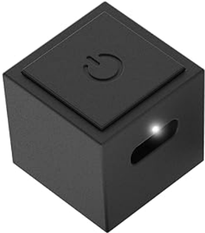
Image: Microphone with visible power button and LED indicator.