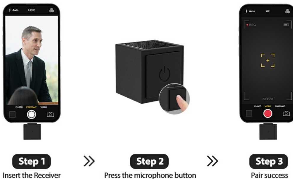
Image: Step-by-step setup guide for connecting the microphone system to a smartphone.