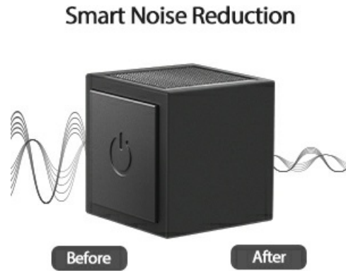
Image: Visual representation of noise reduction effectiveness.

Video: Demonstration of the microphone's sound quality and noise reduction capabilities.