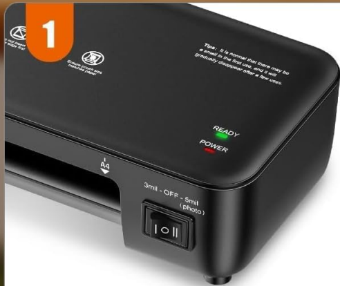
Prep the machine (Turn on then select 3 mil or 5 mil)