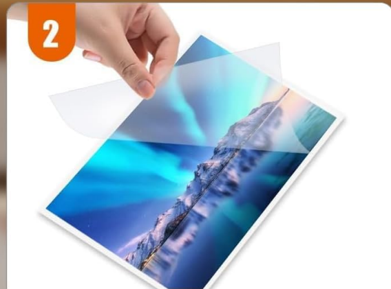
Place item in the pouch