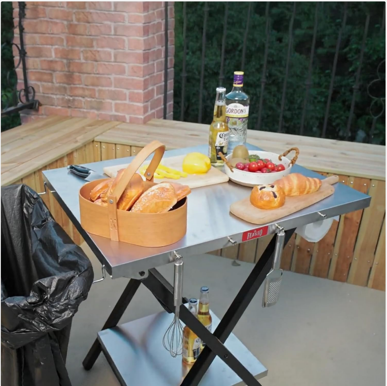
Figure 3.1: Utilizing the table as a convenient outdoor prep station.

Use the spacious stainless steel tabletop for food preparation, serving, or as an auxiliary surface during outdoor events. The integrated paper towel holder and trash bag holder enhance convenience during meal prep and cleanup.