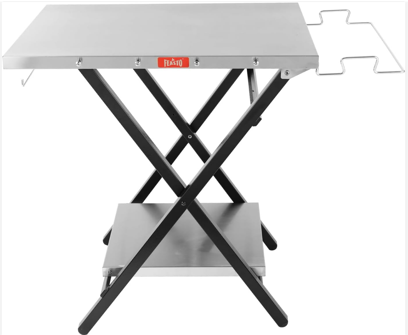
Figure 1.1: The Feasto FD2430S Outdoor Grill Table, ready for use.