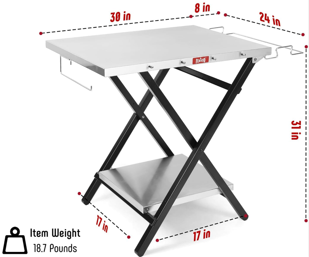
Figure 6.1: Key dimensions and weight of the Feasto Outdoor Grill Table.