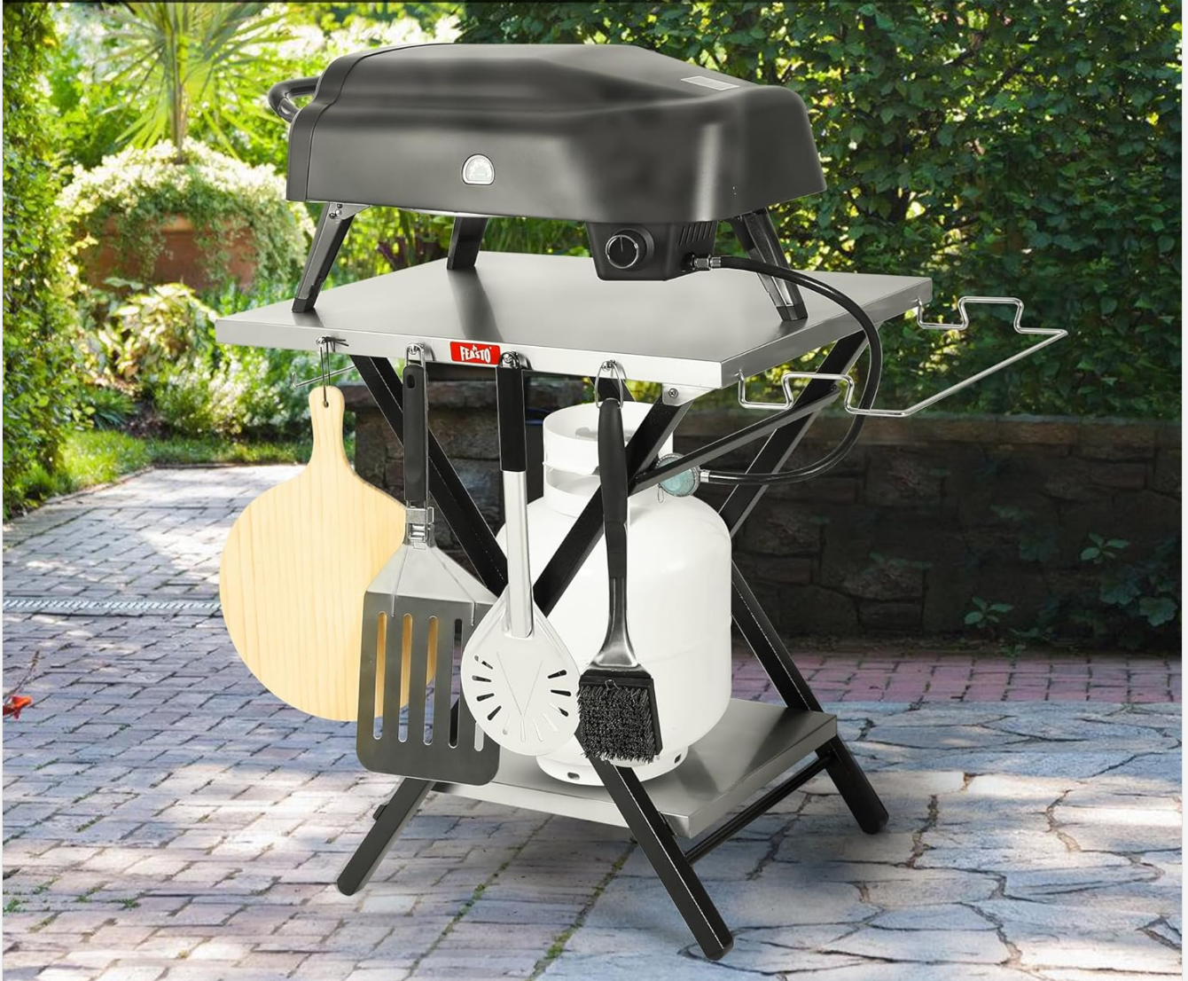
Figure 3.2: The table functions as a stable stand for a portable pizza oven.