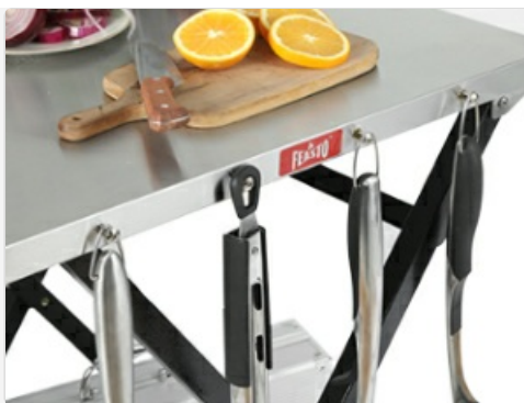
Figure 4.1: The stainless steel surface is easy to clean with a damp cloth.