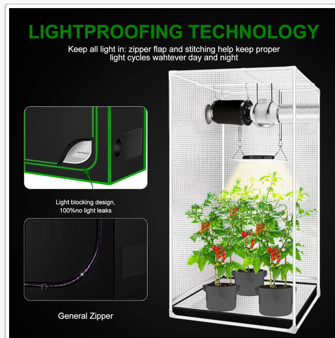
Figure 5.1: Internal setup of the grow tent, illustrating the light-blocking design and reflective interior. This image shows how lights and ventilation can be suspended from the support bars.