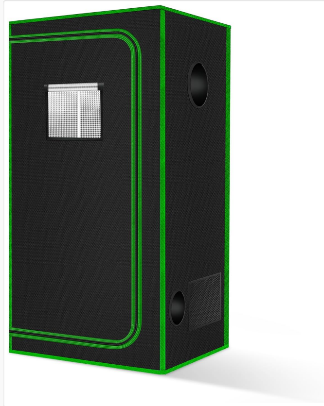
Figure 2.1: Overview of the MELONFARM 3x3 Grow Tent. This image displays the tent's exterior, highlighting its green trim, observation window, and ventilation ports.