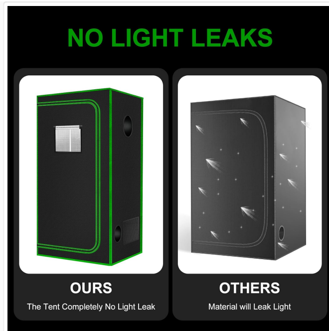
Figure 6.1: Visual comparison highlighting the superior light-proofing of the MELONFARM grow tent compared to other tents that may exhibit light leaks.