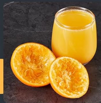
Figure 5.1: Demonstrating the juicing process with an orange.

This image shows a hand pressing down the lever to extract juice from an orange, illustrating the ergonomic design and ease of use.