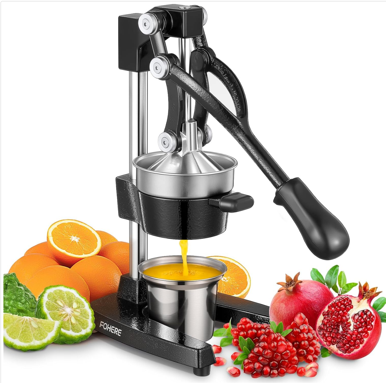
Figure 4.1: The FOHERE Manual Citrus Juicer fully assembled and ready for use.

This image displays the complete juicer unit, demonstrating its compact and sturdy design once assembled.