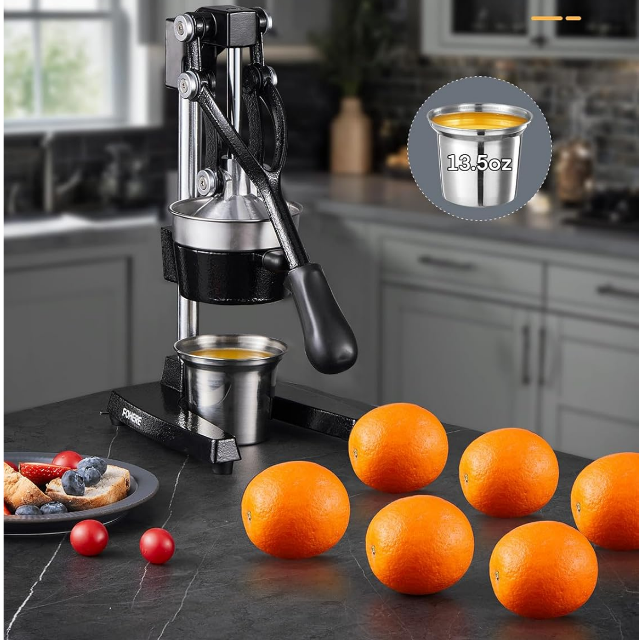
Figure 5.2: The labor-saving ergonomic lever in action.

This close-up highlights the ergonomic design of the lever, which is intended to reduce effort during the juicing process.