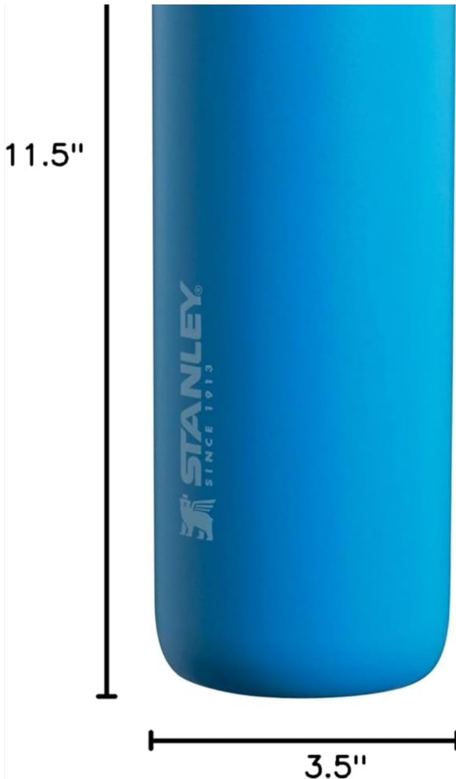
Image 6.1: Detailed dimensions of the Stanley Quick Flip GO Water Bottle.