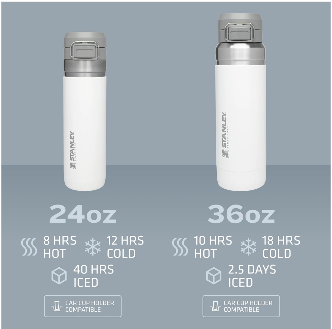
Image 1.2: Visual representation of the bottle's key features, including material, insulation, and lid design.