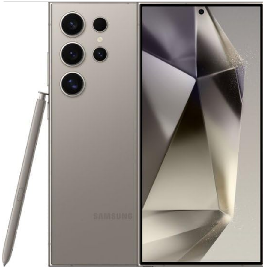
Figure 2.1: Samsung Galaxy S24 Ultra in Titanium Grey with its S Pen.