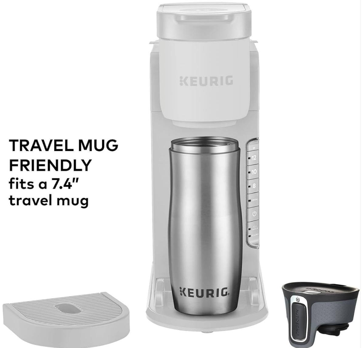
Image: The Keurig K-Express coffee maker with its drip tray removed, demonstrating how it can accommodate a tall travel mug for brewing on the go.

TRAVEL MUG FRIENDLY fits a 7.4" travel mug