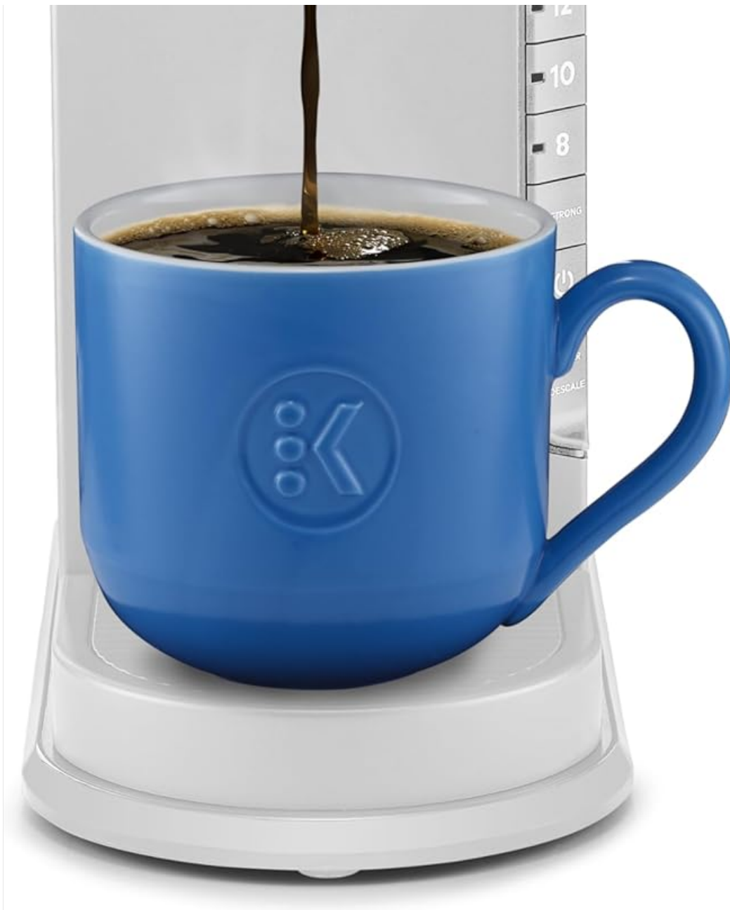
Image: The Keurig K-Express Coffee Maker in Warm Stone color, actively brewing coffee into a blue mug. The machine features a sleek, compact design.