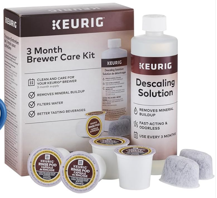
Image: The Keurig K-Express coffee maker shown alongside a Keurig 3 Month Brewer Care Kit, which includes descaling solution and water filters, indicating compatibility for maintenance.

You will need: A large ceramic mug (min. 10 oz), fresh water, and Keurig Descaling Solution (recommended).