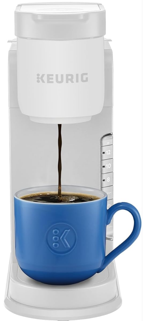
Image: A visual representation of the Keurig K-Express's key features, highlighting the three available cup sizes (8, 10, 12 oz), the strong brew option, and the 42 oz removable water reservoir.