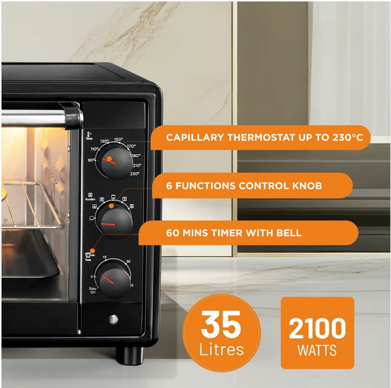
Image: Close-up of the Glen OTG control panel, showing the temperature, function, and timer knobs.