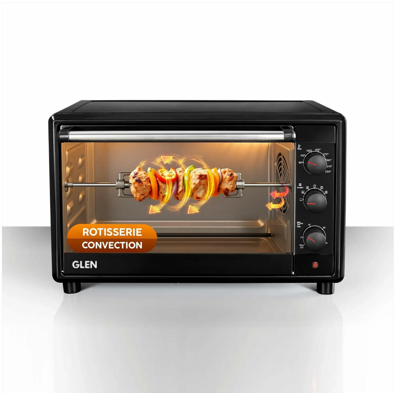
Image: The Glen OTG with a chicken rotating on the motorized rotisserie, illustrating the even cooking process.