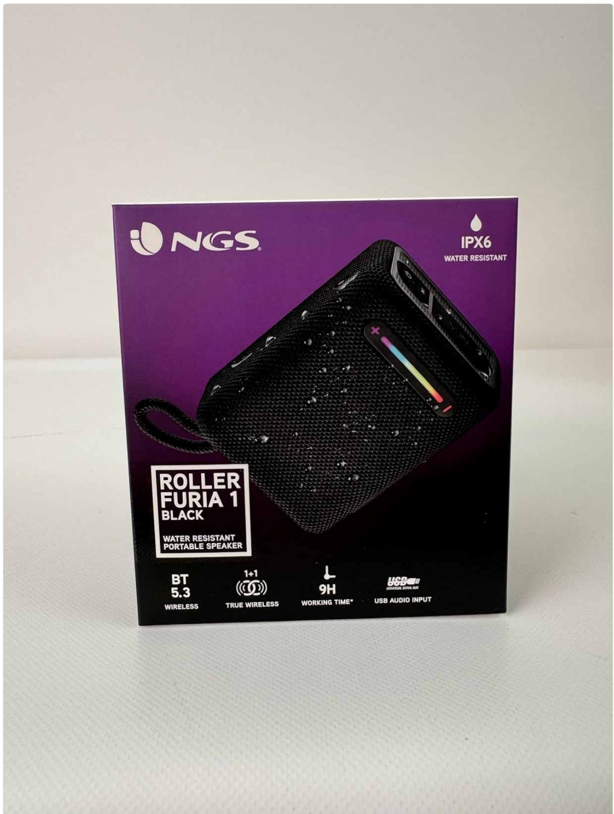
Image: Front view of the NGS Roller Fury 1 Black portable Bluetooth speaker, showcasing its compact design and textured finish.