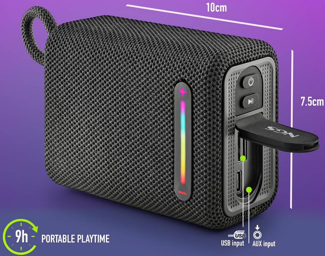
Image: The NGS Roller Fury 1 speaker displaying its compact dimensions (10cm length, 7.5cm height) and indicating the USB input and AUX input ports. The RGB light strip is also visible on the side.