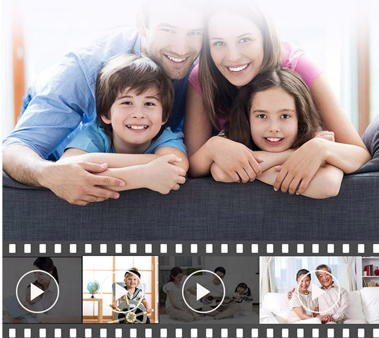
Image: A family watching video playback on a screen, illustrating the recording and playback feature of the camera.

Cover the previous video automatically if the storage card is full, no need make it Manually and support playback.