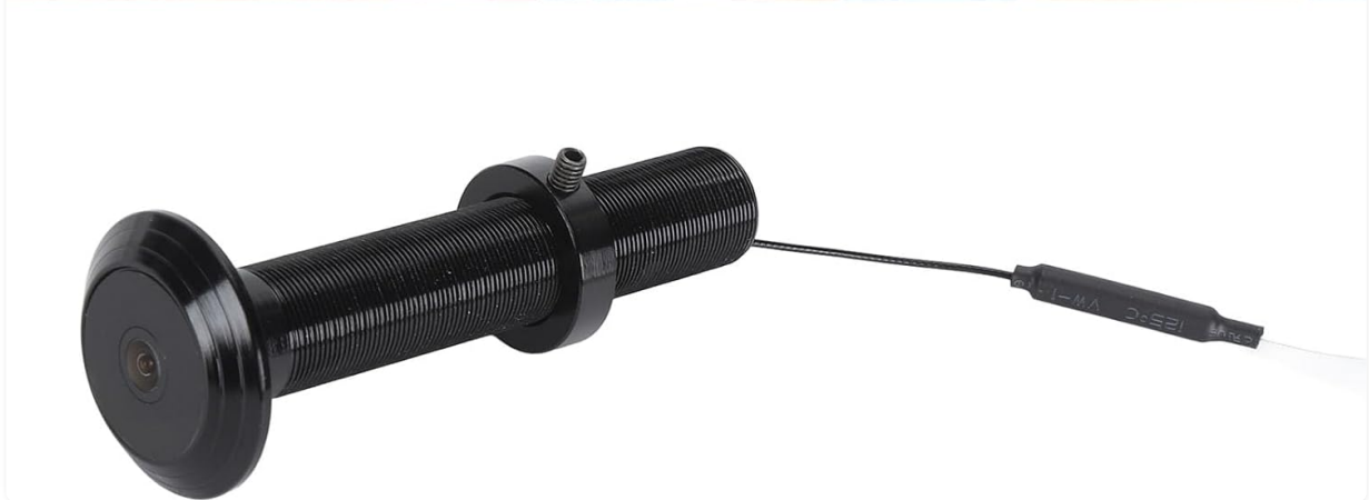
Image: The Yoidesu Door Peephole Camera installed on an exterior wall, demonstrating its placement.