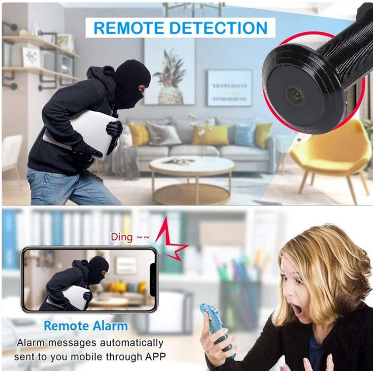
Image: An illustration showing remote detection of a person at the door and an alarm message being sent to a mobile phone via the app.

Open the Tuya app on your smartphone. Select your Yoidesu Door Peephole Camera from the device list to view live video feed from your doorstep anytime, anywhere.