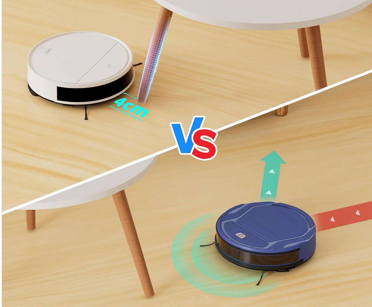
Figure 5: The robot vacuum demonstrates its ability to intelligently avoid obstacles, such as table legs, by detecting them and altering its path. This prevents collisions and ensures smooth operation.

The robot vacuum would not hit the furniture anymore, it will avoid while detect obstacle.