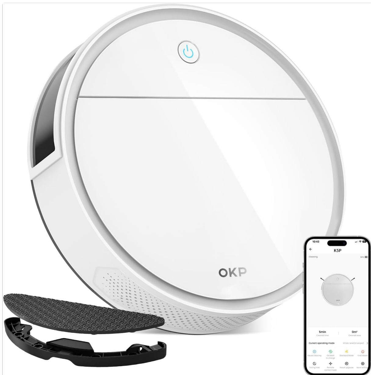
Figure 1: OKP Life K5P Pro Robot Vacuum and Mop. This image displays the main robot unit, a mop pad holder, and a smartphone showing the control app interface.