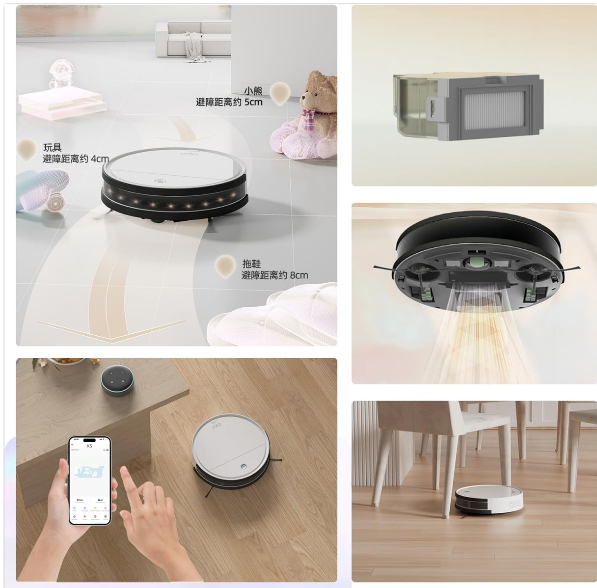
Figure 7: A hand demonstrates how to remove the dustbin from the robot vacuum and open it to dispose of collected debris. The HEPA filter is visible inside the dustbin.