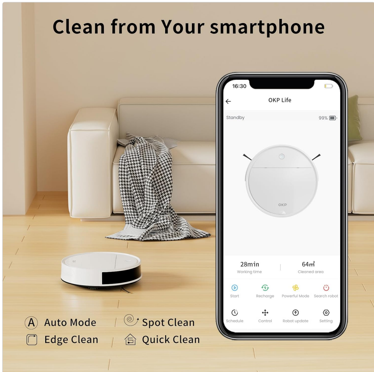
Figure 4: The smartphone app interface showing various cleaning modes: Auto Mode, Spot Clean, Edge Clean, and Quick Clean. The robot is visible on a wooden floor in the background.