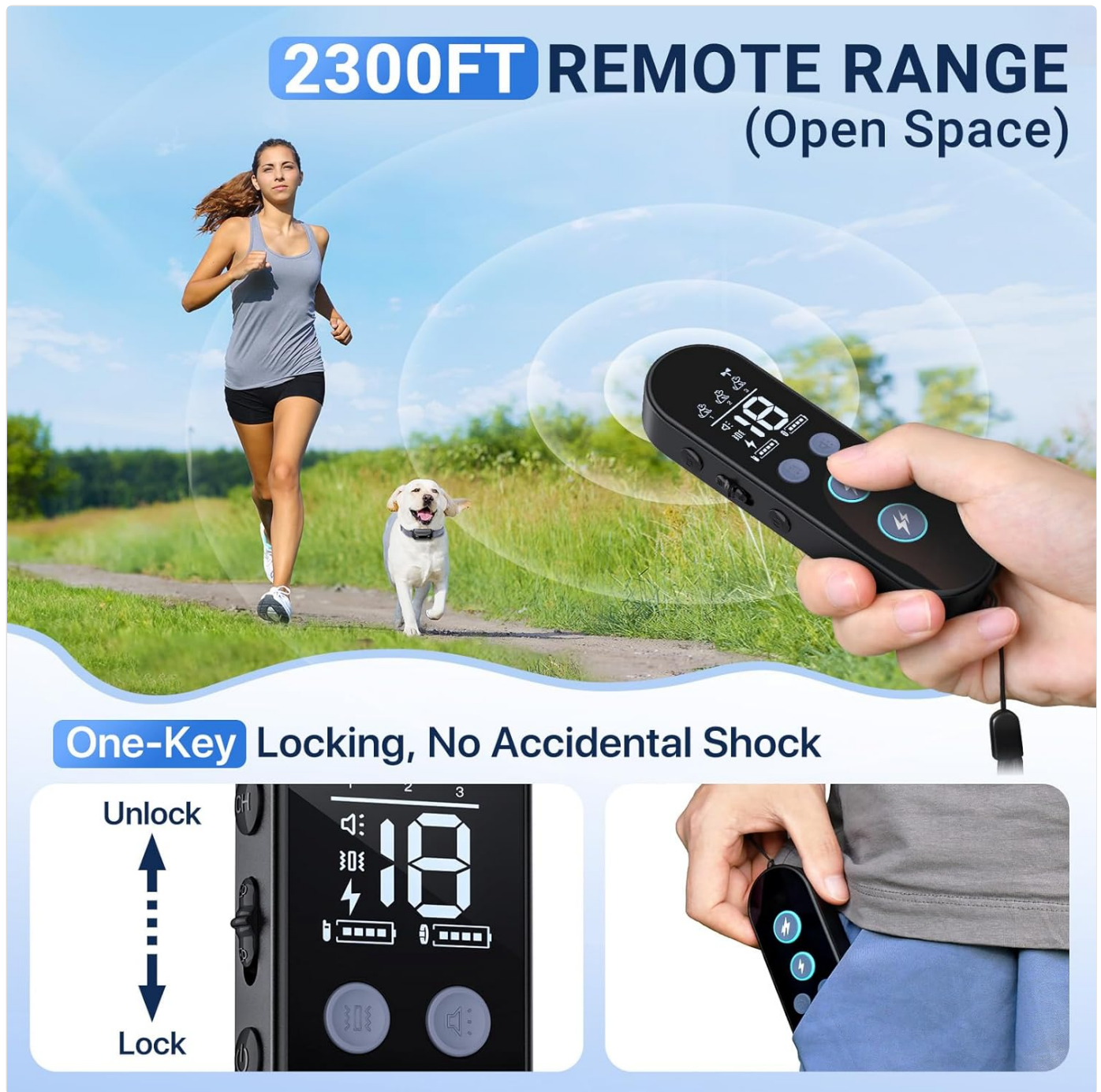
Image: A person using the remote control with a dog in the background, highlighting the 2300ft remote range and the one-key locking feature.