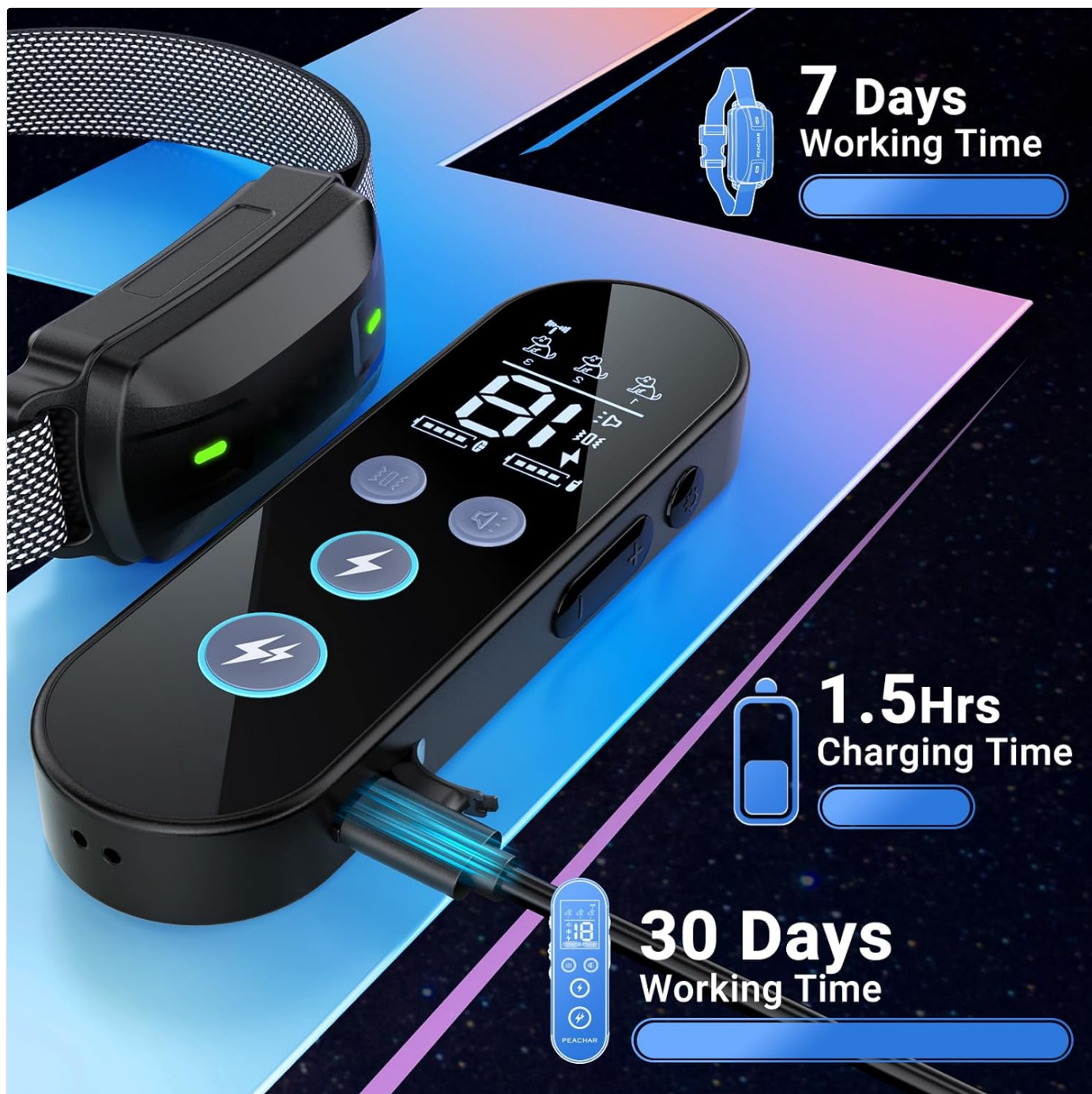
Image: The remote and collar connected to the USB charging cable, illustrating the charging process.