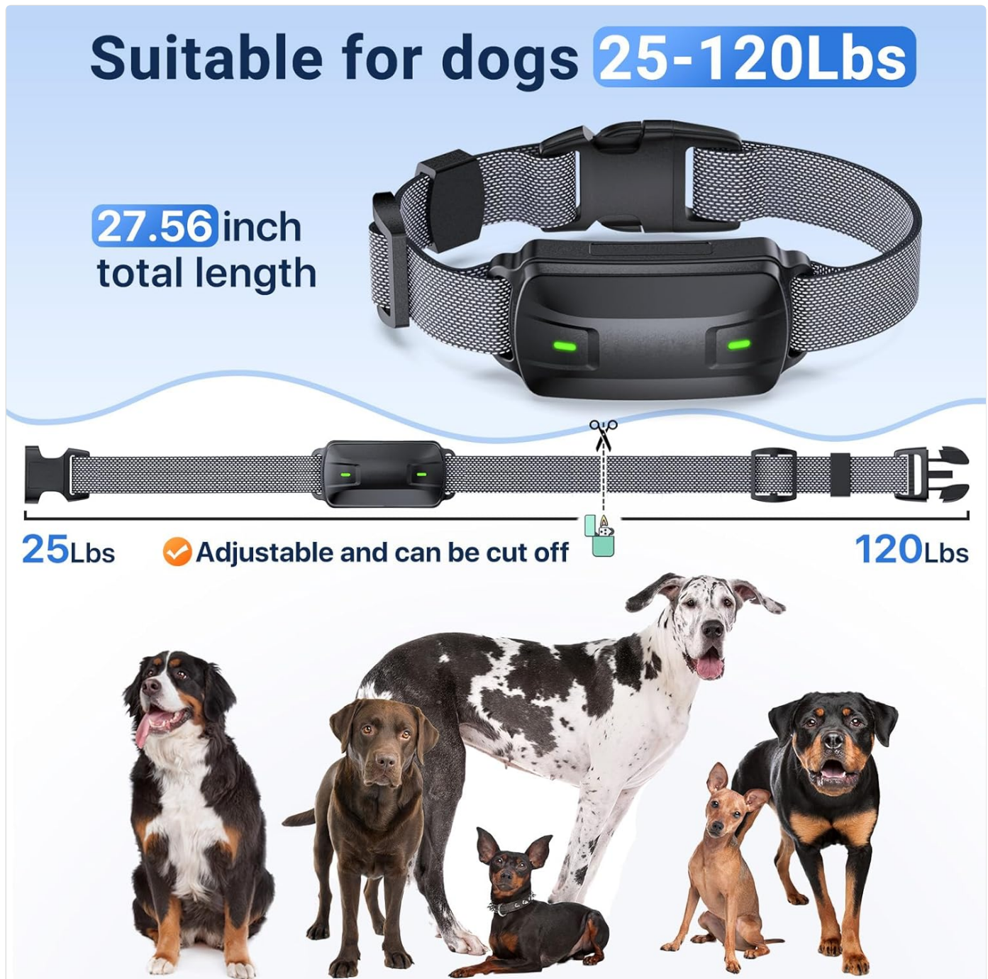
Image: The adjustable collar strap, demonstrating its suitability for dogs from 25 lbs to 120 lbs, with a total length of 27.56 inches.