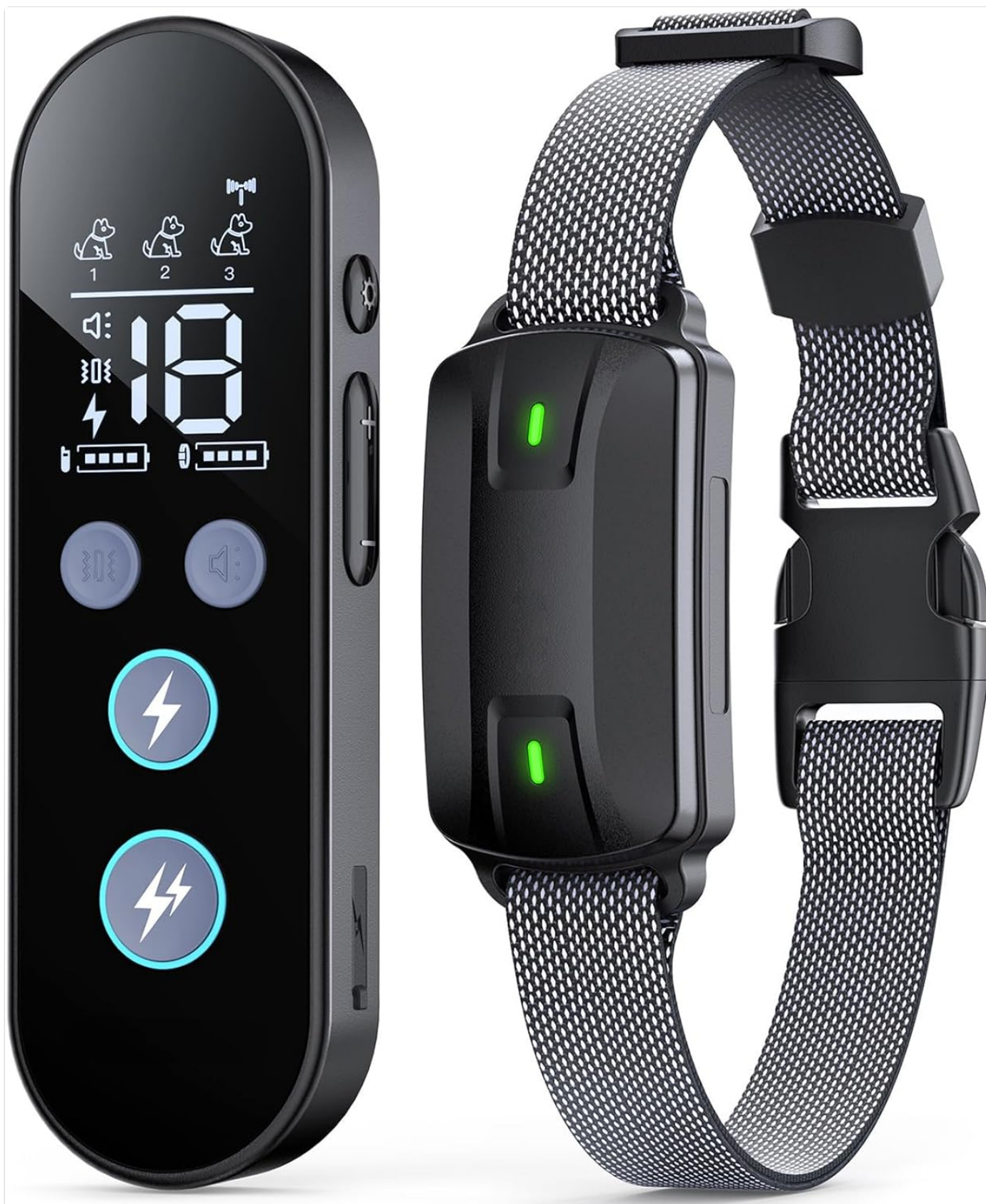
Image: The PEACHAR Dog Training Collar system, showing the remote transmitter and the receiver collar.