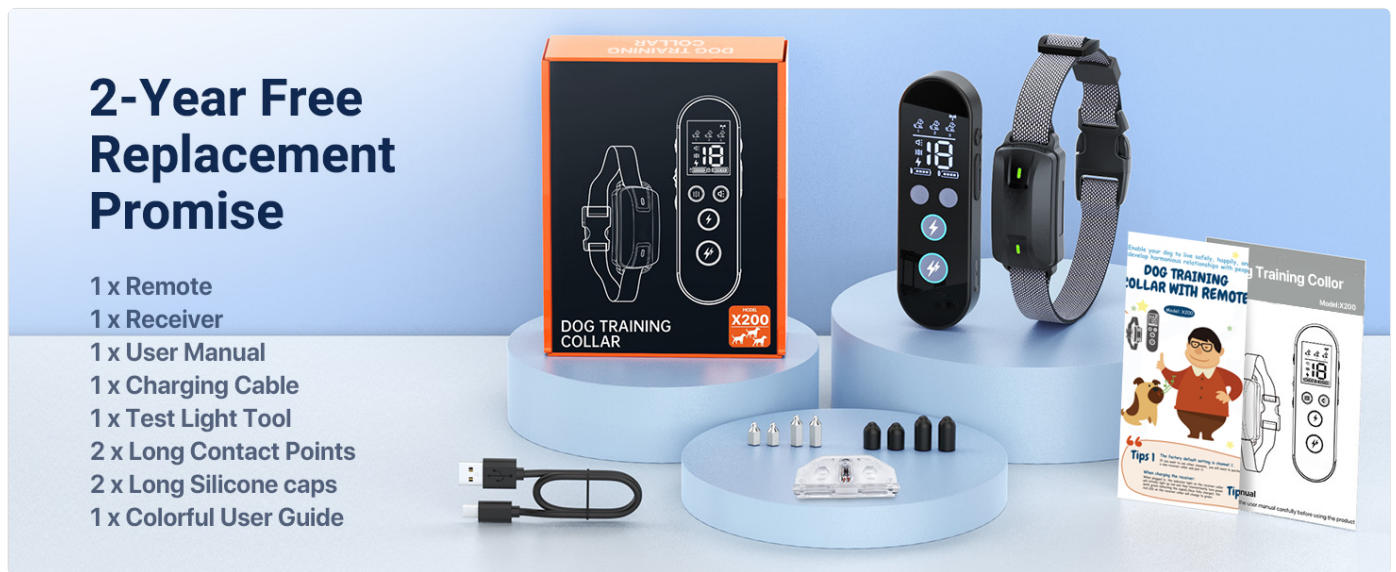
Image: A visual representation of all components included in the PEACHAR Dog Training Collar package.