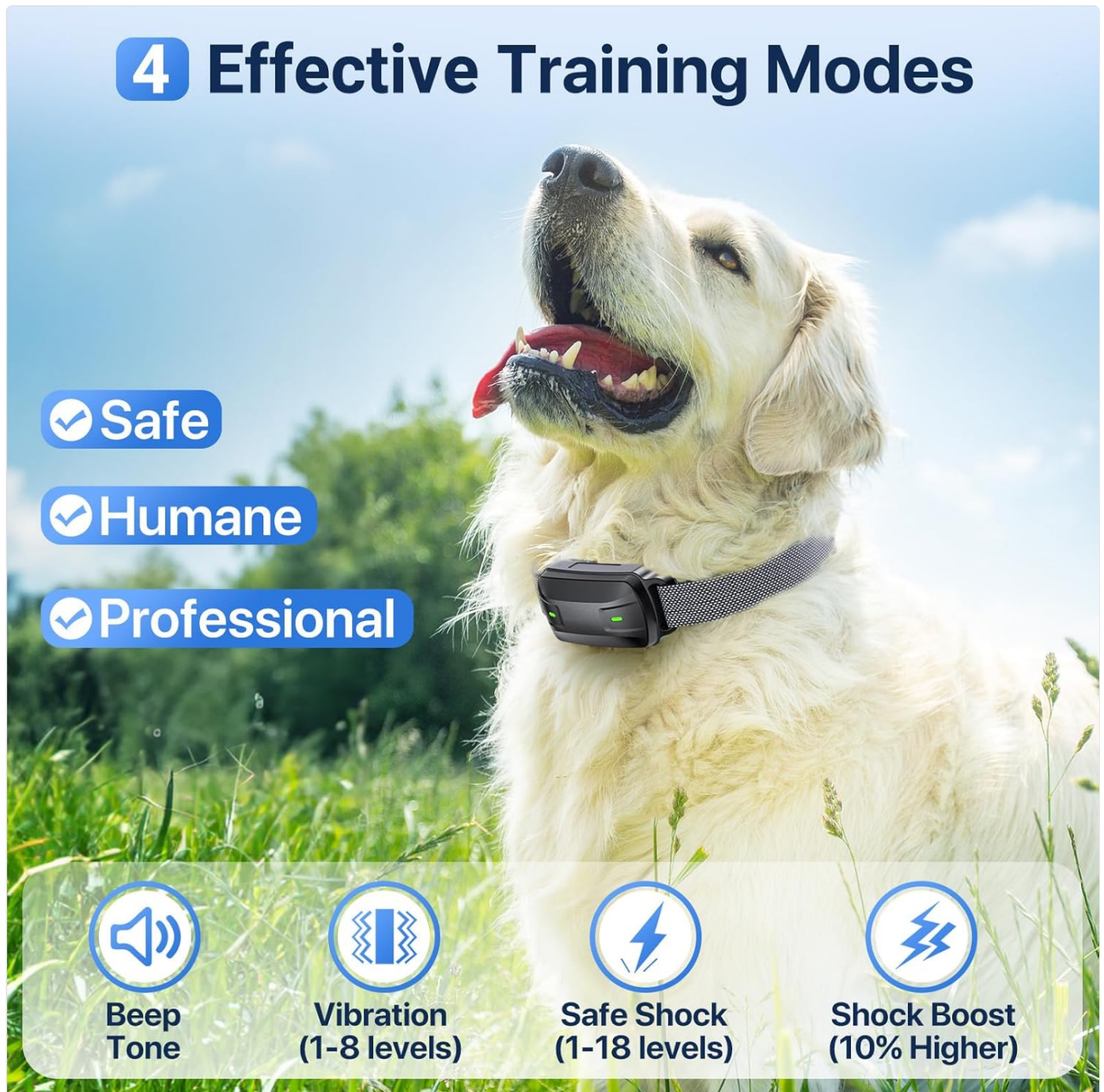
Image: Illustration of the four training modes: Beep Tone, Vibration (1-8 levels), Safe Shock (1-18 levels), and Shock Boost (10% higher).