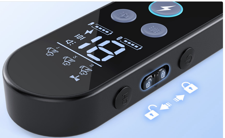
Image: A detailed view of the remote's security keypad lock, designed to prevent accidental button presses.

One-Key Locking to Prevent Accidental Opening