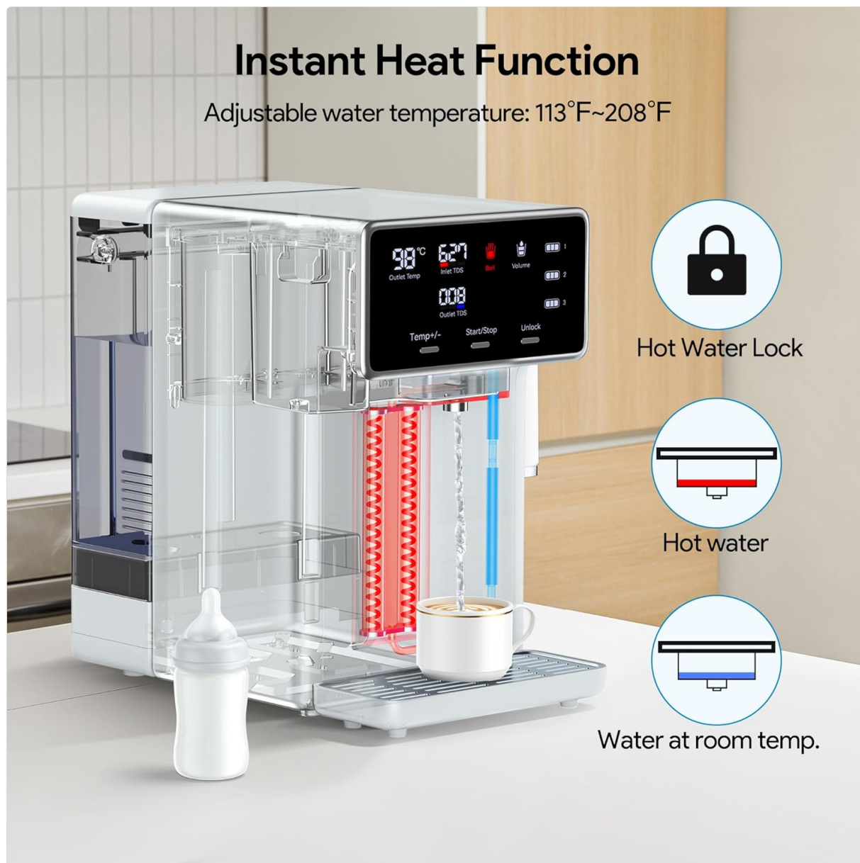
Figure 6: Diagram illustrating the instant heat function, showing options for hot water and room temperature water, along with the hot water lock feature.