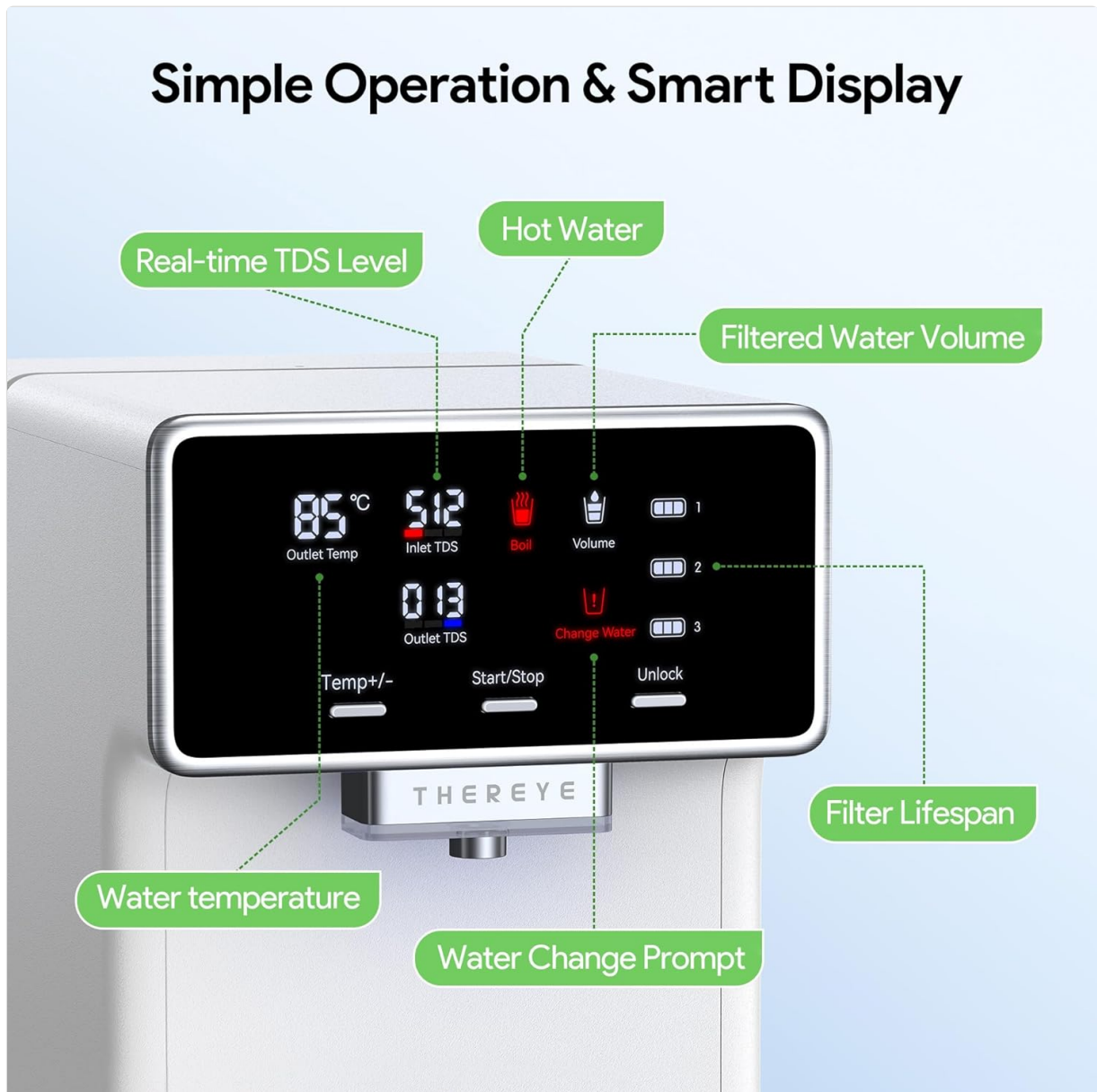
Figure 5: Close-up of the Smart LED Display, highlighting real-time TDS levels, water temperature, filtered water volume, and filter lifespan indicators.