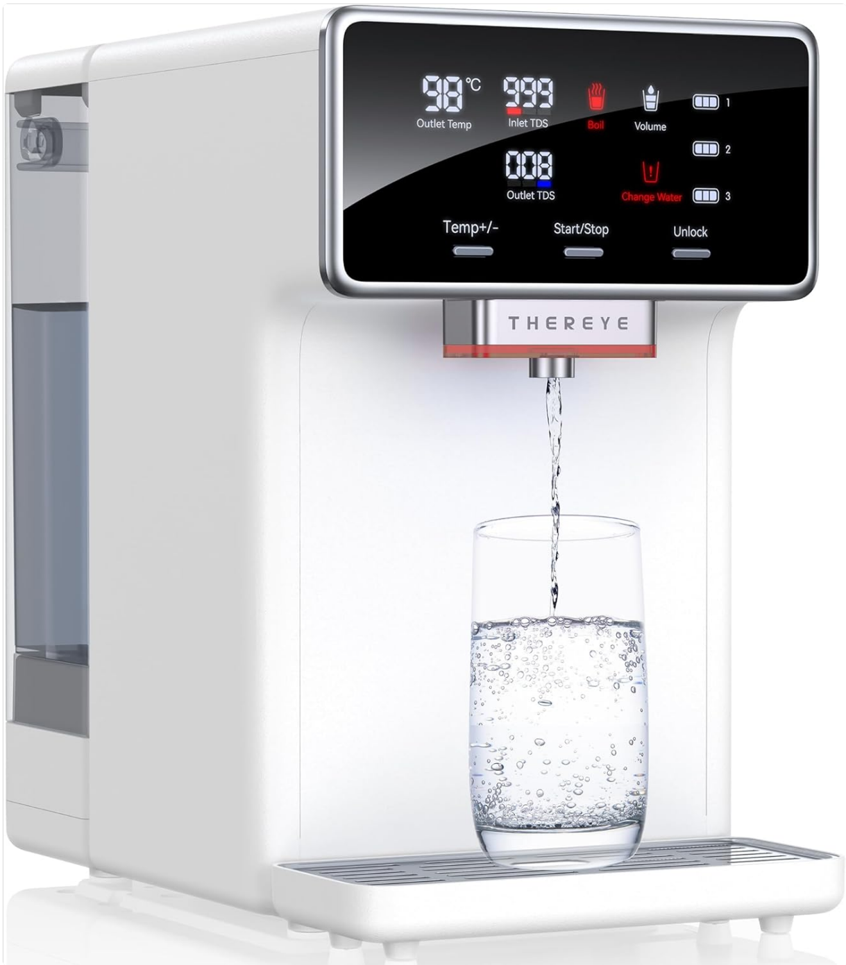
Figure 1: Thereye Countertop RO Water Filter System. This image shows the complete water filter unit with a glass of dispensed water, highlighting its sleek design and digital display.