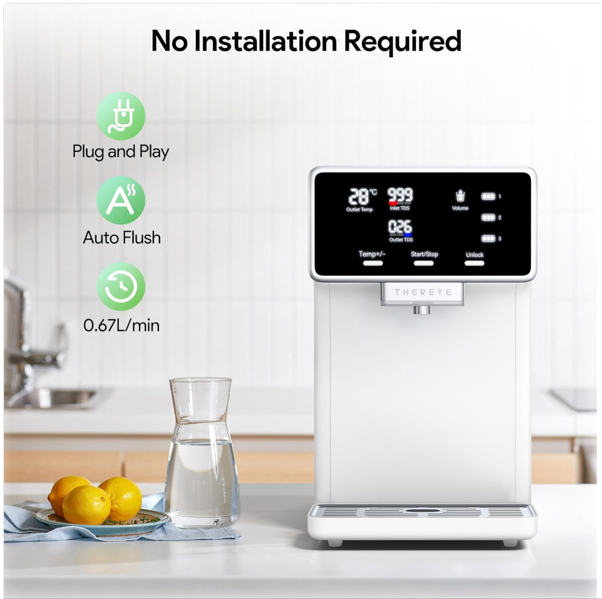
Figure 3: The "No Installation Required" feature of the water filter, showing it ready to use on a countertop.

flush out any manufacturing residue and ensure optimal filter performance. Discard the water from these initial cycles.