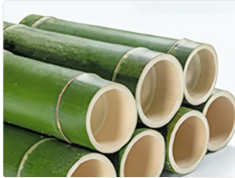
Image: Detail of the bamboo material, a primary component of the cabinet frame.