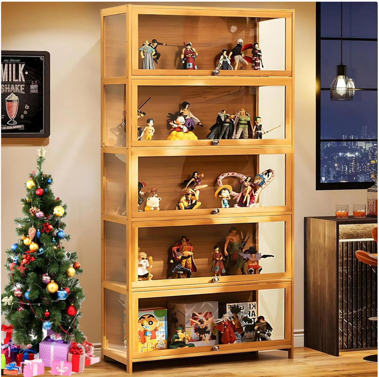
Image: Fully assembled idhco 5 Tier Curio Display Cabinet showcasing various collectibles.