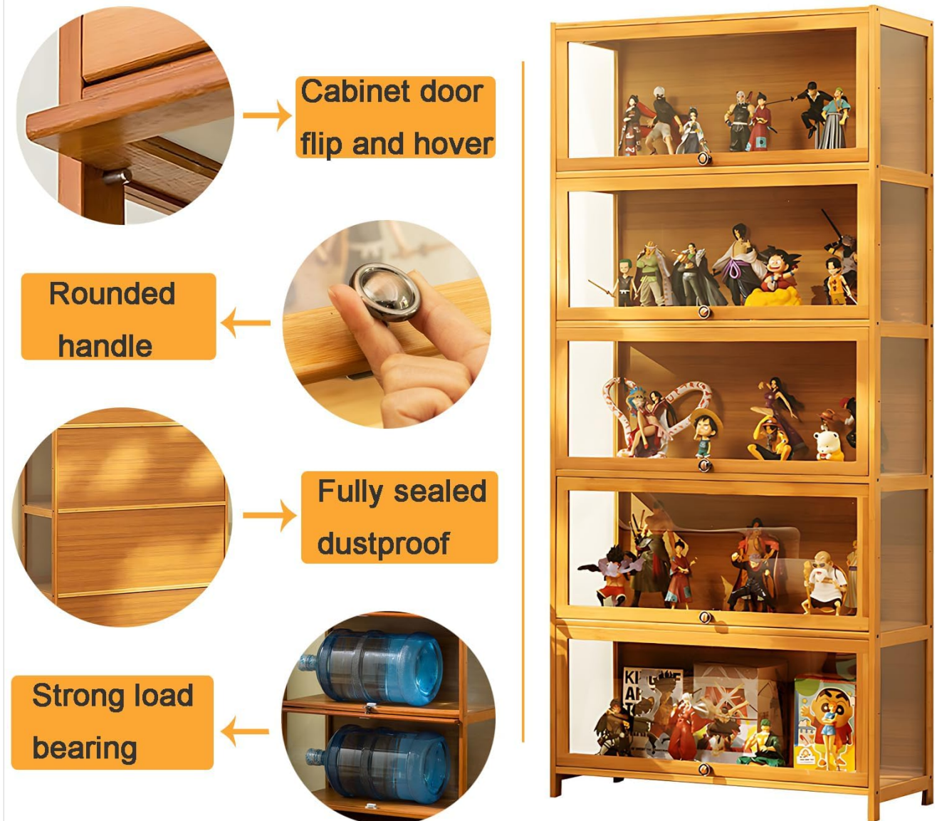
Image: Product details highlighting the flip-up door, rounded handle, dustproof design, and load-bearing strength.