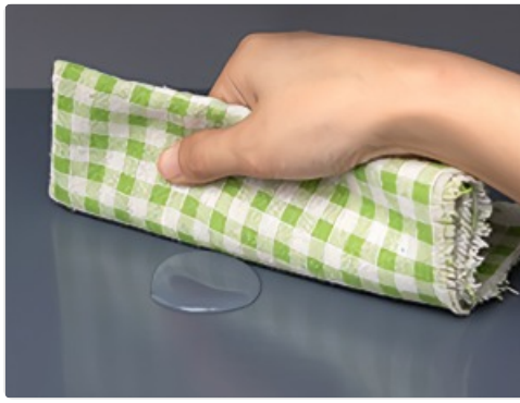
Image: Illustration of cleaning a surface with a soft cloth.