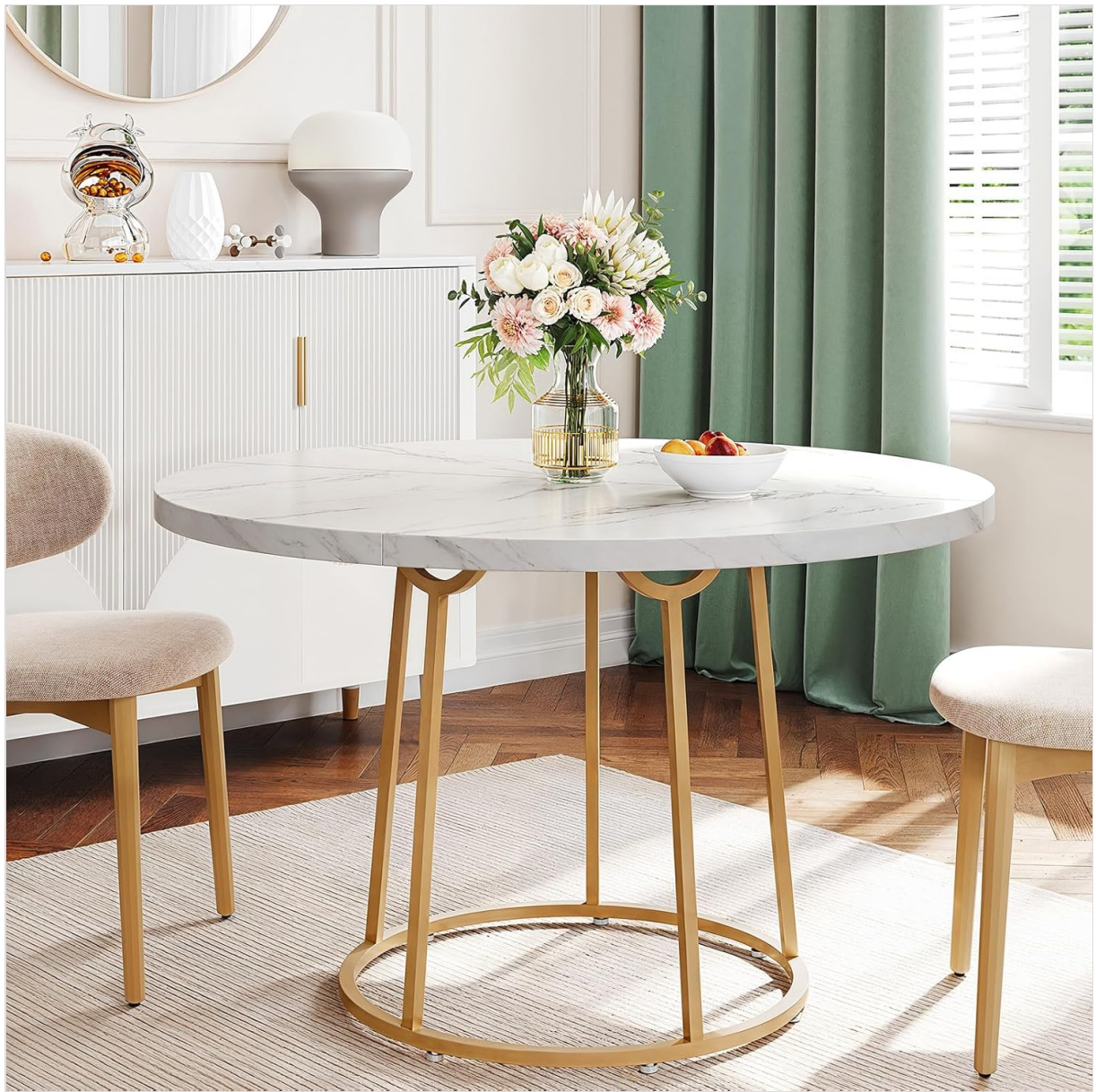
Image: The ONBRILL Round Dining Table, showcasing its use in a dining setting with place settings, a floral centerpiece, and a bowl of fruit.