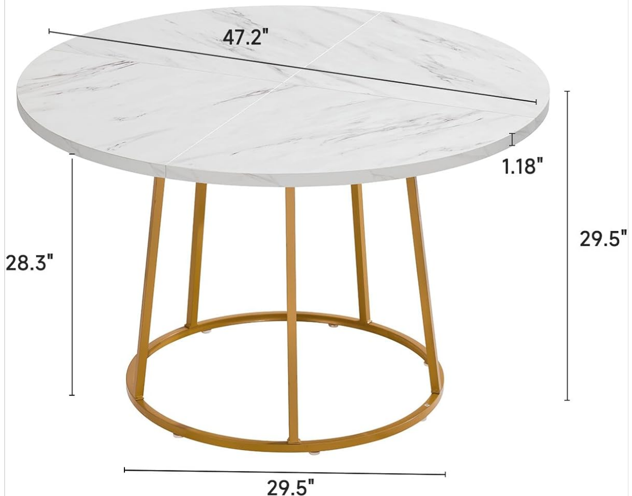
Image: A diagram illustrating the key dimensions of the ONBRILL Round Dining Table, including its 47.2-inch diameter and 29.5-inch height, along with seating capacity suggestions.