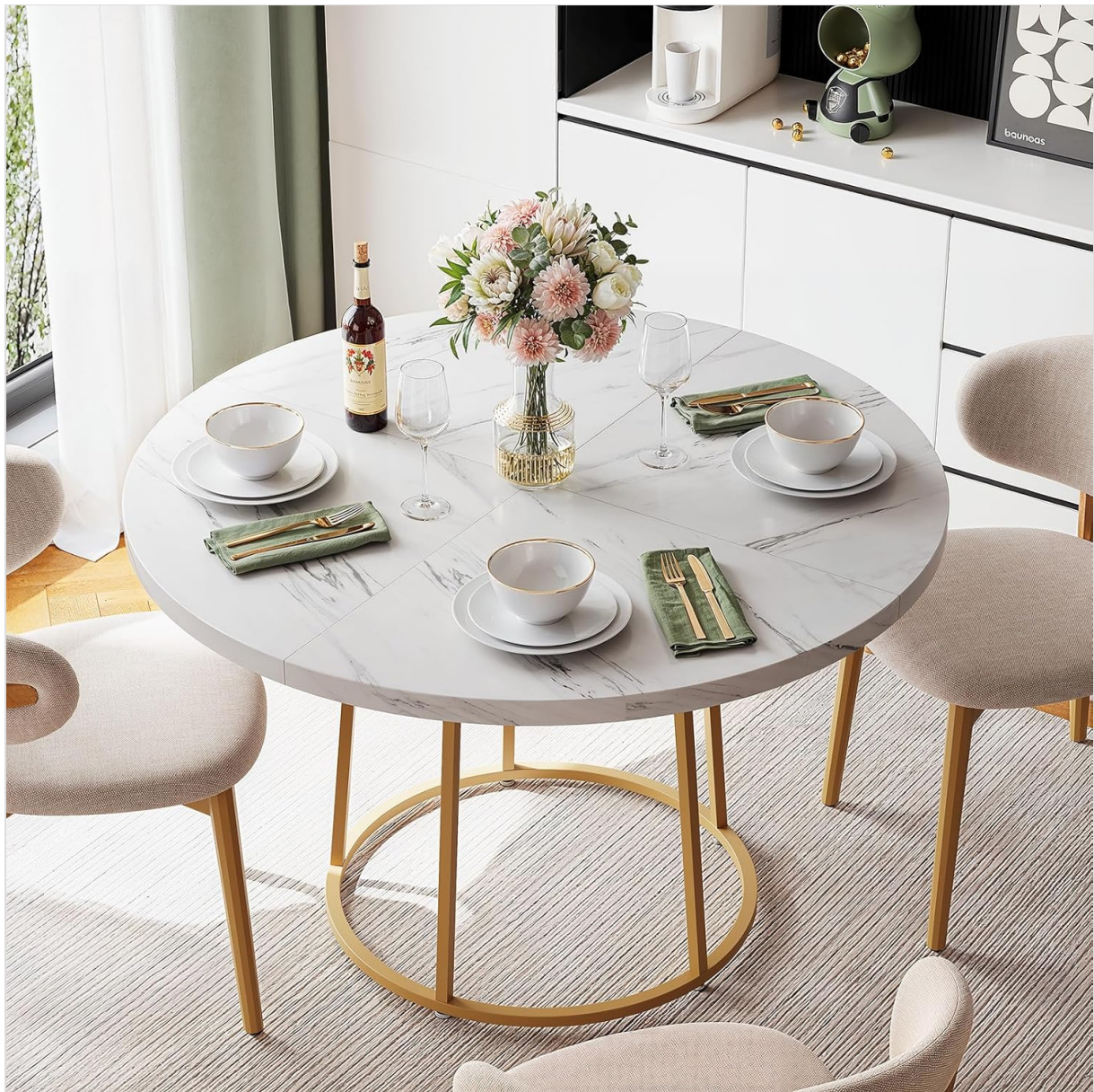
Image: A close-up view of the faux marble tabletop, highlighting its smooth, easy-to-clean surface with a bowl of food and cutlery.