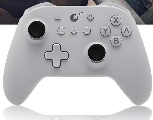
Image: An illustration showing the anti-friction metal stick ring component of the GuliKit KK3 joystick, designed for smoother control.