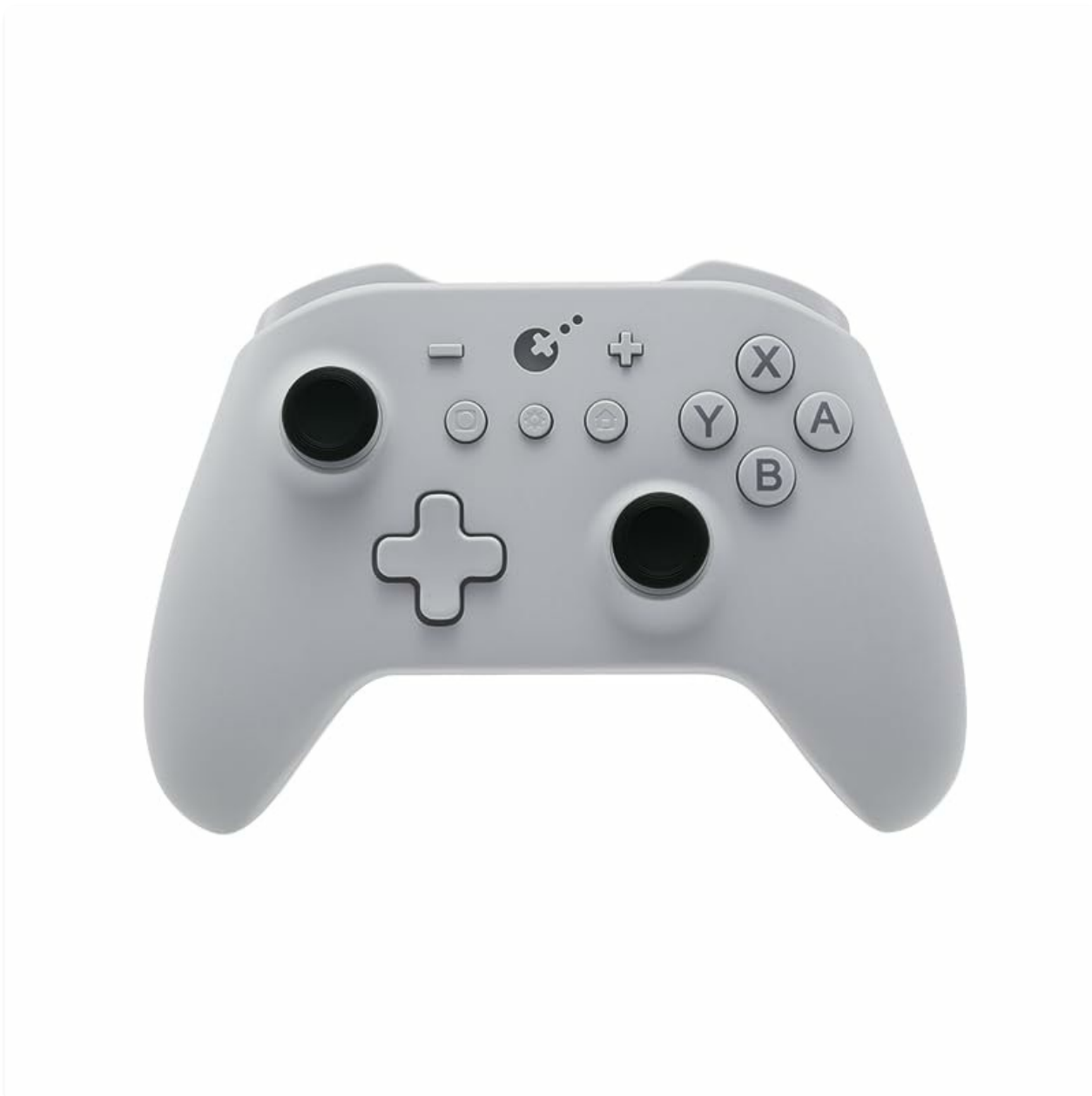
Image: An illustration showing the GuliKit KK3 controller's various modes and compatibility with Switch, PC X-input, iOS, Android, and D-input.

Connect the controller to your device using the provided USB-C cable. The controller should be automatically recognized and ready for use.