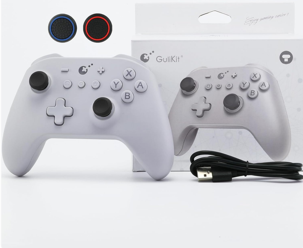
Image: The GuliKit KK3 Wireless Controller in gray, shown with its charging cable and two sets of joystick caps.