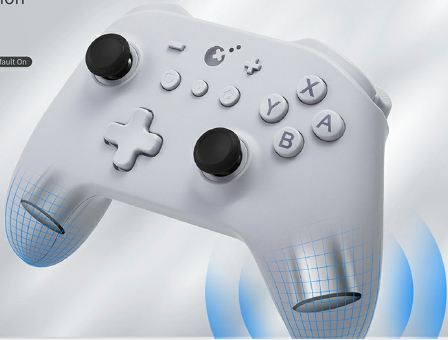
Image: An illustration of the GuliKit KK3 controller's asymmetric rotor vibration motors and their three adjustable levels.