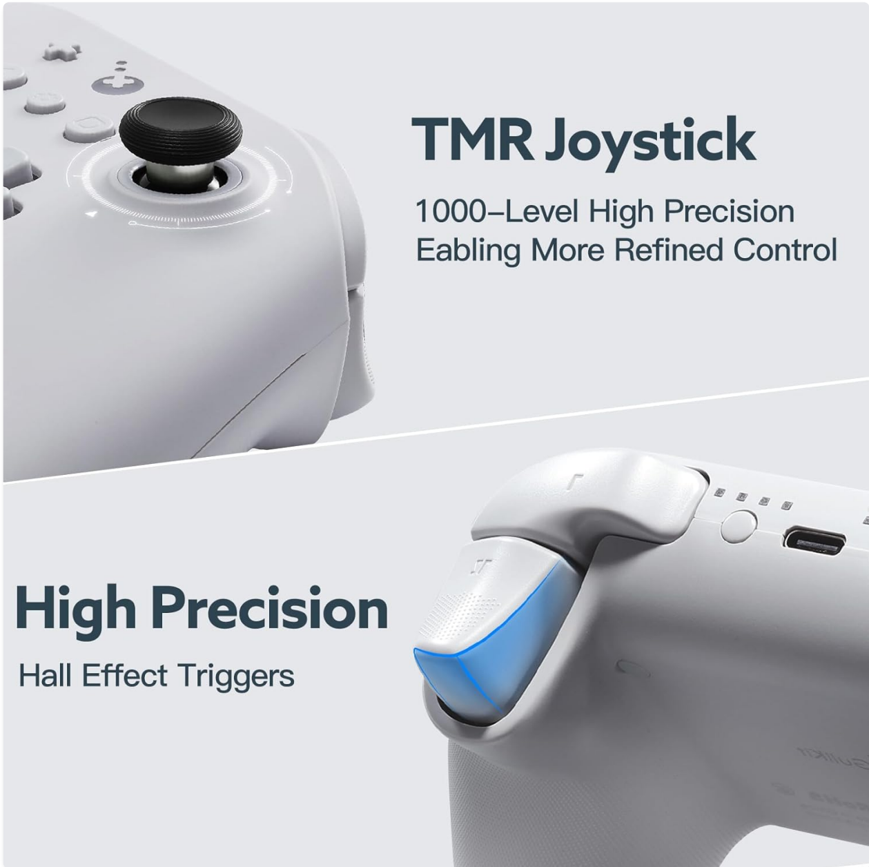
Image: A close-up view of the GuliKit KK3 controller's TMR joystick, highlighting its precision.