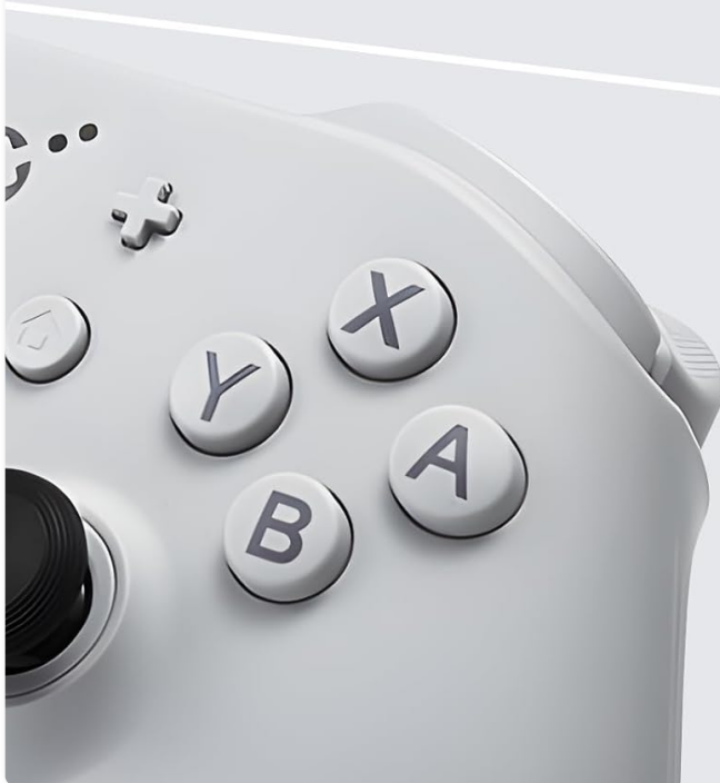
Image: The GuliKit KK3 controller with arrows indicating the six-axis gyroscope's motion control capabilities.

Second-Generation Tactile Buttons Enhanced Reliability