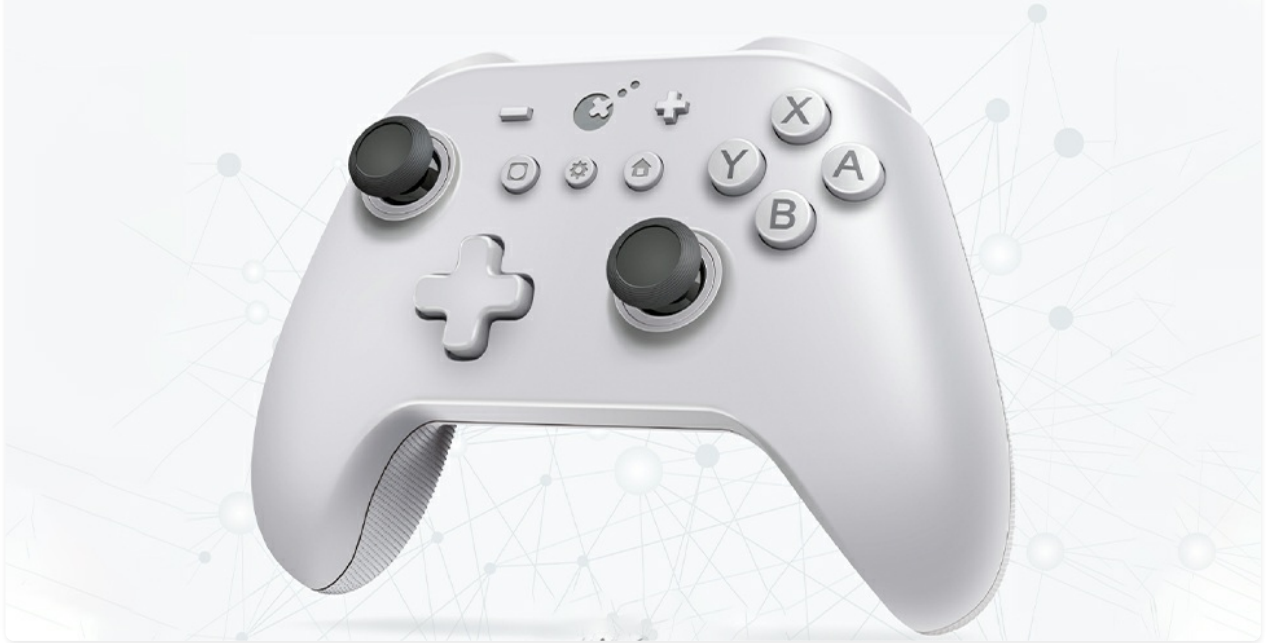
Image: An overview of the GuliKit KK3 controller's multi-platform compatibility, including Windows, Switch, Android, and iOS platforms, supporting both wired and wireless connections.