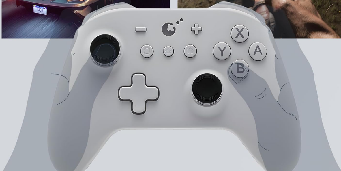
Image: A detailed view of the GuliKit KK3 controller's Hall Effect triggers, emphasizing their high precision.