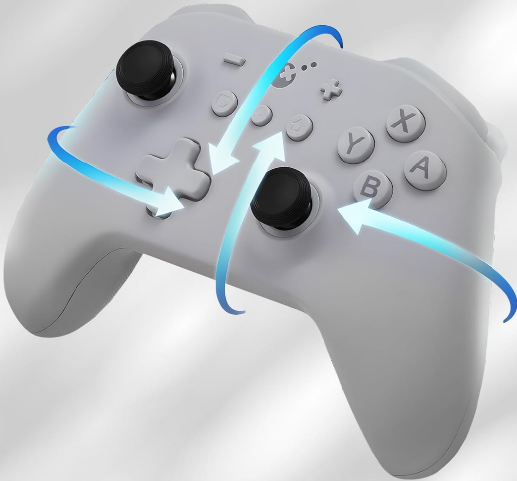
Image: The GuliKit KK3 controller shown in use with examples of continuous fire functionality in gaming scenarios.

Enhance the realism of the gaming experience, making you feel like you are personally on the scene.