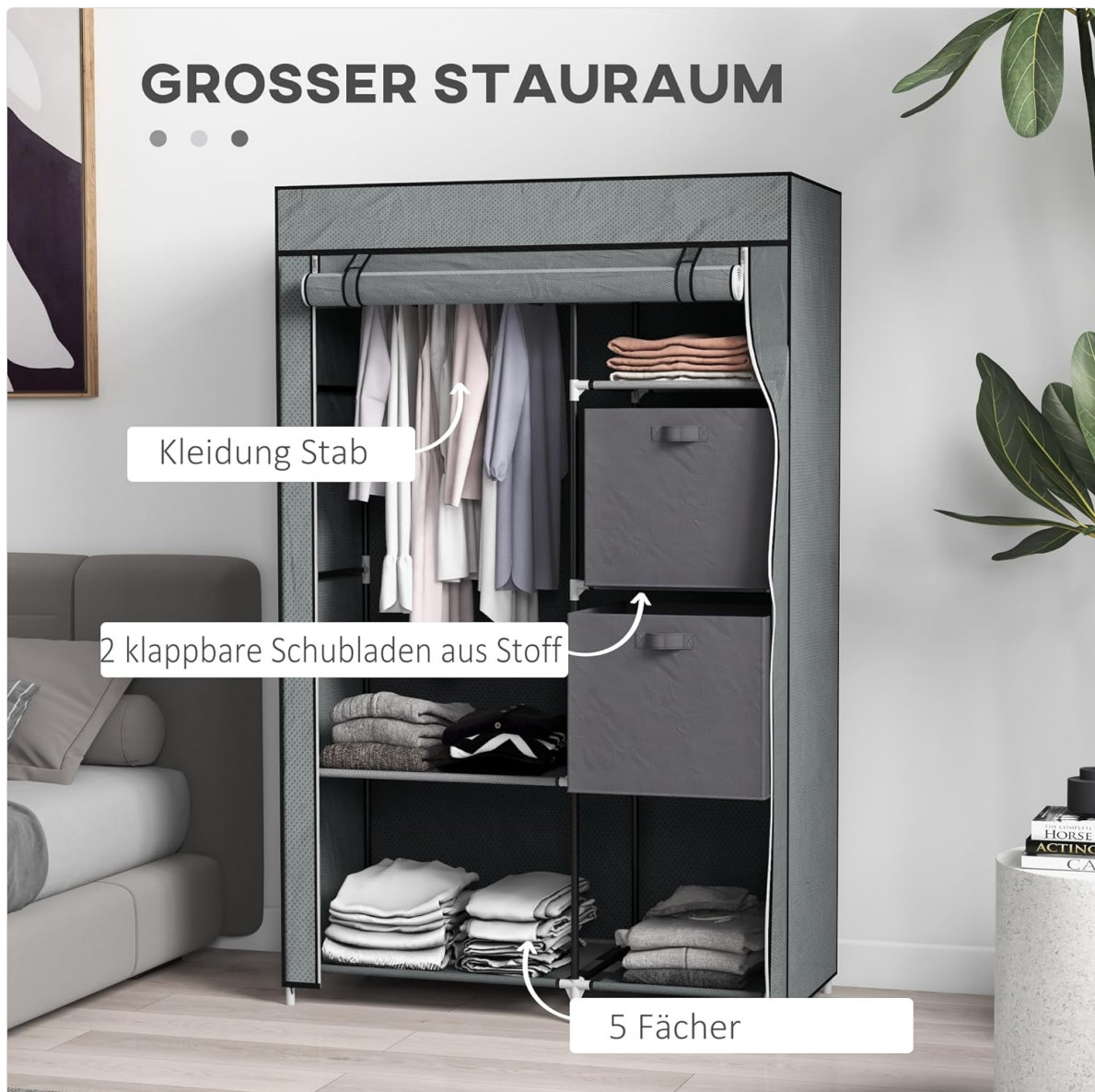
Image 1.2: Labeled features of the wardrobe, including the clothes rod, two folding fabric drawers, and five compartments.