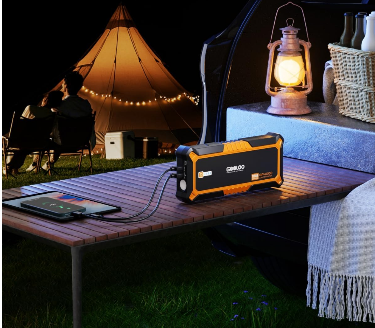
Image: The GOOLOO GP4000 jump starter acting as a power bank, charging a tablet and a smartphone in an outdoor camping scenario.