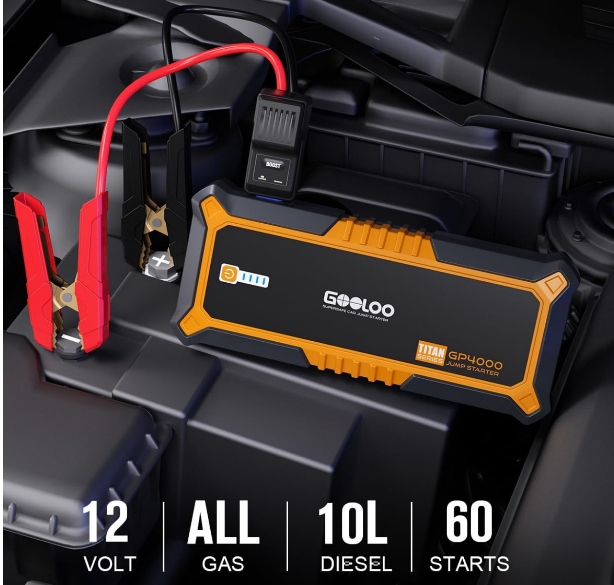
Image: The GOOLOO GP4000 jump starter connected to a car battery, illustrating the jump-starting process.

It can start most 12V vehicles, meeting the needs of most families.