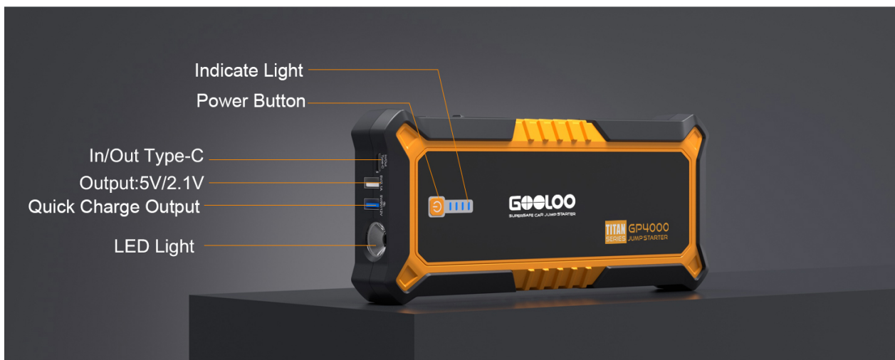
Image: Overview of the GOOLOO GP4000 jump starter unit, highlighting its various ports and control buttons.