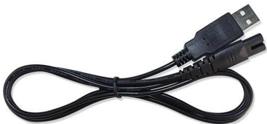
Figure 2: Kircuit 5V 2-Pin AC Adapter coiled. This view shows the adapter cable neatly coiled, highlighting both the USB-A plug and the 2-pin barrel connector, ready for storage or use.