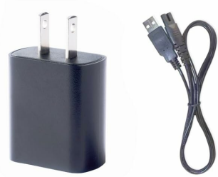
Figure 1: Kircuit 5V 2-Pin AC Adapter. This image displays the complete adapter cable, featuring a standard USB-A connector on one end and a 2-pin barrel connector on the other, designed for compatible devices.