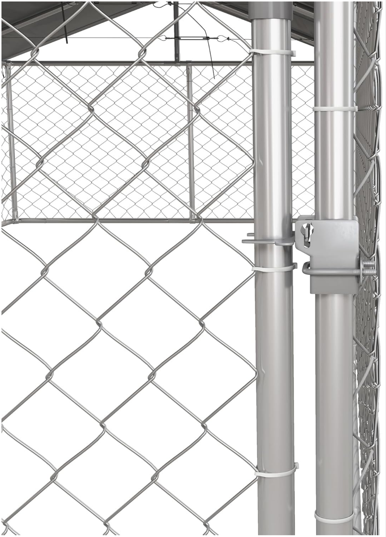
Figure 6: Detail of the secure lock mechanism on the kennel door, ensuring pet safety.