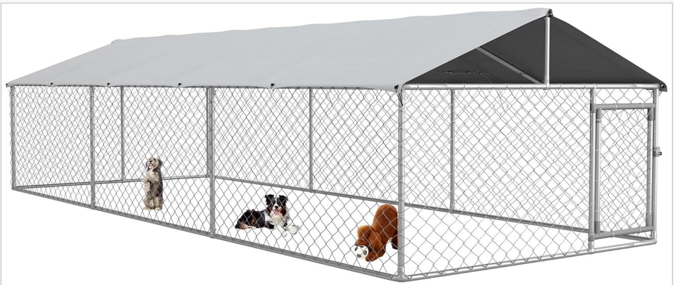
Figure 1: Overview of the PawHut Large Outdoor Dog Kennel with its waterproof cover and spacious design.

This manual provides detailed instructions for the assembly, operation, and maintenance of your PawHut Large Outdoor Dog Kennel. Designed for large-sized breeds, chickens, and ducks, this heavy-duty kennel offers a secure and comfortable outdoor space with a waterproof cover and galvanized chain link construction.