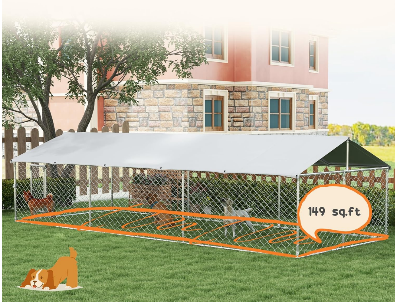
Figure 2: Illustration highlighting the spacious 149 sq. ft. living area of the kennel, suitable for large dogs.

Let your pet relax without feeling tied up