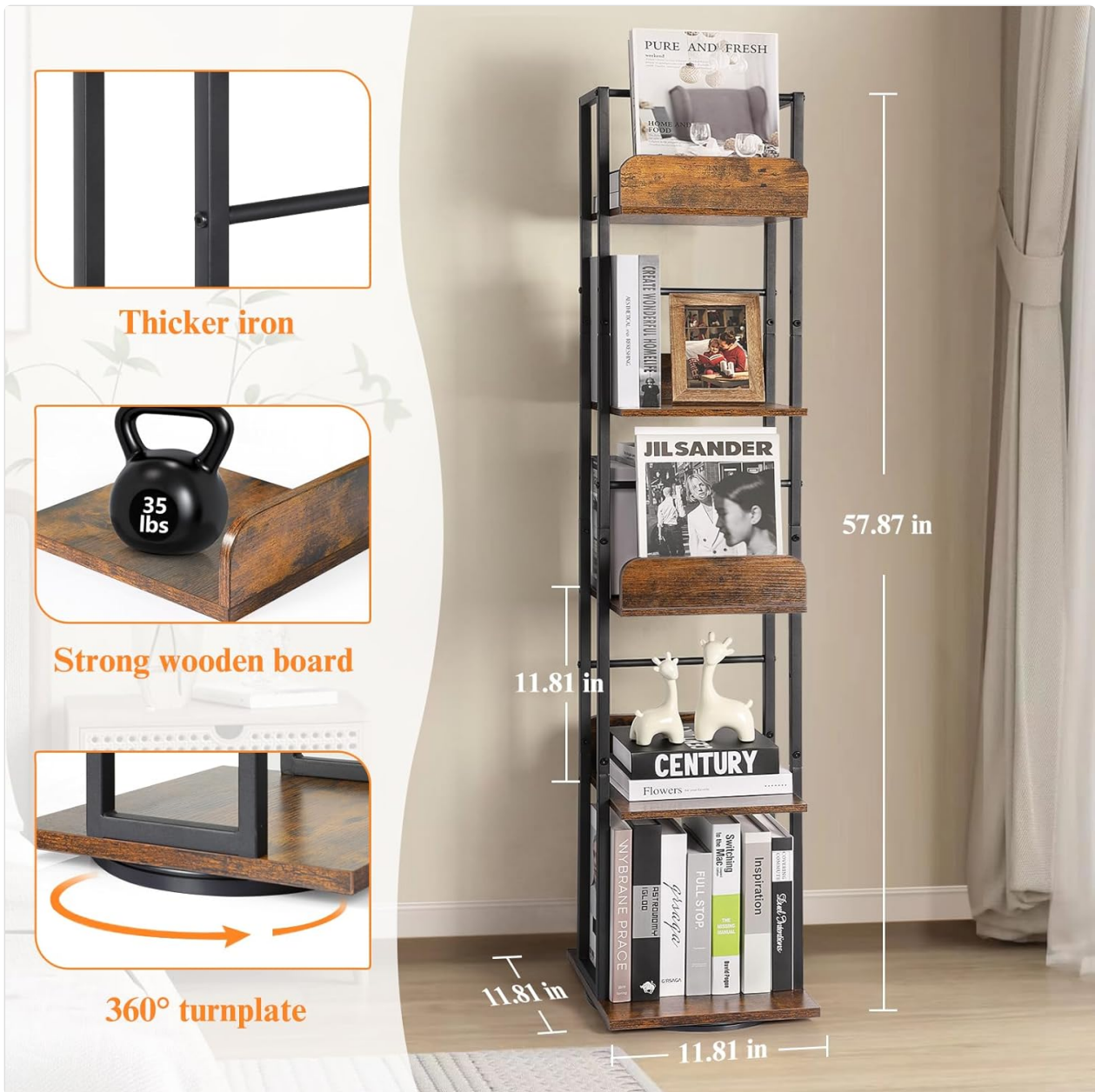
Image: A detailed view highlighting the bookshelf's dimensions (58.7 inches high, 11.8 inches wide and deep), thicker iron frame, strong wooden boards, and the 360-degree turntable mechanism.