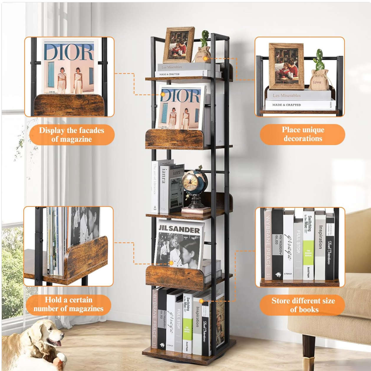
Image: The bookshelf displaying magazines, books, and decorative items, illustrating its versatile storage capabilities.