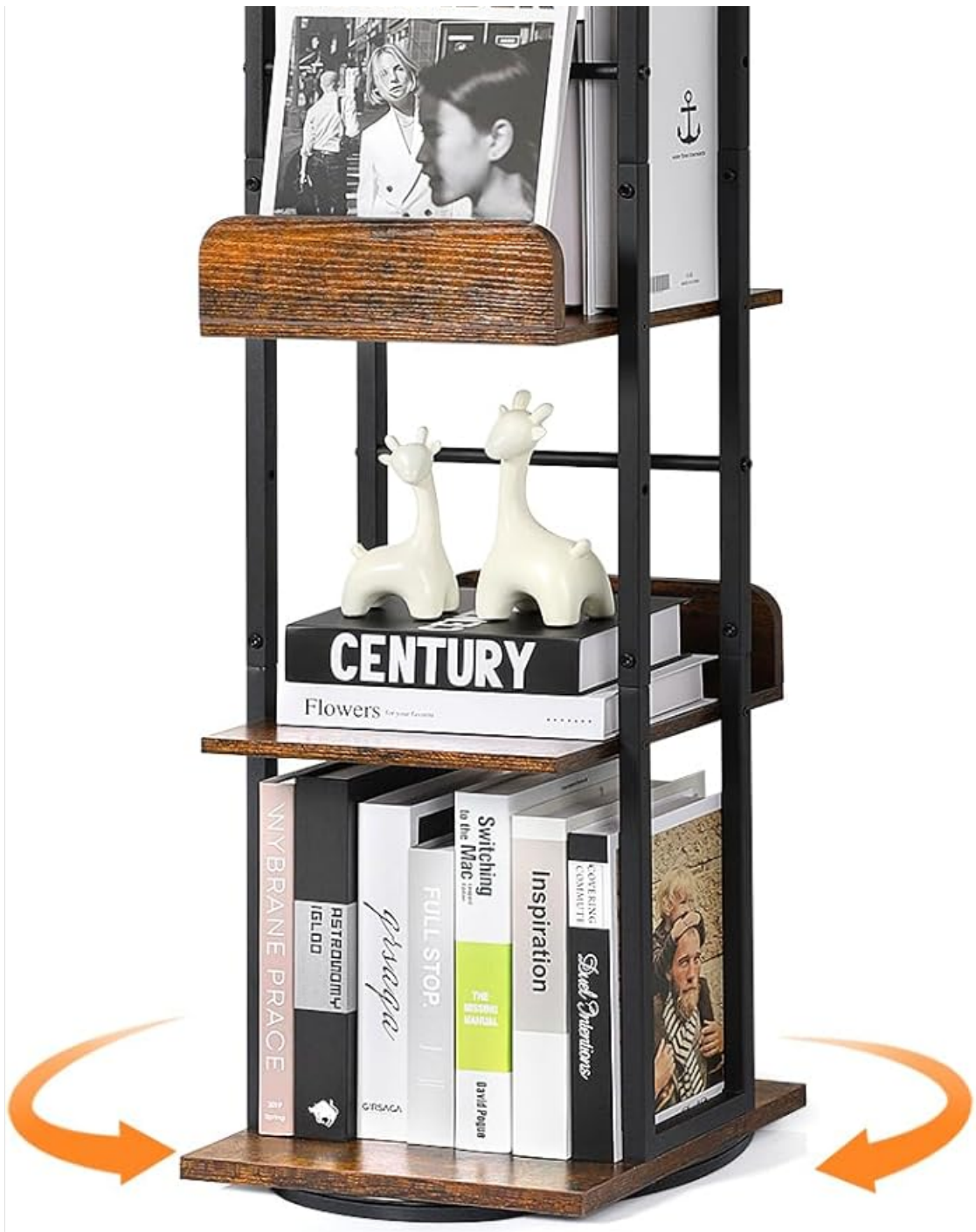
Image: The Bikoney 5-Tier Rotating Bookshelf, showcasing its tall, narrow design and rotating base.