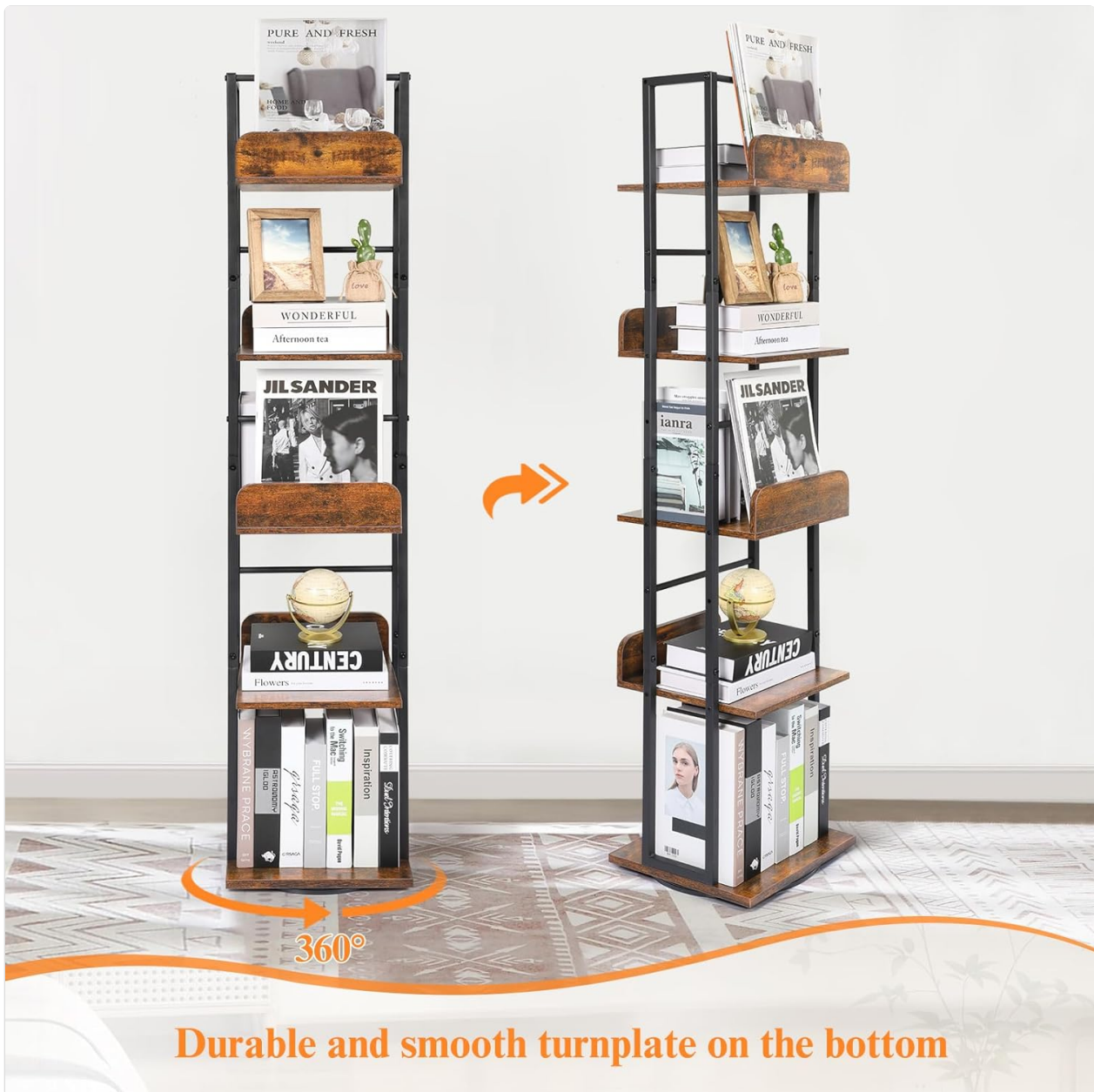
Image: The bookshelf shown rotating, emphasizing the smooth and durable turntable at its base.