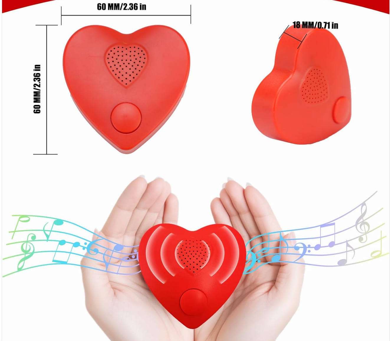
Figure 3: Product dimensions. The device measures approximately 60mm x 60mm x 18mm (2.36 x 2.36 x 0.71 inches) and weighs 28.8 grams.