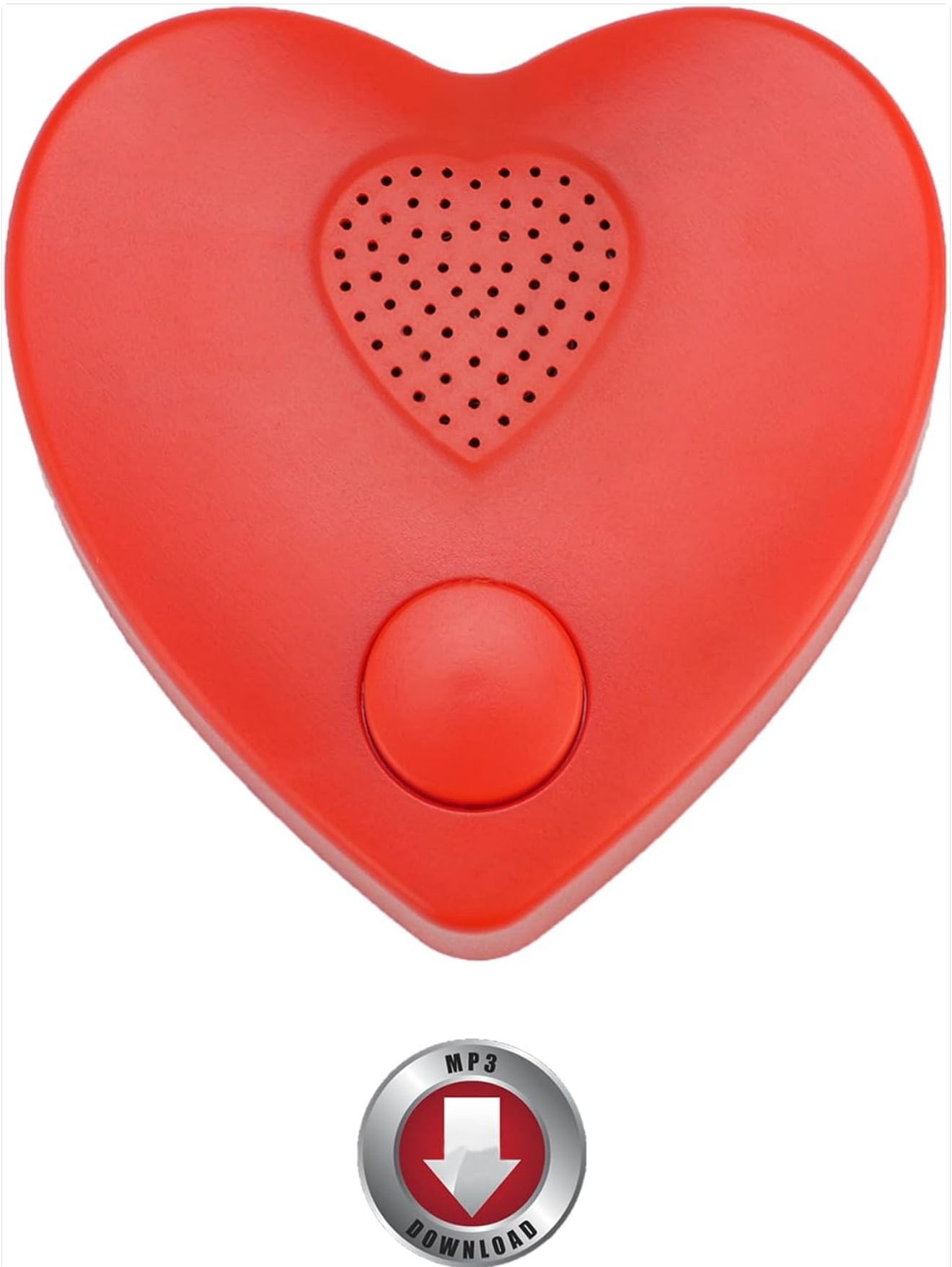
Figure 1: Front view of the XLW 16-Minute Voice Recorder. This image shows the heart-shaped design, the central speaker, and the main play button.