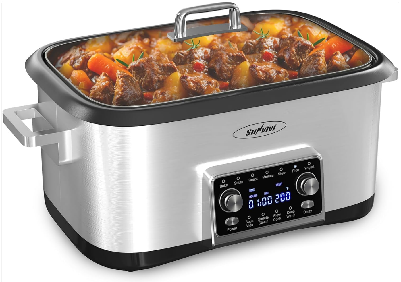
Image: The Sunvivi 8-Liter Programmable Multicooker with its main unit, removable cooking pot, and glass lid, shown with food cooking inside.