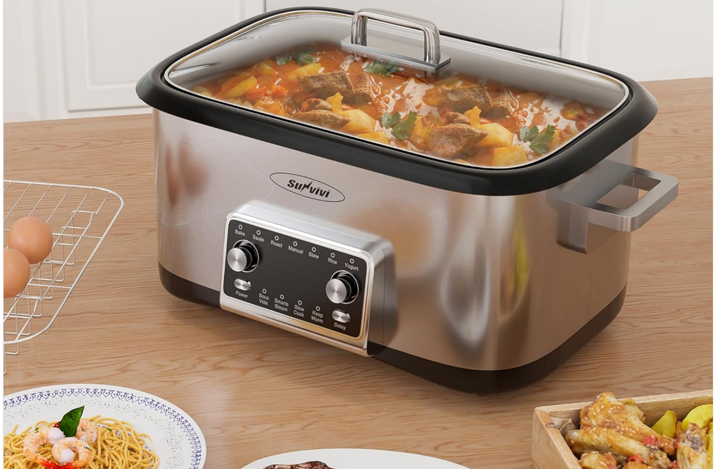
Image: An overview of the Sunvivi Multicooker highlighting its 12 functions: Bake, Saute, Roast, Manual, Stew, Rice, Yogurt, Sous Vide, Smarts Steam, Slow Cook, Keep Warm, and Delay.