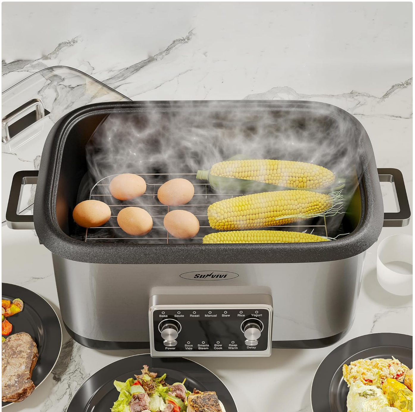
Image: The Sunvivi Multicooker in use, demonstrating the steaming function with corn on the cob and eggs on the included steaming rack.