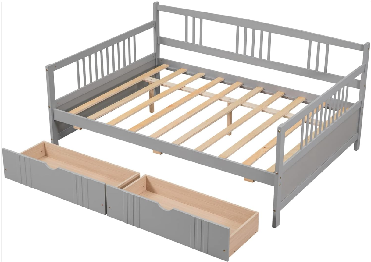
Image: Assembled daybed frame with storage drawers extended, illustrating the wooden slat support system.

Refer to the detailed installation instructions included in your product packaging for specific diagrams and hardware identification.