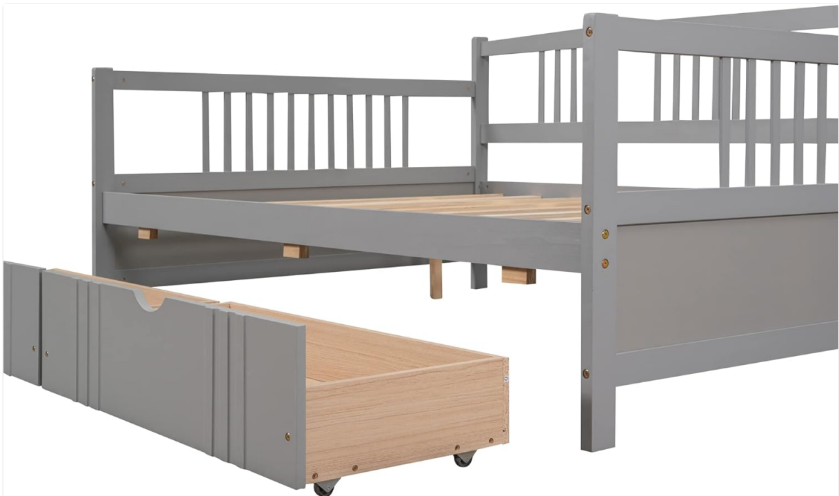
Image: Detailed view of a daybed drawer, highlighting its construction and rolling mechanism for smooth operation.