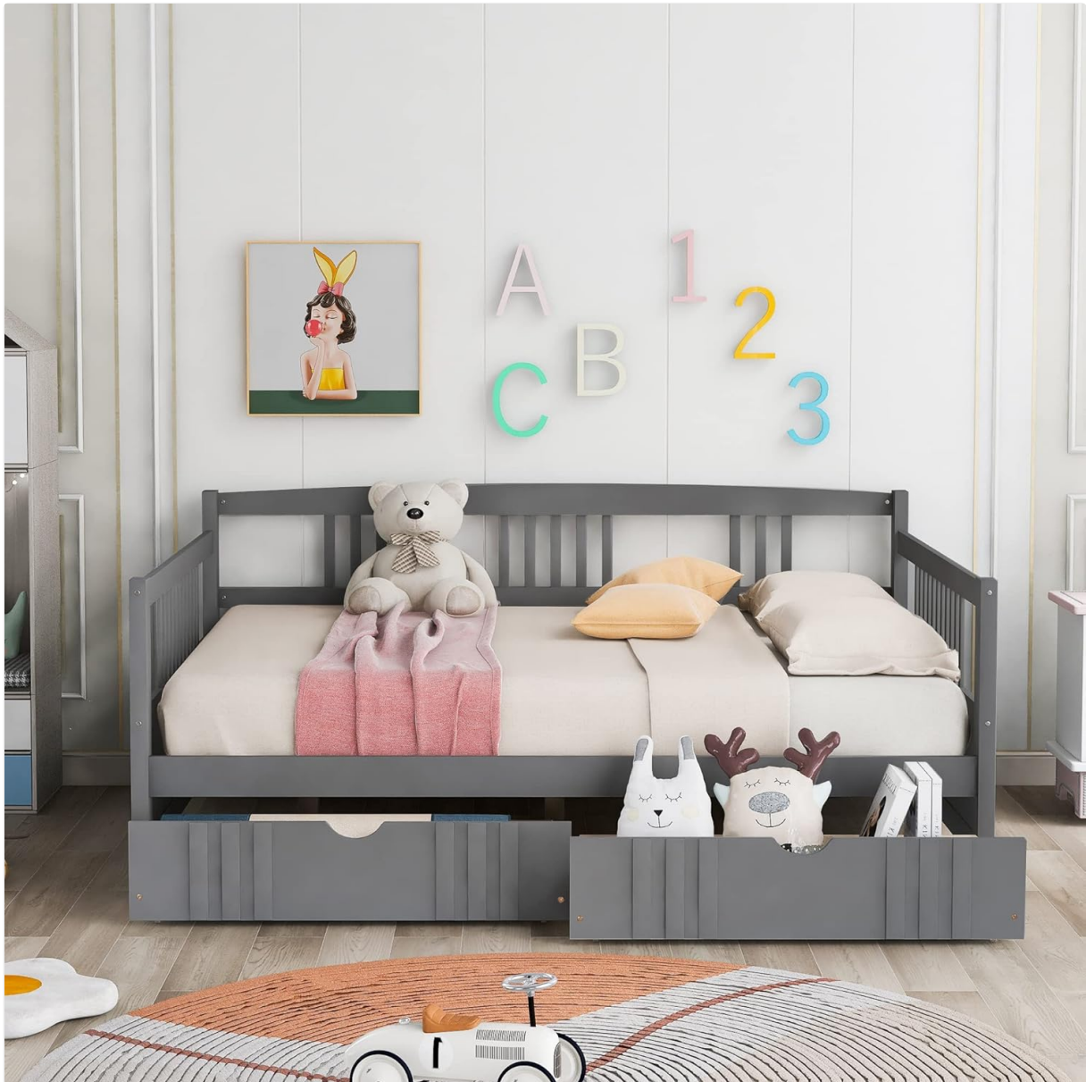
Image: The Flieks daybed configured as a sofa with cushions and decorative items, demonstrating its dual functionality.

The three-sided rail design allows the daybed to function as a sofa. Arrange pillows and cushions against the back and side rails for comfortable seating in a living room or guest room setting.