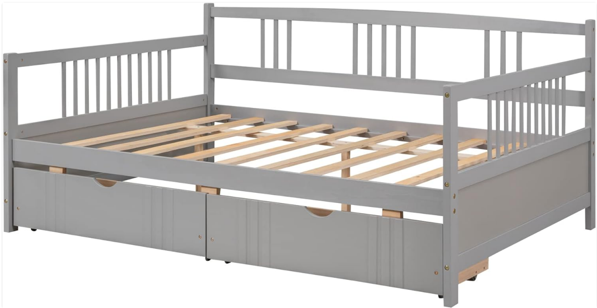
Image: Front view of the Flieks daybed with both storage drawers neatly closed and integrated into the design.