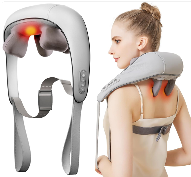
Image: The PERLEVI Neck and Shoulder Massager shown from the front and worn on a person's shoulders, highlighting its design and how it sits on the body.

Thank you for choosing the PERLEVI Neck and Shoulder Massager. This device is designed to provide deep tissue shiatsu kneading massage with an optional heat function, aiming to relieve muscle soreness and fatigue in various body areas. Please read this manual thoroughly before use to ensure safe and effective operation.