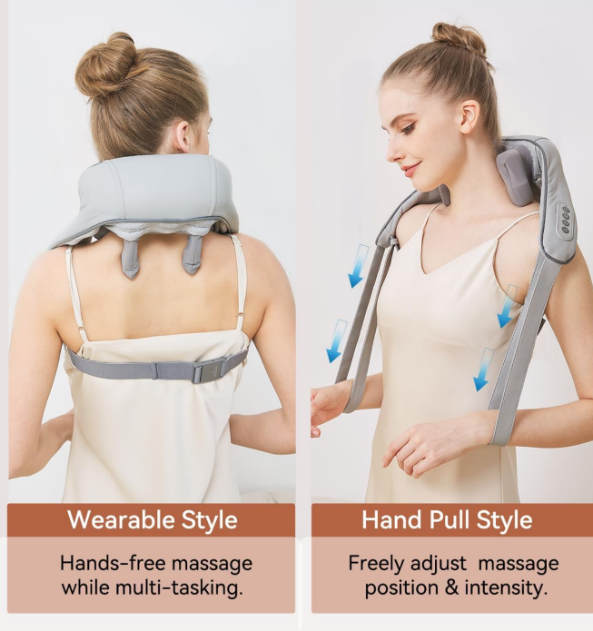
Image: A woman wearing the massager in the hands-free, wearable style, secured with a strap across her back.

Wearable Style: Secure the massager around your neck and shoulders using the adjustable strap for hands-free operation, ideal for multitasking.