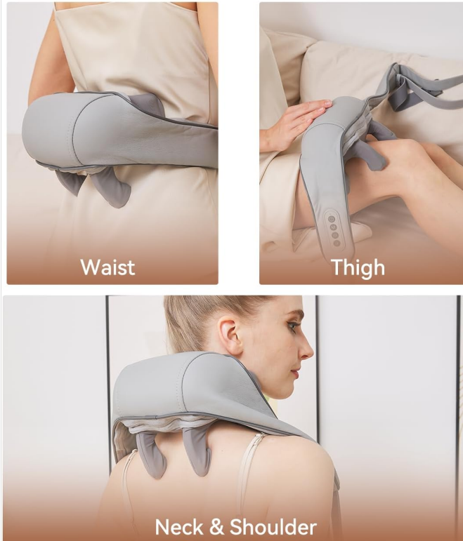
Image: A collage demonstrating the massager's versatility, showing it applied to the waist, thigh, and neck & shoulder areas.