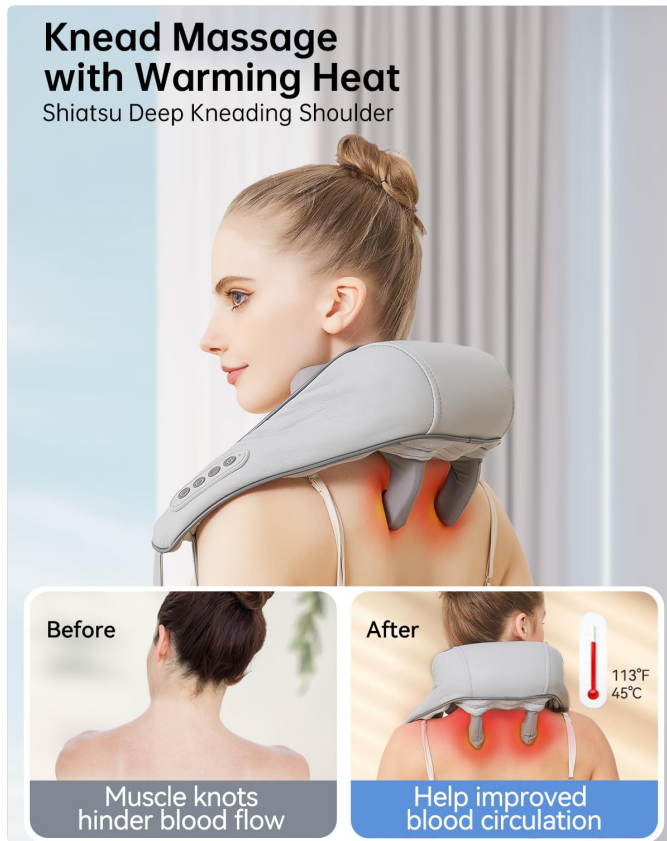
Image: A comparison showing "Before" with muscle knots hindering blood flow and "After" with improved blood circulation due to the warming heat function, indicating a temperature of 113°F (45°C).