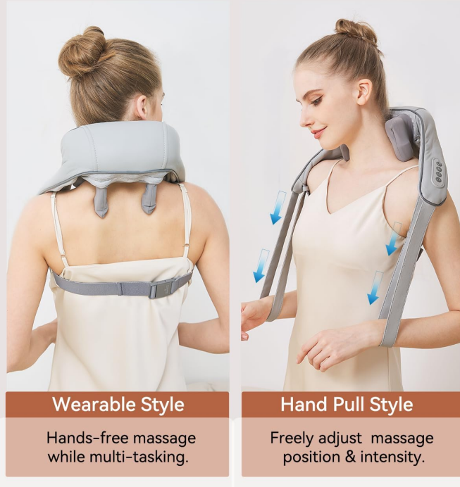
Image: A woman holding the massager by its straps, demonstrating the hand-pull style to adjust position and intensity.

Hand Pull Style: Hold the straps to freely adjust the massage position and intensity by pulling the massager closer to your body.