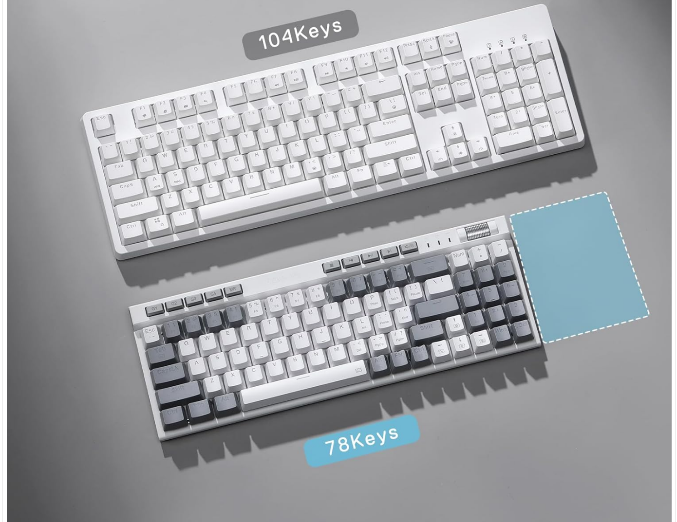
Figure 2: 75% 78-Key Layout vs. 104-Key Layout