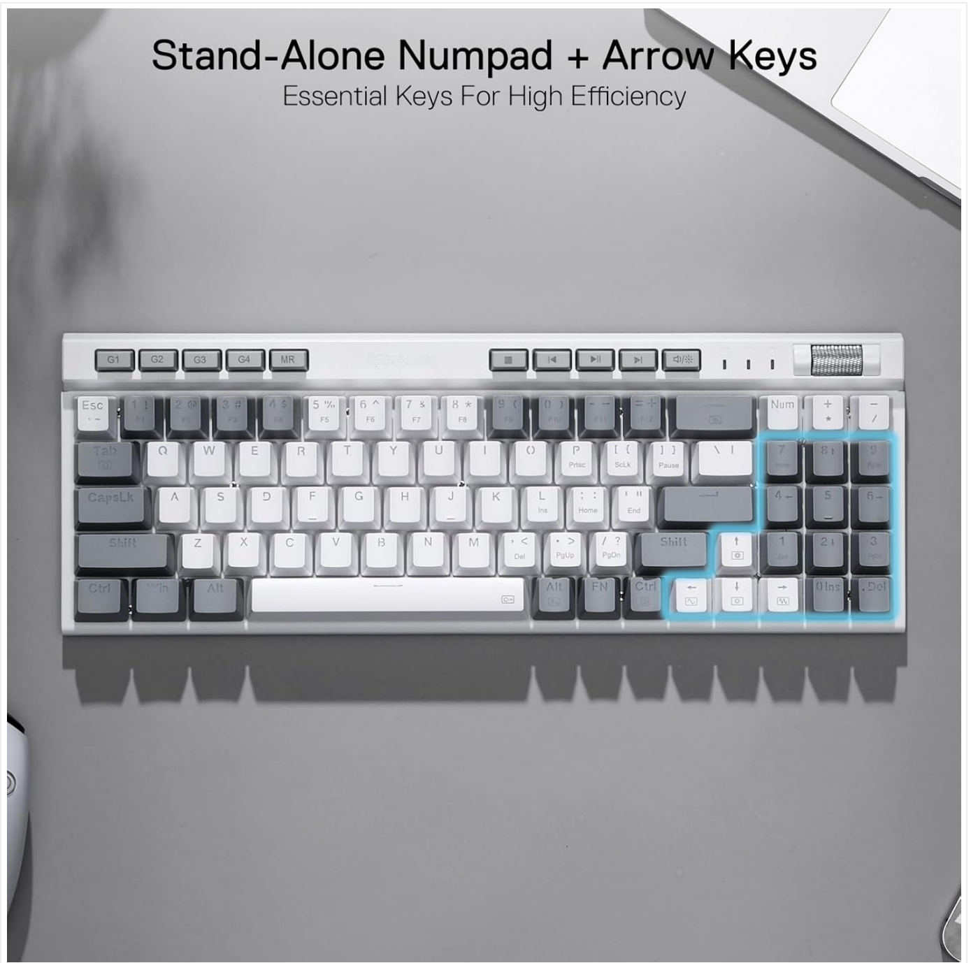
Figure 3: Standalone Numpad and Arrow Keys