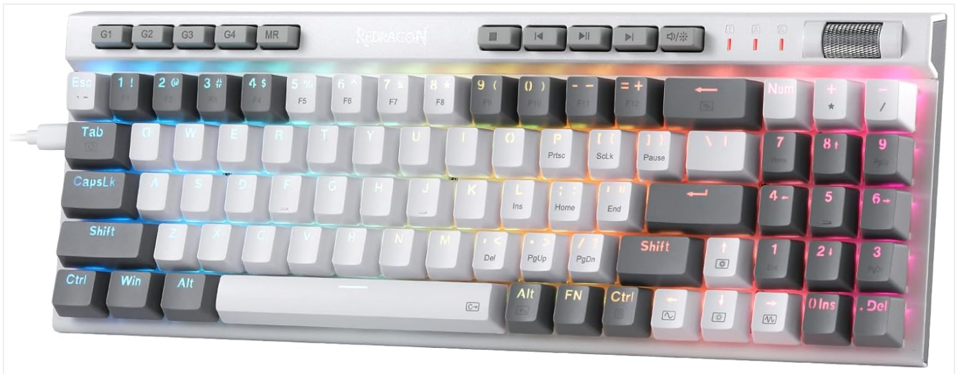
Figure 1: Redragon K655 Keyboard Overview

The K655 features a 75% compact layout with 78 keys, providing a balance between functionality and space-saving design. It includes a dedicated numpad and arrow keys for enhanced practicality.