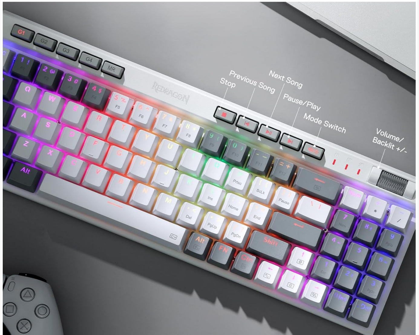
Figure 6: On-Board Macros & Media Control