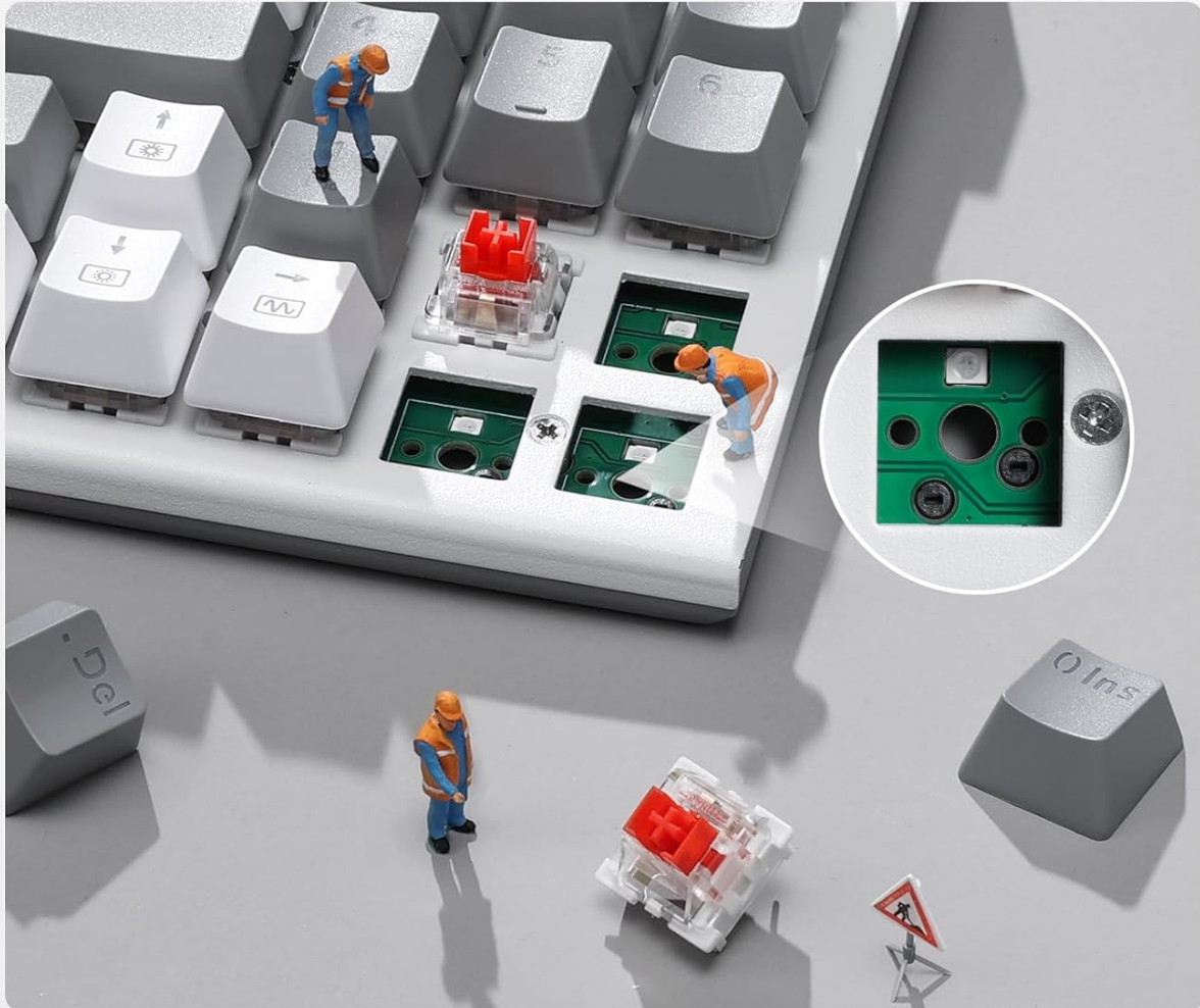
Figure 5: Upgraded Hot-Swappable Socket