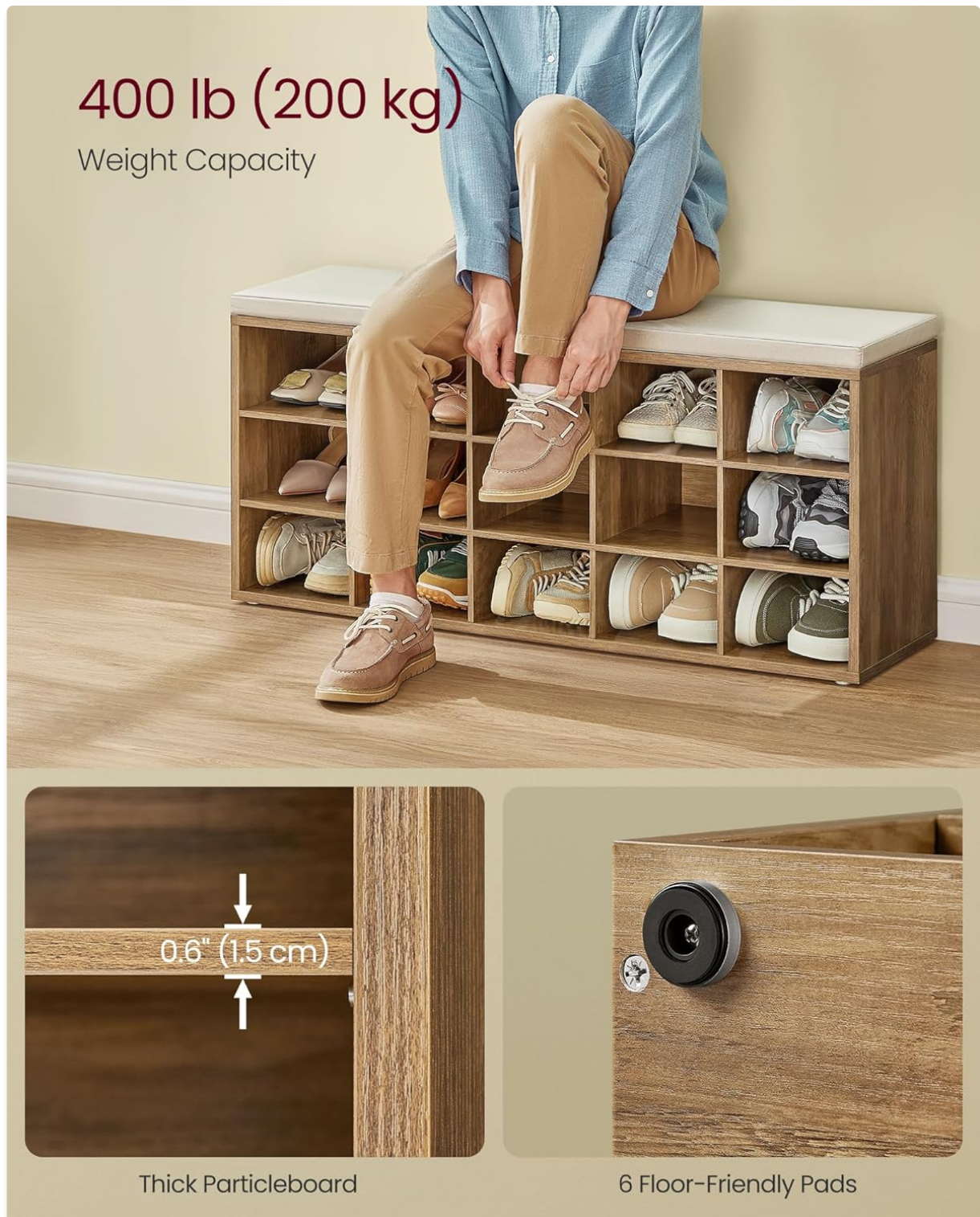
Image 2.1: Detail showing the thick particleboard construction and floor-friendly pads for stability and protection.