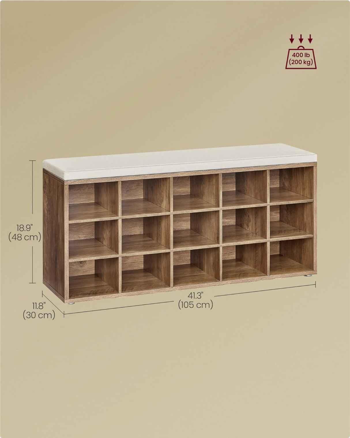
Image 6.1: Detailed dimensions of the shoe bench for accurate placement and planning.

For specific warranty information regarding your VASAGLE CUSTOS Shoe Bench, please refer to the documentation included with your purchase or visit the official VASAGLE website. No specific warranty details were provided in the product data.