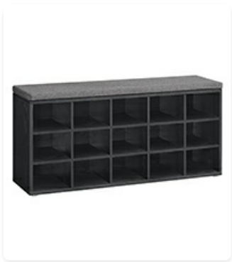
Image 4.1: The padded cushion is attached with hook-and-loop fasteners for easy removal and cleaning.