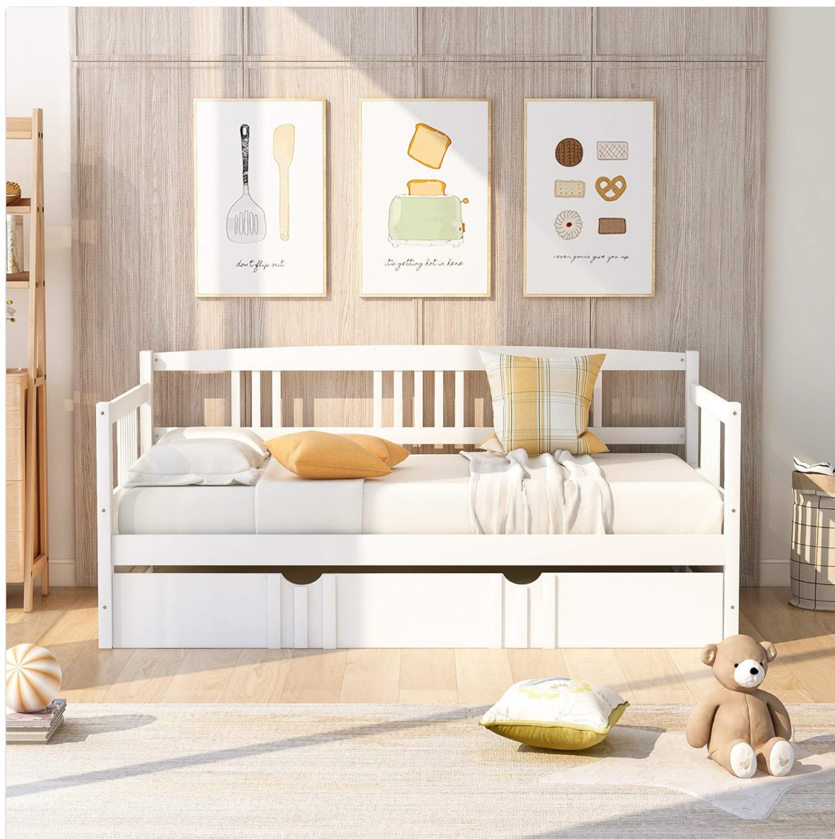
Image 5.1: The daybed arranged as a sofa, demonstrating its versatility for seating.

With its three-sided rail design, the daybed can easily function as a sofa. Simply add decorative pillows and throws to create a comfortable seating area in your living room or bedroom.