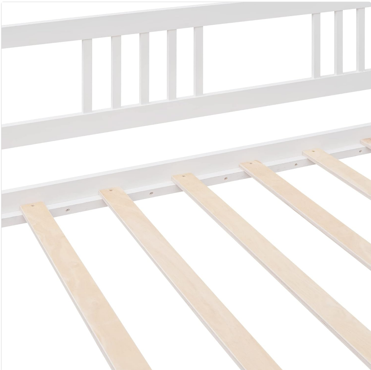
Image 4.2: Detail of the wooden slats on the main daybed frame, providing sturdy mattress support.