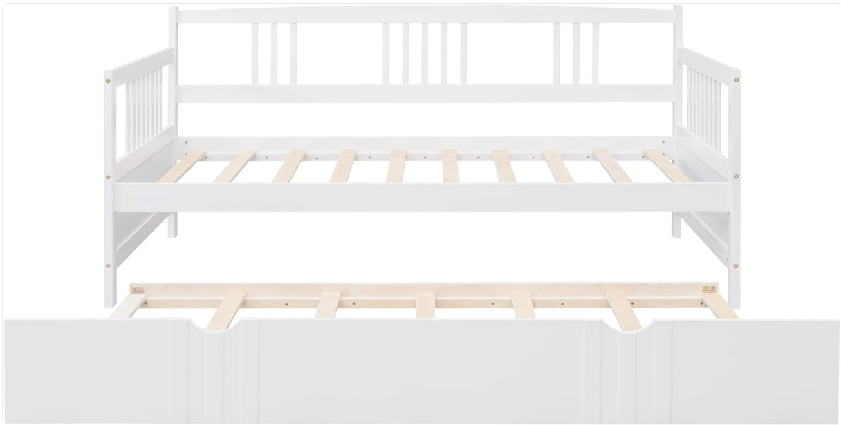
Image 4.1: Front view of the daybed and trundle frames, illustrating the slat support system for both beds.

5. Sliding the assembled trundle bed under the main daybed.