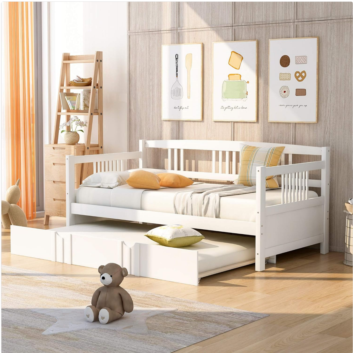
Image 1.1: The Flieks Wooden Daybed with Trundle, showcasing its design and the pulled-out trundle bed.