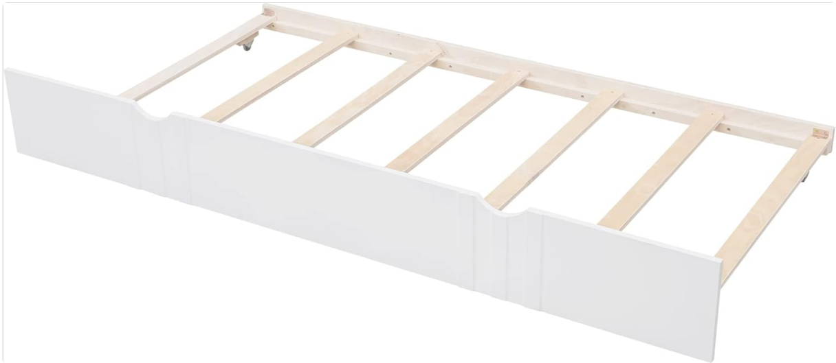
Image 5.2: Detail of the trundle bed frame, highlighting its wheeled design for easy pull-out and storage.

3. To store, simply push the trundle back under the main daybed until it is fully concealed.