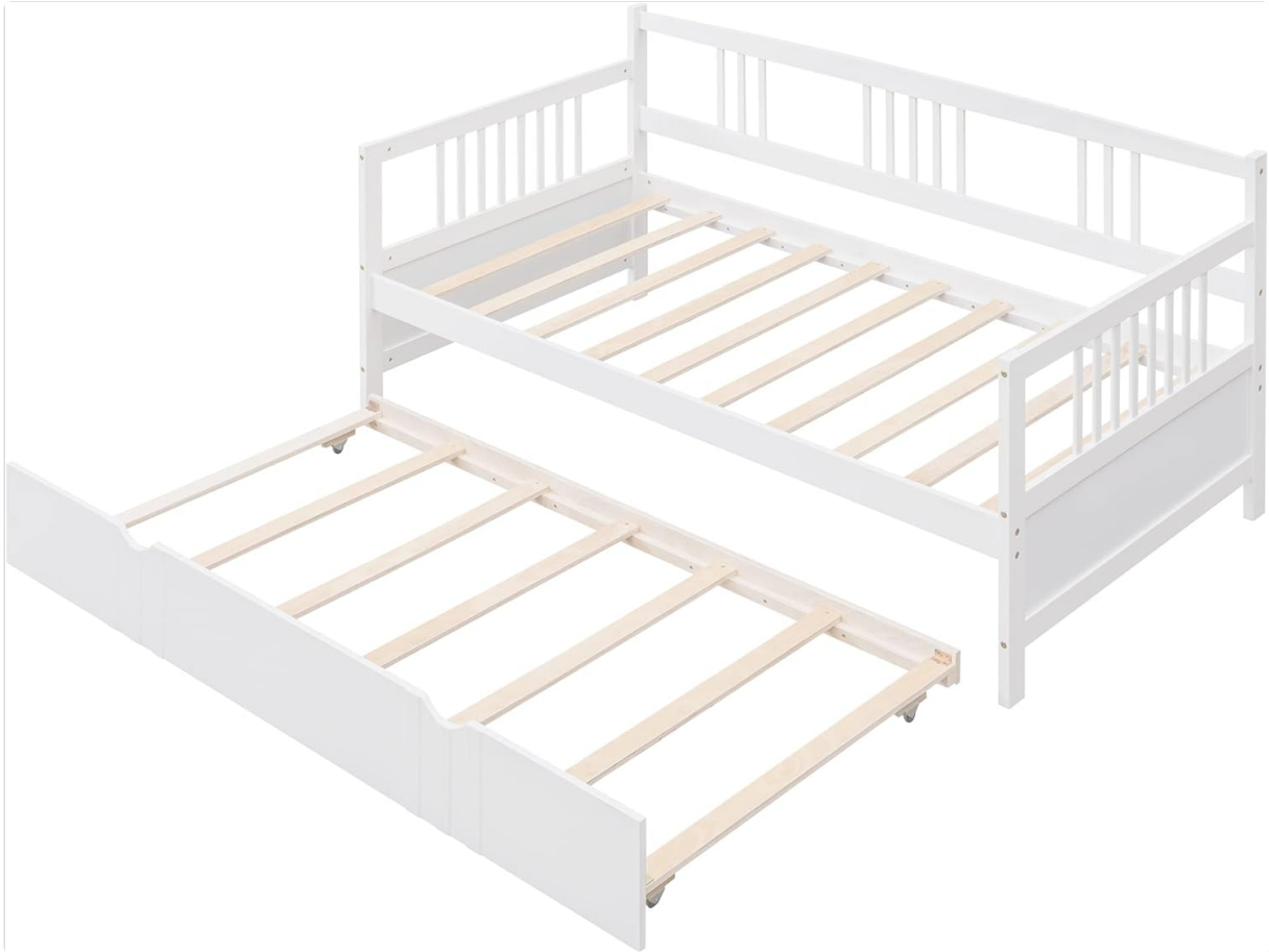
Image 3.1: Components of the Flieks Daybed, showing the main bed frame and the pull-out trundle frame with their respective wooden slats.