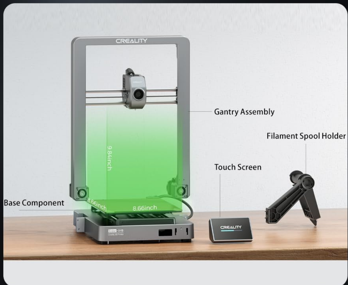
Figure 2: Quick assembly process of the Ender 3 V3, emphasizing its modular design for ease of setup.

Ender 3 V3 comes to you in highly pre-assembled modules. Printing size is 8.66*8.66*9.84inch.