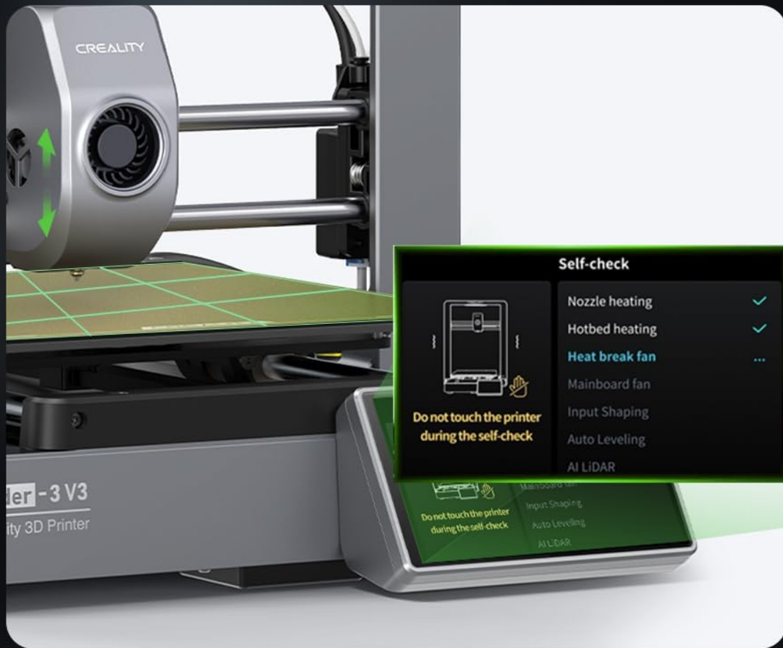
Figure 3: The printer's touchscreen interface during the auto-leveling and calibration sequence, which eliminates manual paper tests.

Give it a tap and walk away. The auto calibration gets everything ready for you. No need to pull a paper or turn any screws.