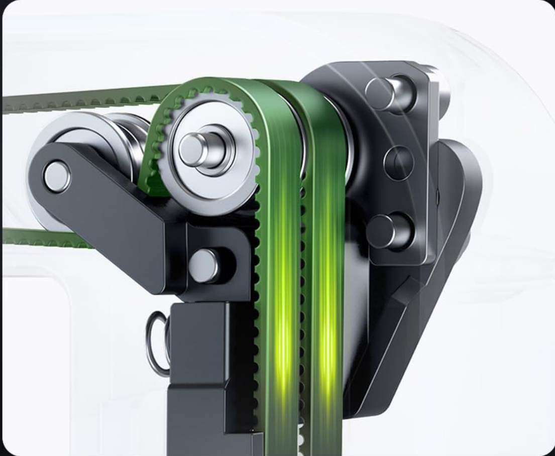
Figure 6: The automated XZ timing belt tensioning system, designed to prevent belt slips and jams for consistent performance.

The XZ timing belts Ender 3 V3 are tensioned automatically. Belt slips or jams now become a thing Of the past.