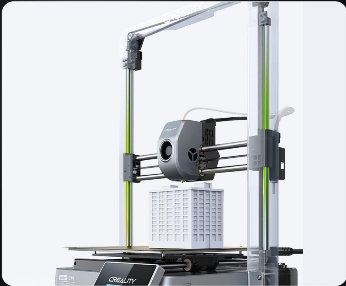
Figure 7: The Z-axis positioning accuracy is less than 15 micrometers, contributing to minimal Z-banding in 3D prints.

Z-axis positioning accuracy \leq 15\mu\text{m}