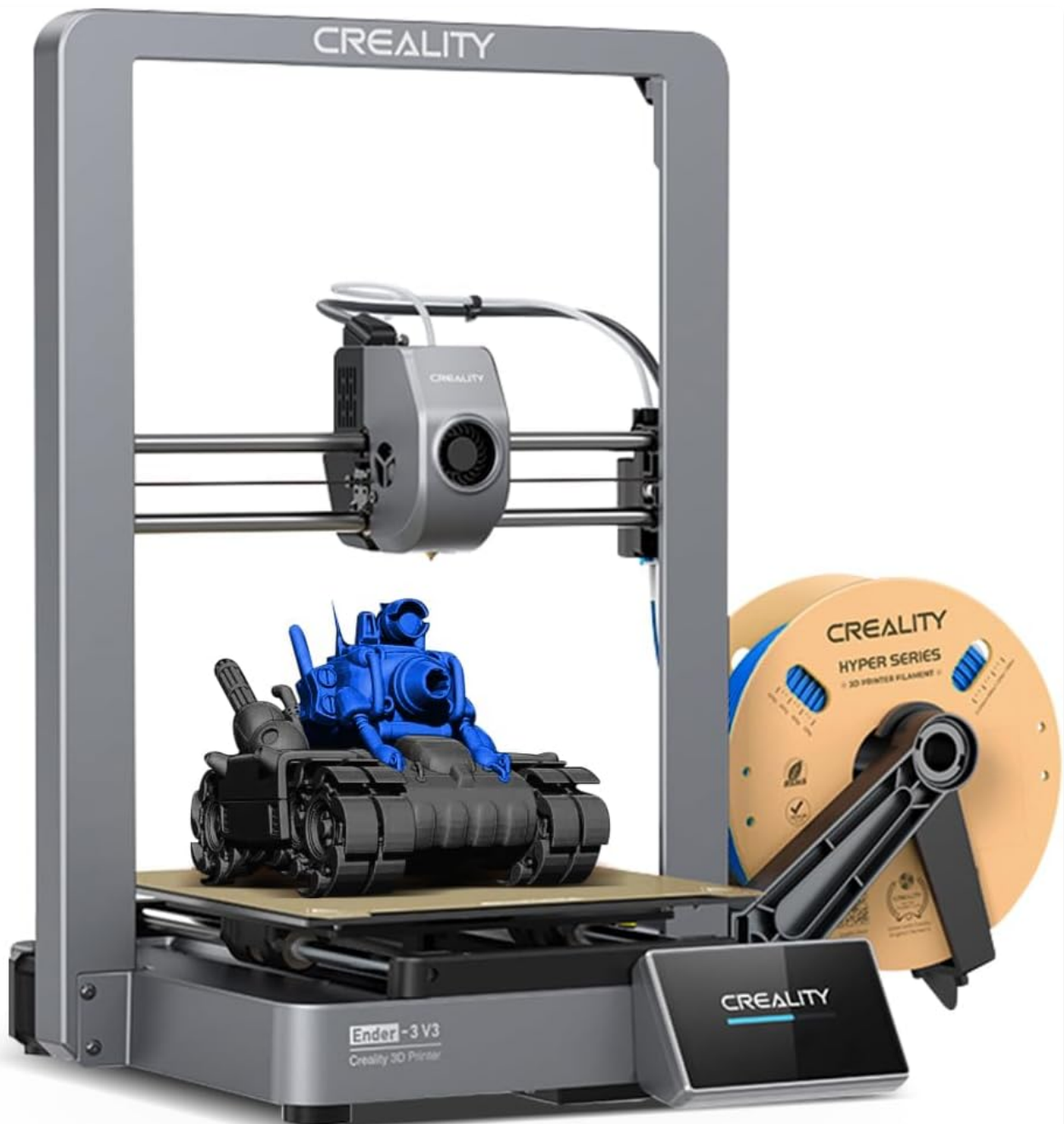
Figure 1: The Creality Ender 3 V3 3D Printer, showcasing its compact design and a sample print.