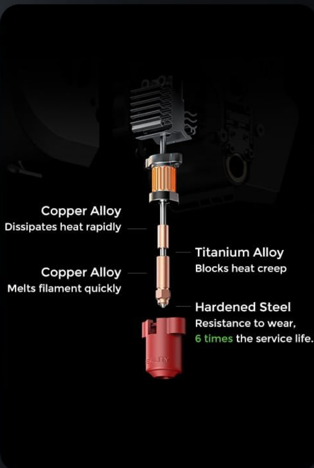
Figure 5: The powerful 60W ceramic hotend heater, capable of reaching 300°C in 75 seconds, and the durable steel-tipped copper nozzle with titanium alloy heatbreak.

The durable steel-tipped copper nozzle is integrated with a titanium alloy heatbreak. It blocks heatcreep and can be swapped super easily.