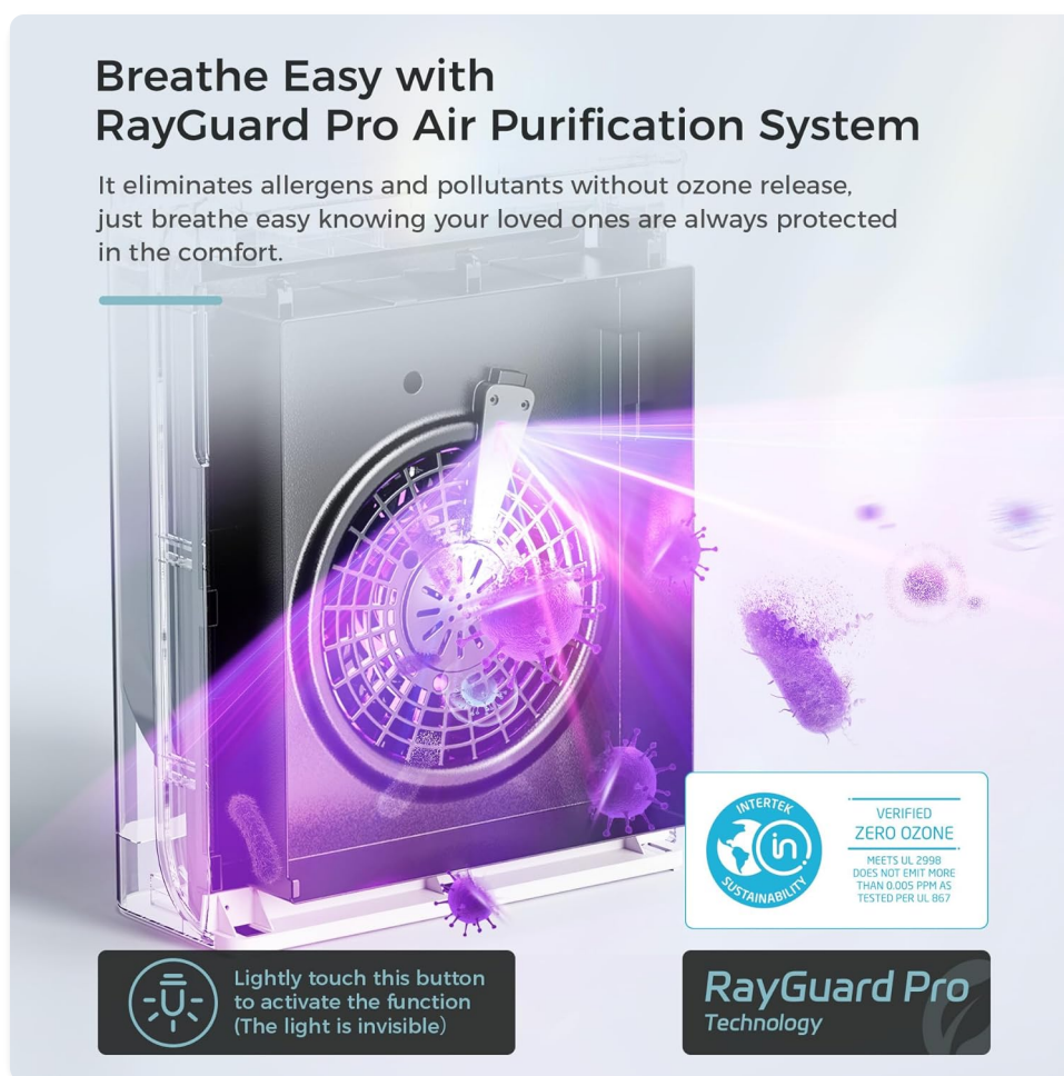
Figure 4.3: RayGuard Pro Air Purification System eliminates allergens and pollutants with zero ozone release.

The RayGuard Pro technology provides an additional layer of defense by helping to reduce harmful particles in the air without ozone release. This feature is activated by a light touch button on the control panel.