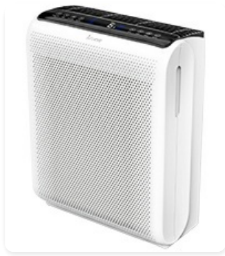
Figure 4.4: The air purifier features a 24-hour timer for convenient operation.