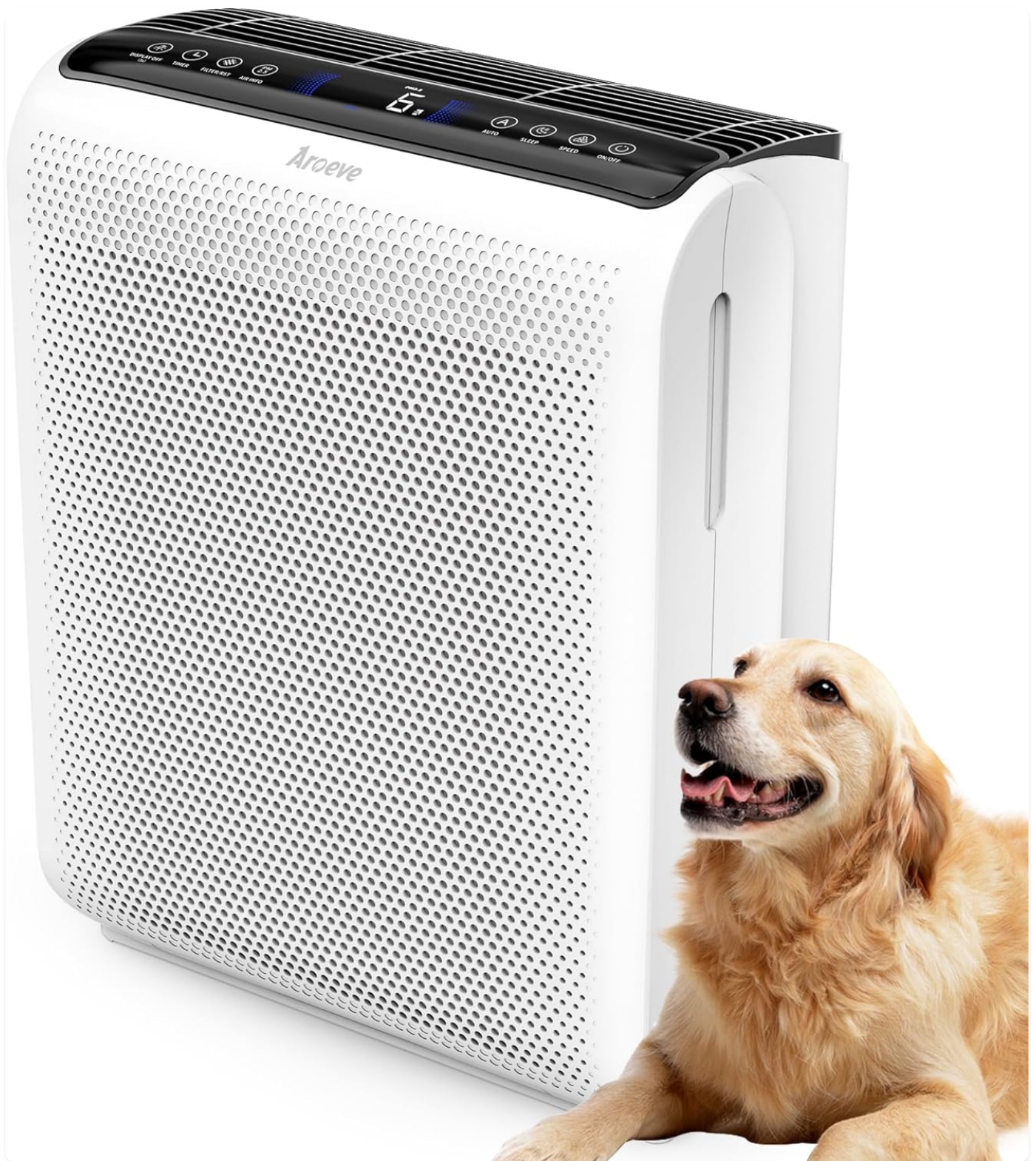
Figure 1.1: AROEVE MK07 Air Purifier, showcasing its design and suitability for homes with pets.