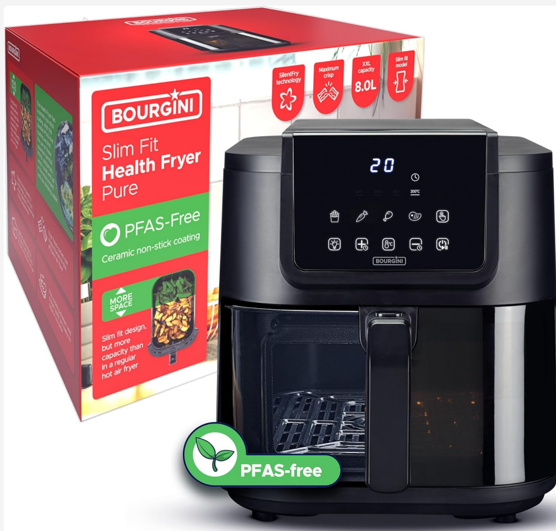
Image: The BOURGINI Air Fryer Pro 8L, showcasing its sleek black design alongside its product packaging, highlighting key features like PFAS-free coating and 8L capacity.

Thank you for choosing the BOURGINI Air Fryer Pro 8L. This appliance is designed to provide a healthier way to cook your favorite meals with minimal oil. Featuring a compact design, an 8-liter capacity, and an innovative PFAS-free ceramic non-stick coating, it ensures both efficiency and safety in your kitchen. Please read this manual thoroughly before use to ensure proper operation and maintenance.