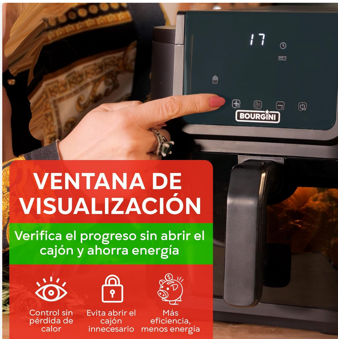
Image: A user interacting with the BOURGINI Air Fryer Pro, highlighting the convenient viewing window that allows monitoring of food without opening the drawer, thus saving energy.