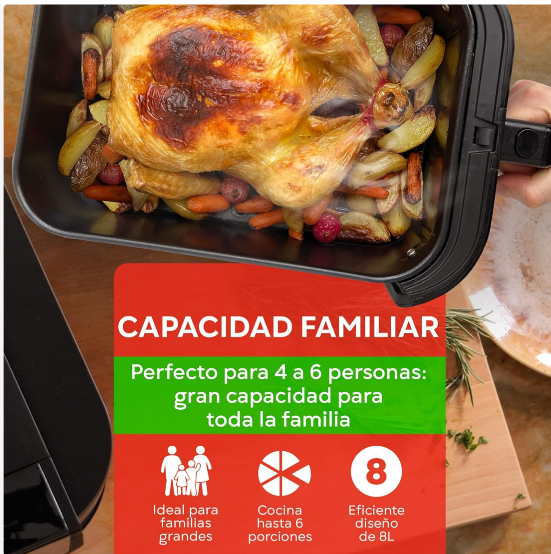
Image: The BOURGINI Air Fryer Pro's basket filled with a roasted chicken and vegetables, illustrating its large family-sized capacity suitable for 4 to 6 portions.