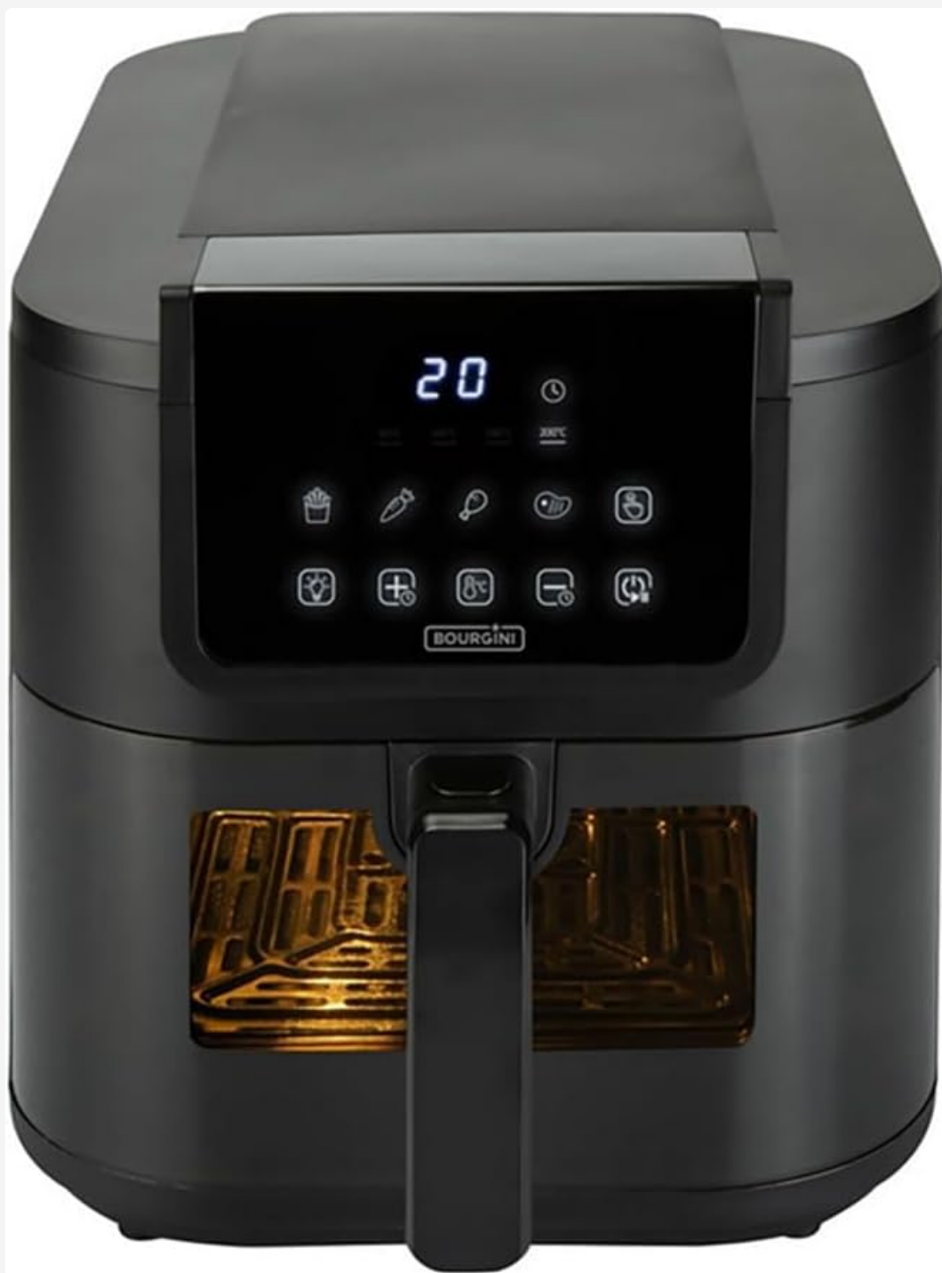
Image: A direct front view of the BOURGINI Air Fryer Pro, showing its digital control panel and the transparent viewing window of the cooking basket.

Familiarize yourself with the parts of your BOURGINI Air Fryer Pro.