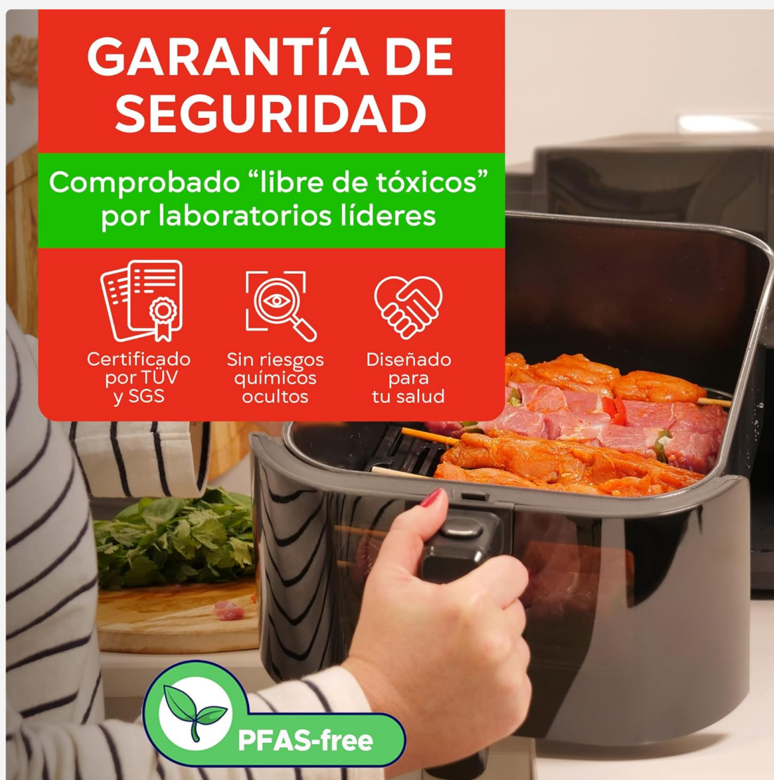
Image: The BOURGINI Air Fryer Pro highlighting its safety features and certifications, emphasizing its "toxic-free" composition verified by leading laboratories.