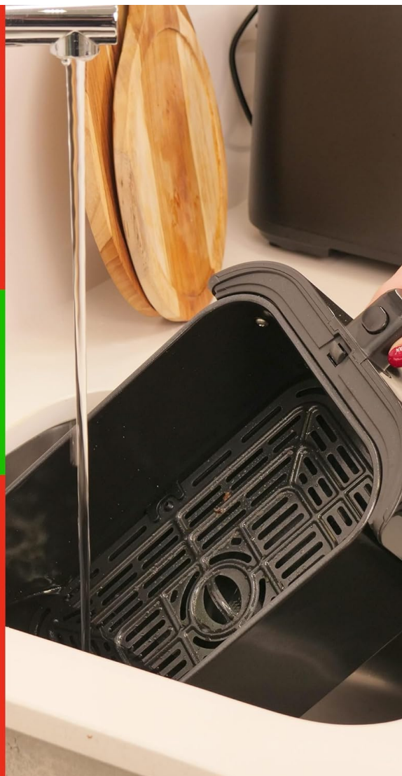
Image: The removable basket and grill rack of the BOURGINI Air Fryer Pro being rinsed under a faucet, demonstrating the ease of cleaning due to its ceramic coating.

Bandeja amovible para mayor comodidad al limpiar