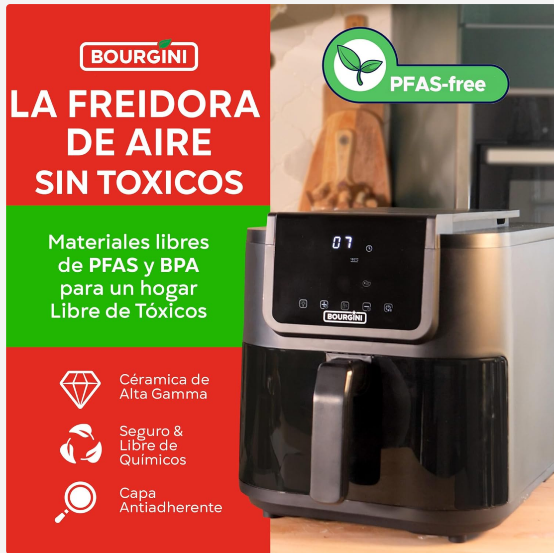
Image: The BOURGINI Air Fryer Pro with text emphasizing its "toxic-free" nature, highlighting the use of PFAS and BPA-free materials and high-grade ceramic coating.