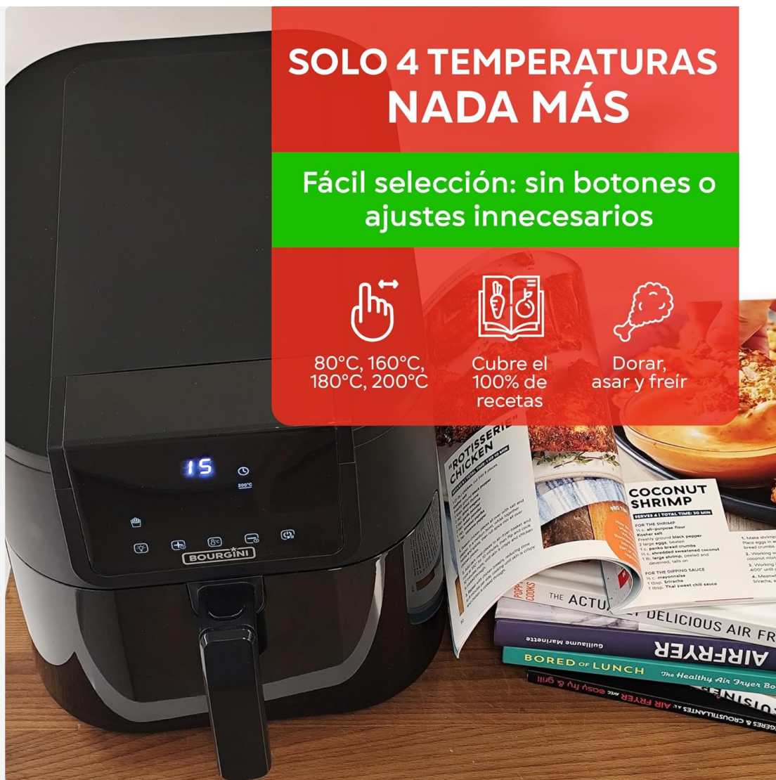
Image: The BOURGINI Air Fryer Pro's digital control panel, illustrating the simplified temperature selection with only four main settings, making operation straightforward.