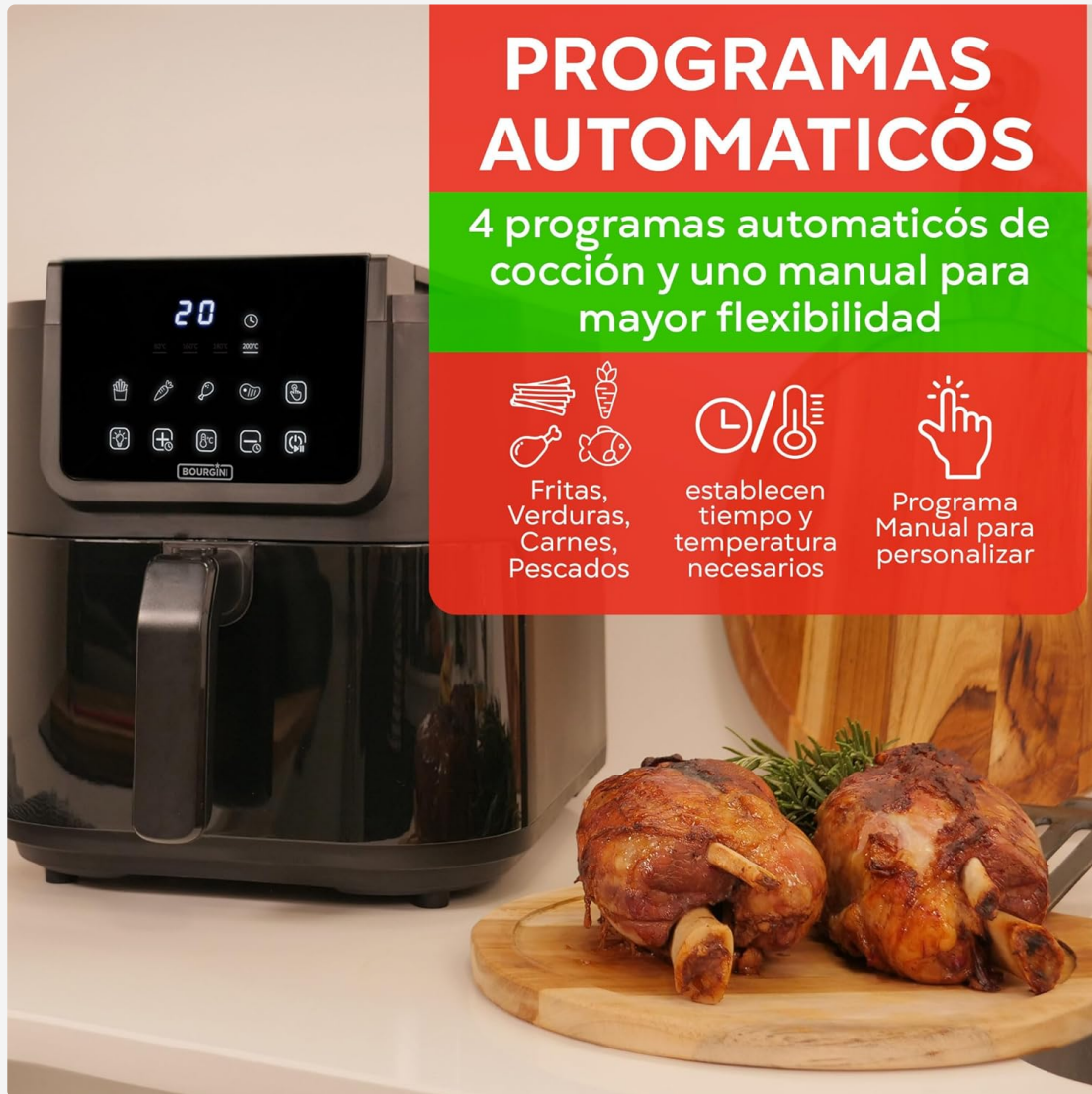
Image: The BOURGINI Air Fryer Pro's digital control panel displaying various automatic cooking programs for different food types like fries, vegetables, meats, and fish.

The BOURGINI Air Fryer Pro features an intuitive digital touch control panel.