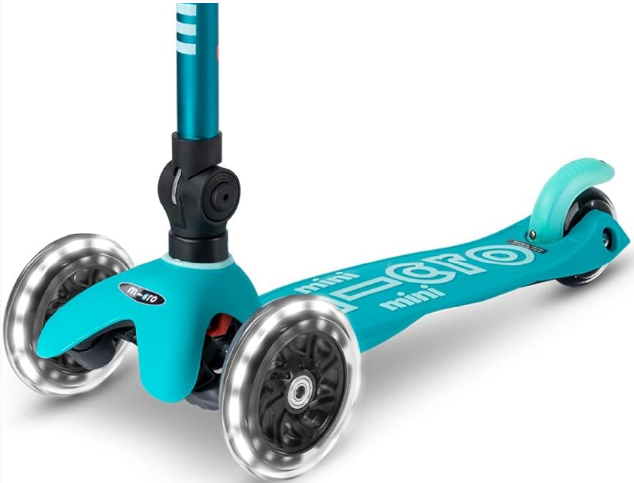
Image: Front view of the Micro Mini Deluxe Foldable LED Scooter in Aqua.