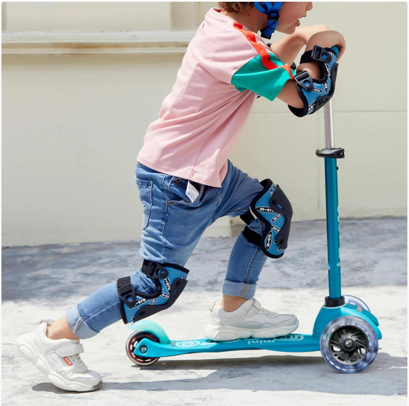
Image: A child safely riding the Micro Mini Deluxe scooter, wearing a helmet and protective pads.