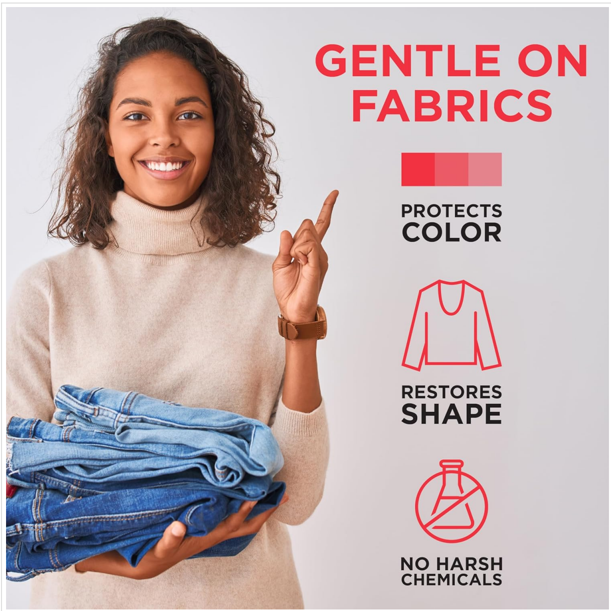
Image: dryel's gentle action on fabrics, protecting color and shape without harsh chemicals.