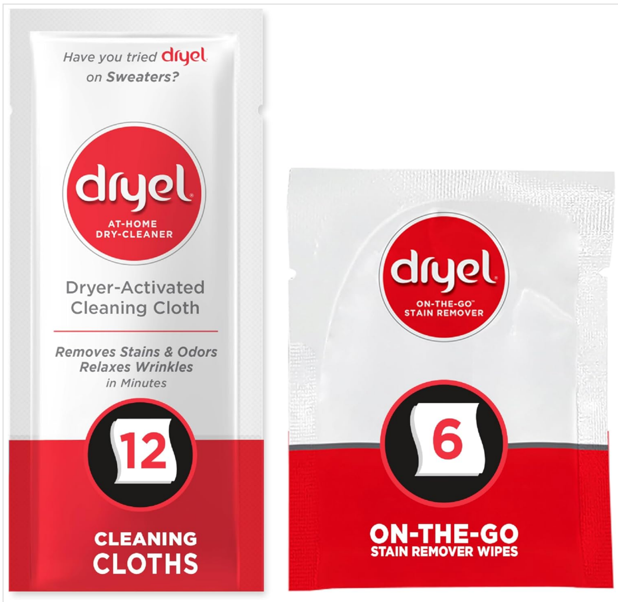
Image: dryel At-Home Dry Cleaner Refill kit showing cleaning cloths and stain remover wipes.