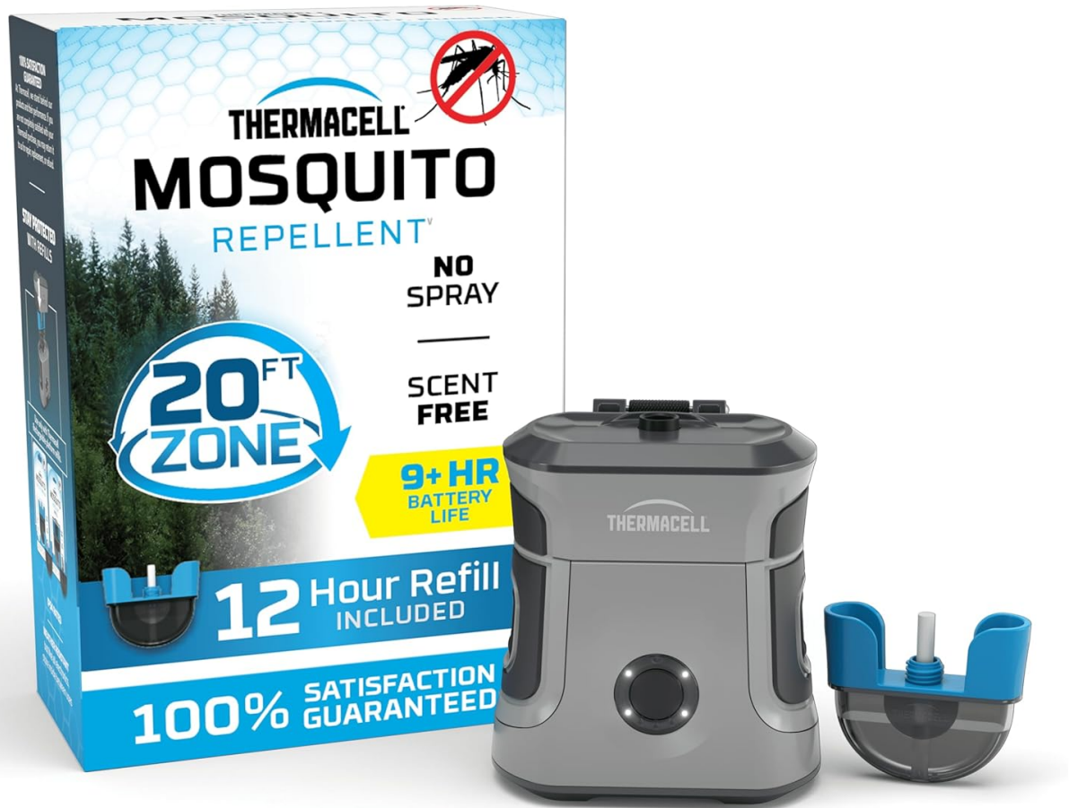
The Thermacell EX90 Mosquito Repellent device and its packaging.