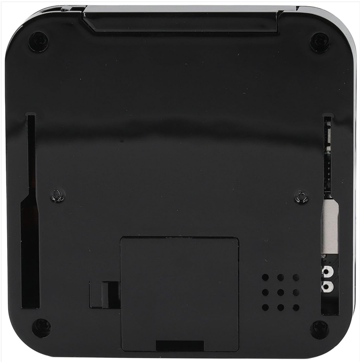
Figure 4.2: Monitor Unit Rear View (Battery Compartment)