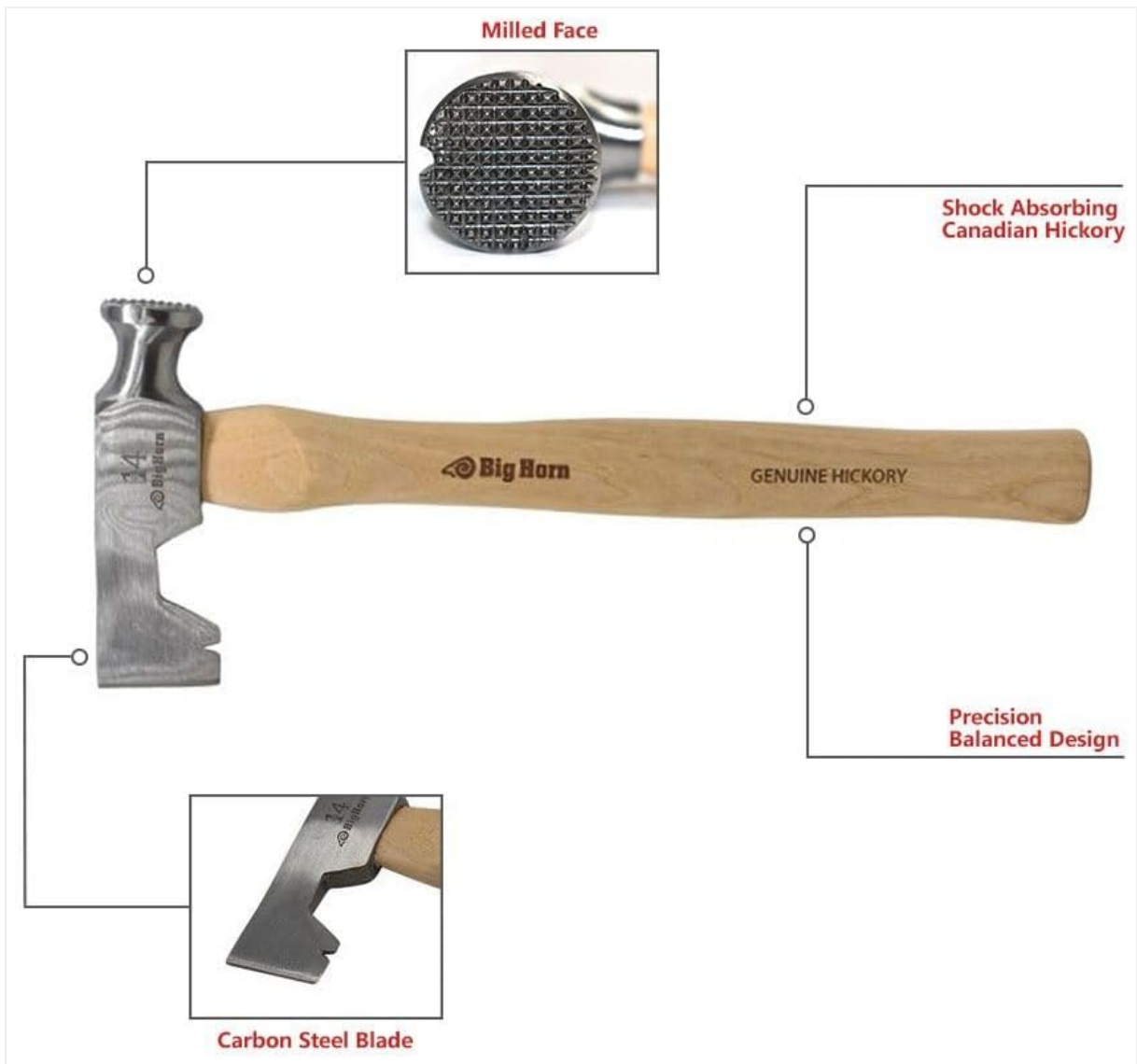
Figure 2: Key features of the drywall hatchet, including the milled face, shock-absorbing hickory handle, and carbon steel blade.