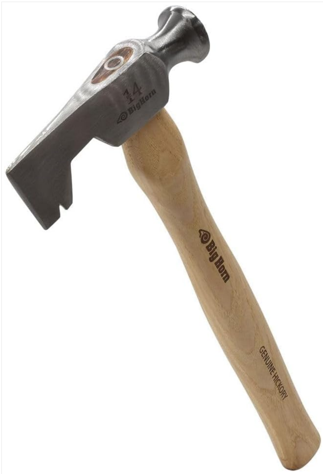
Figure 1: The Big Horn 15140 14 Oz Drywall Hatchet, showcasing its overall design with the steel head and hickory handle.