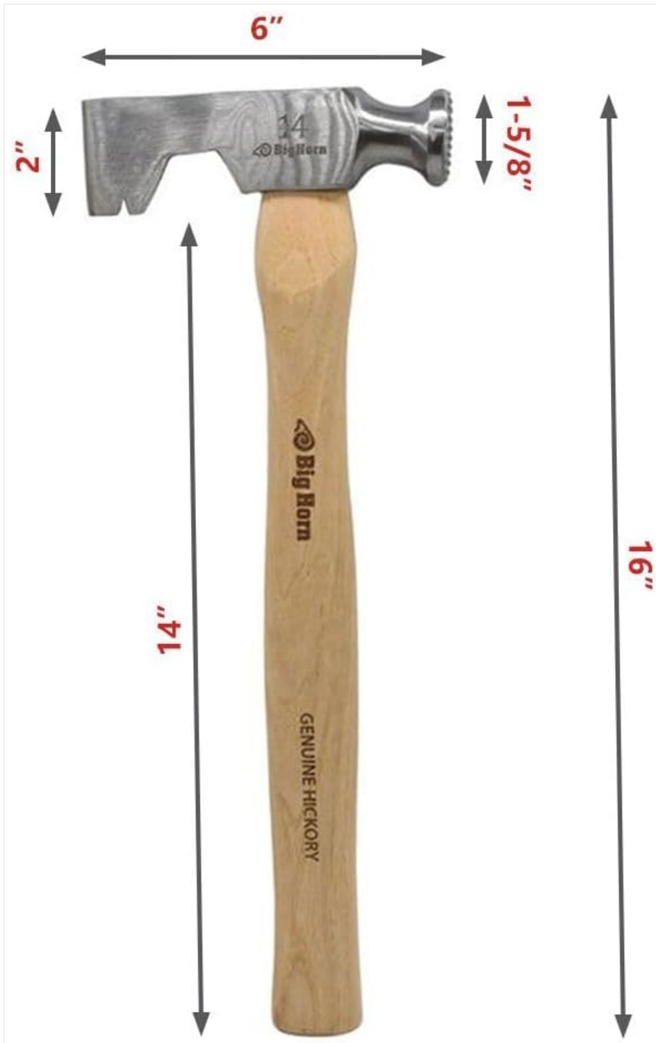
Figure 5: Dimensional overview of the Big Horn 15140 Drywall Hatchet.

Detailed specifications for the Big Horn 15140 Drywall Hatchet: