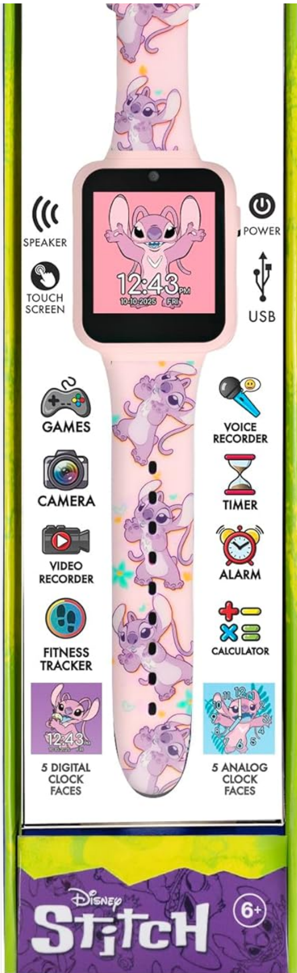
Image 2.1: The smartwatch packaging, illustrating the device and its key features such as camera, games, and fitness tracker.