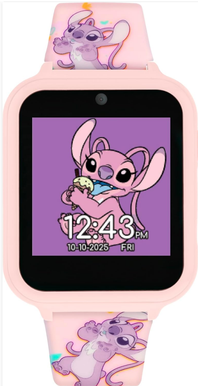
Image 1.1: Front view of the Disney Lilo & Stitch Angel Smartwatch, showing the digital display with an Angel character eating ice cream and the current time.