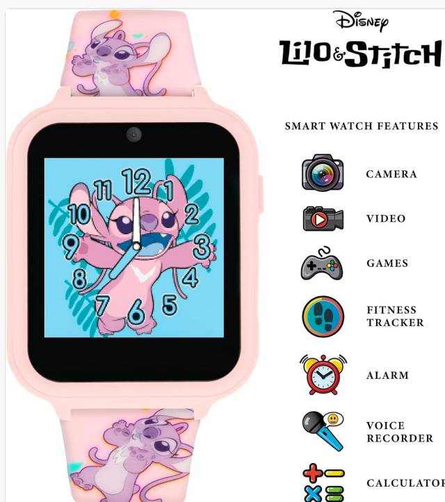
Image 4.1: The smartwatch highlighting its interactive features, including camera, video recording, games, fitness tracking, alarm, voice recorder, and calculator.

Your smartwatch features a touch screen for navigation and interaction. Swipe left/right or up/down to access different functions and tap to select.