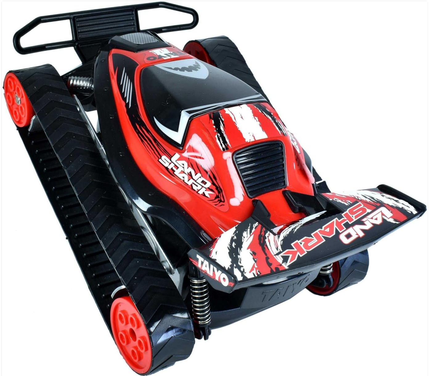
Image: An angled side view of the Taiyo Land Shark RC Car, showcasing its red and black body, track system, and suspension details.