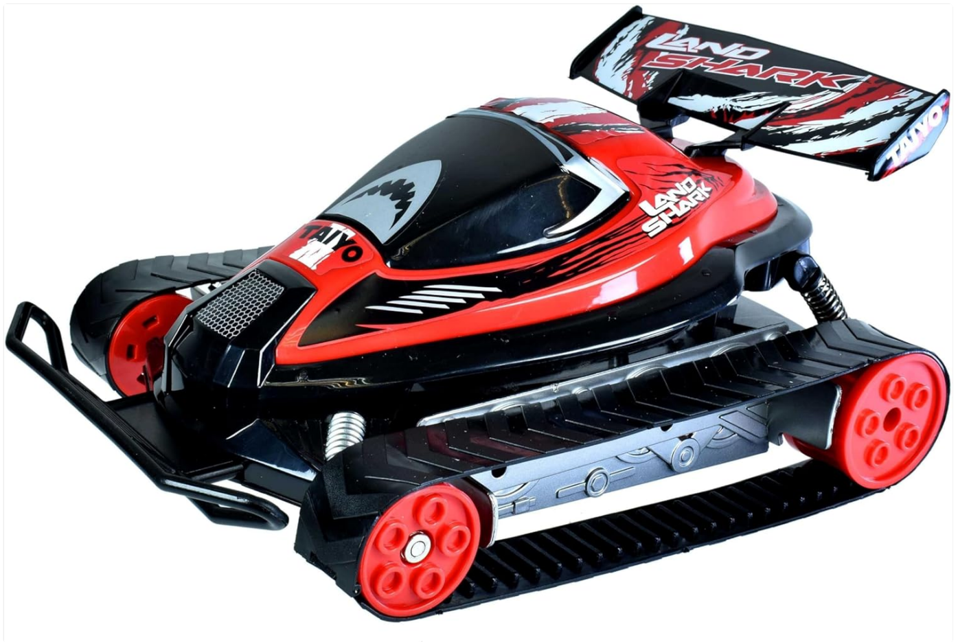
Image: An angled front view of the Taiyo Land Shark RC Car, emphasizing its robust track system and front bumper.