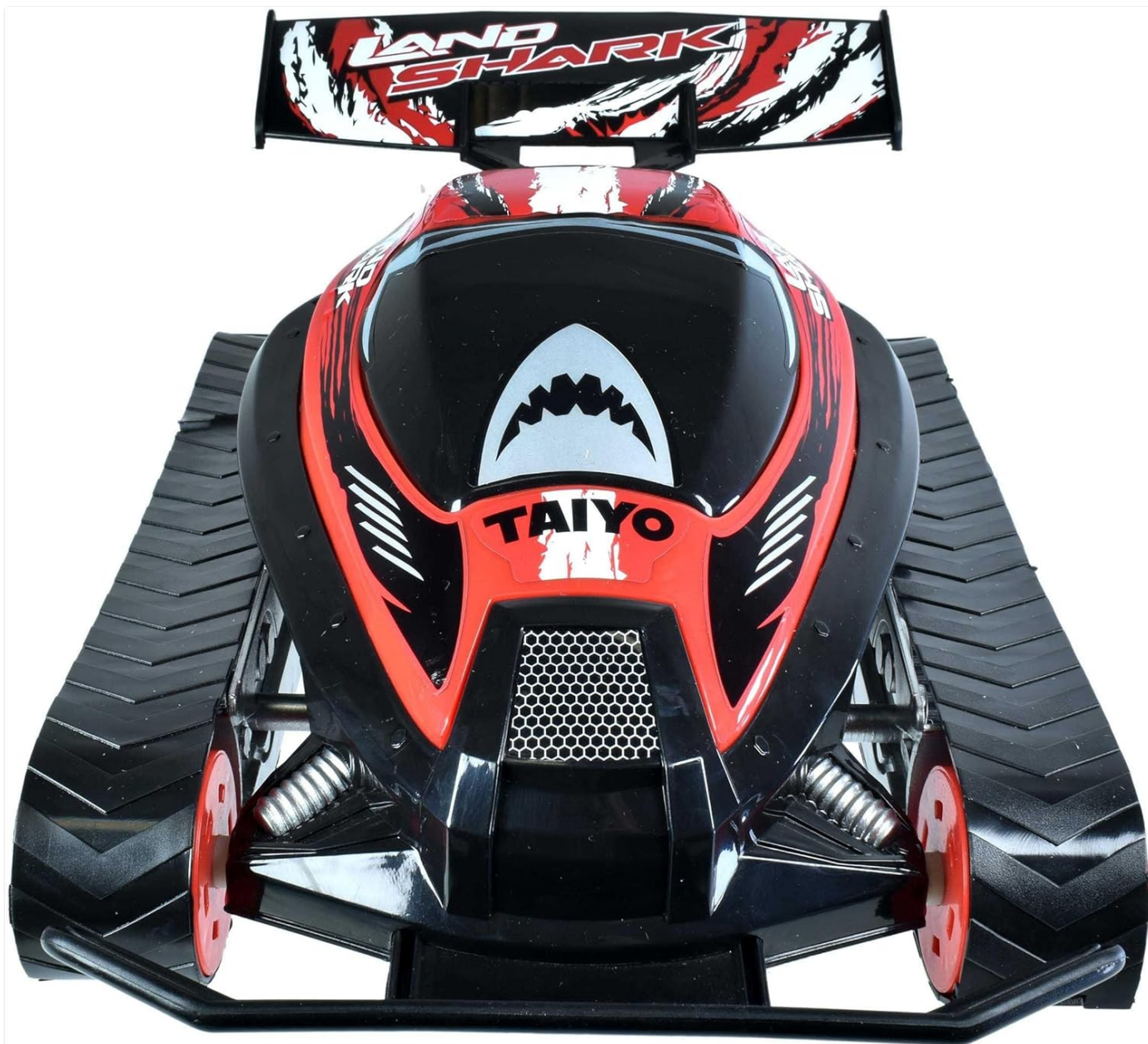
Image: A direct front view of the Taiyo Land Shark RC Car, highlighting its black and red body, shark-mouth decal, and robust track system.