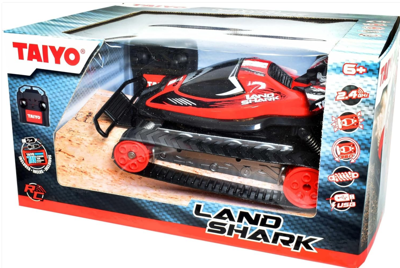
Image: The Taiyo 1:8 Radio Control Land Shark Car Toy displayed in its red and black retail packaging, showcasing the car and its remote control.

Thank you for choosing the Taiyo 1:8 Radio Control Land Shark Car Toy. This manual provides essential information for the safe and optimal use of your new remote-controlled vehicle. The Land Shark is designed for versatile play, offering durable performance for both indoor and outdoor environments. Please read this manual thoroughly before operating the product.