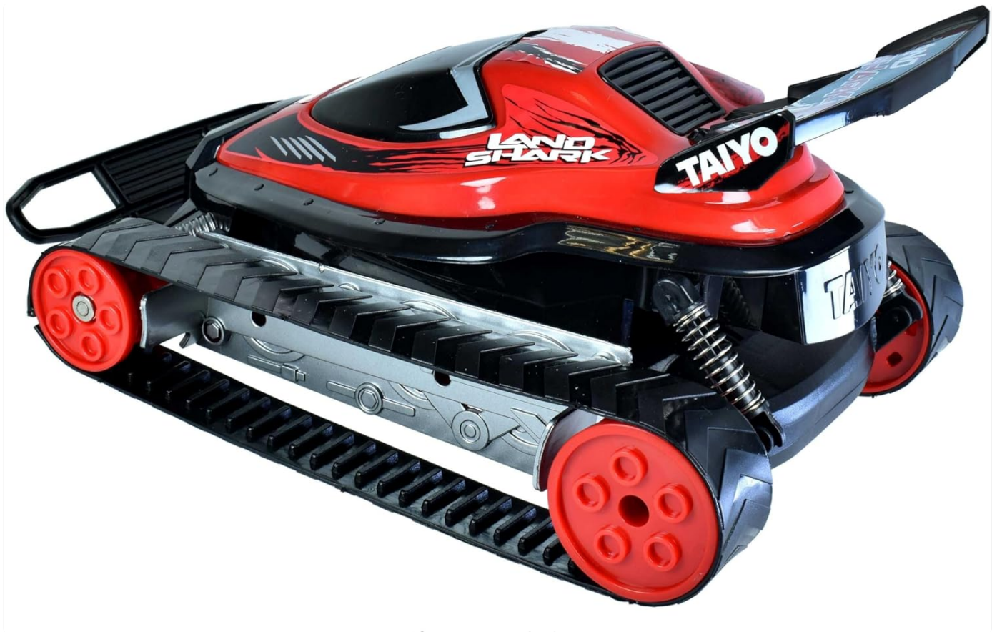
Image: A rear angled view of the Taiyo Land Shark RC Car, showing its spoiler, track system, and the red and black color scheme.