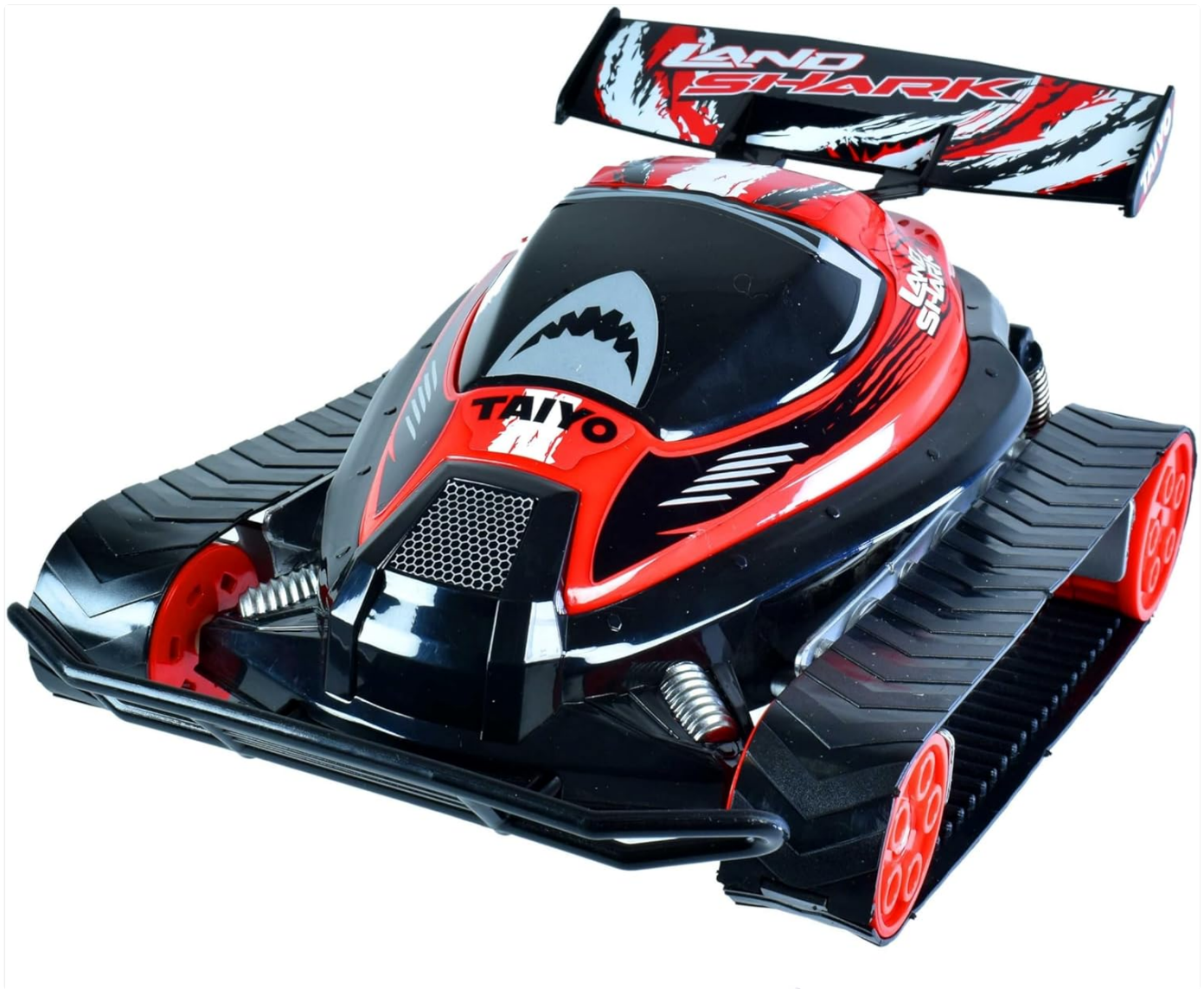
Image: A slightly different angled front view of the Taiyo Land Shark RC Car, showcasing its aggressive design and track-based propulsion system.