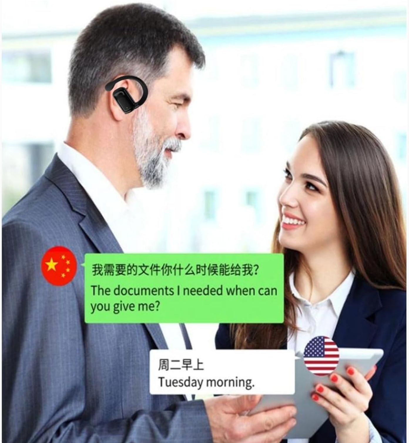
Image: Two individuals conversing, one wearing a BL02 earbud, with a smartphone displaying a translated conversation from Chinese to English, demonstrating the 144 Languages Voice Translator capability.

Wireless translator device supports more than 144 languages online translation( of for one year), so that communicate is more effective and convenient.