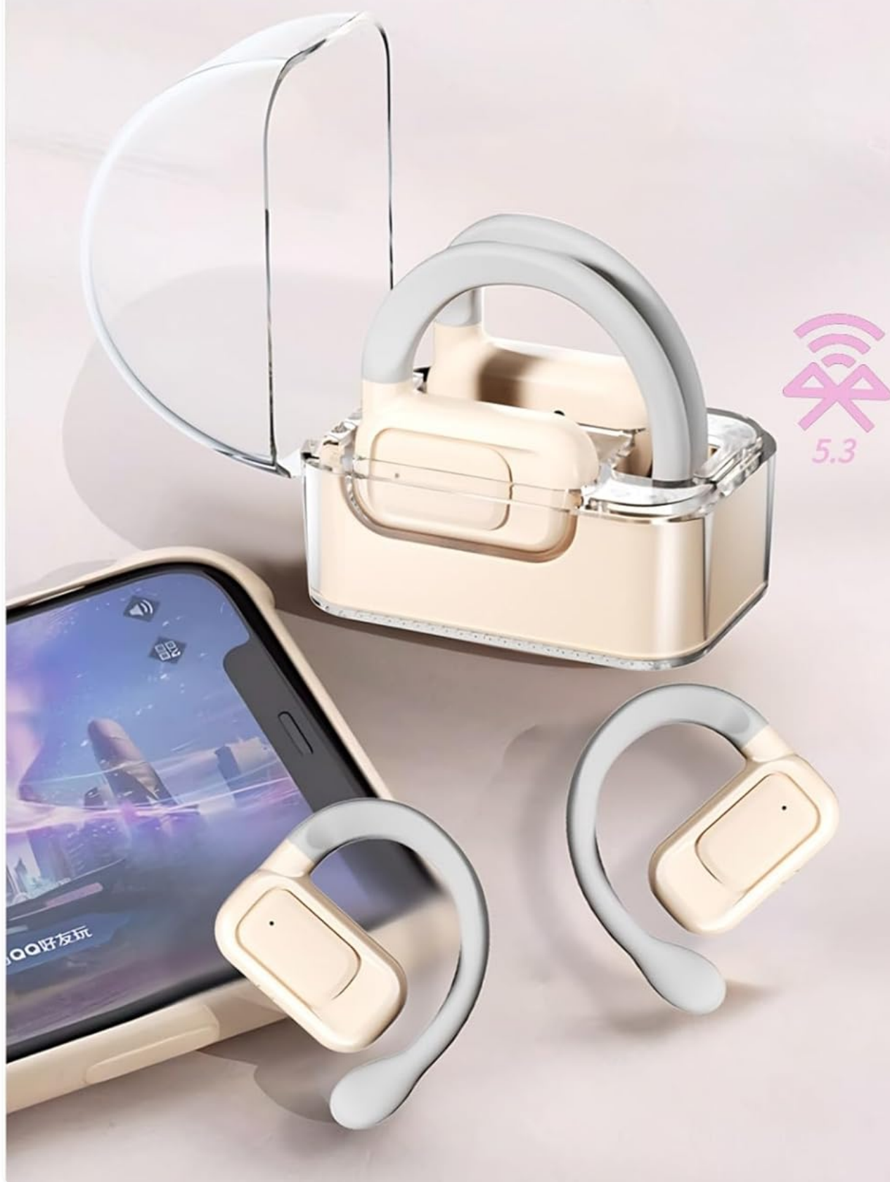
Image: A pair of BL02 Earbuds next to a smartphone, with a Bluetooth V5.3 icon indicating high performance and stable transmission.

Bluetooth V5.3 new chip, higher performance, high-speed and stable transmission, latency as low as 50ms.