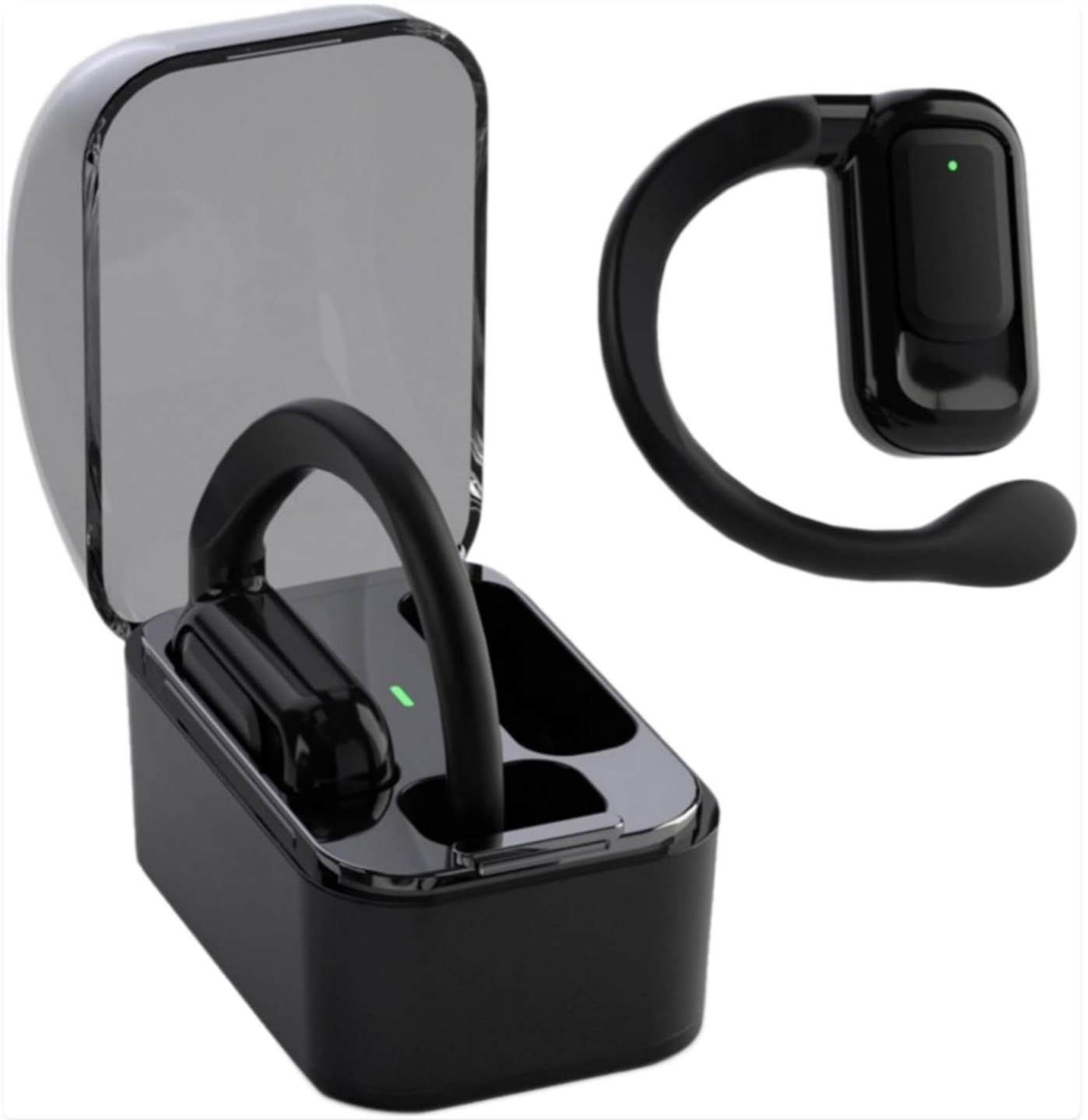
Image: The BL02 Language Translator Earbuds, showing one earbud removed from its open charging case, alongside a single earbud. The earbuds and case are black.